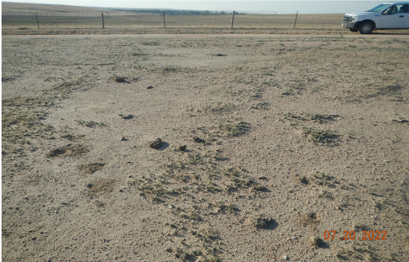
Photo 2. Center of the location facing southeast. The location has not established desirable vegetation cover of at least 80% of reference area levels.