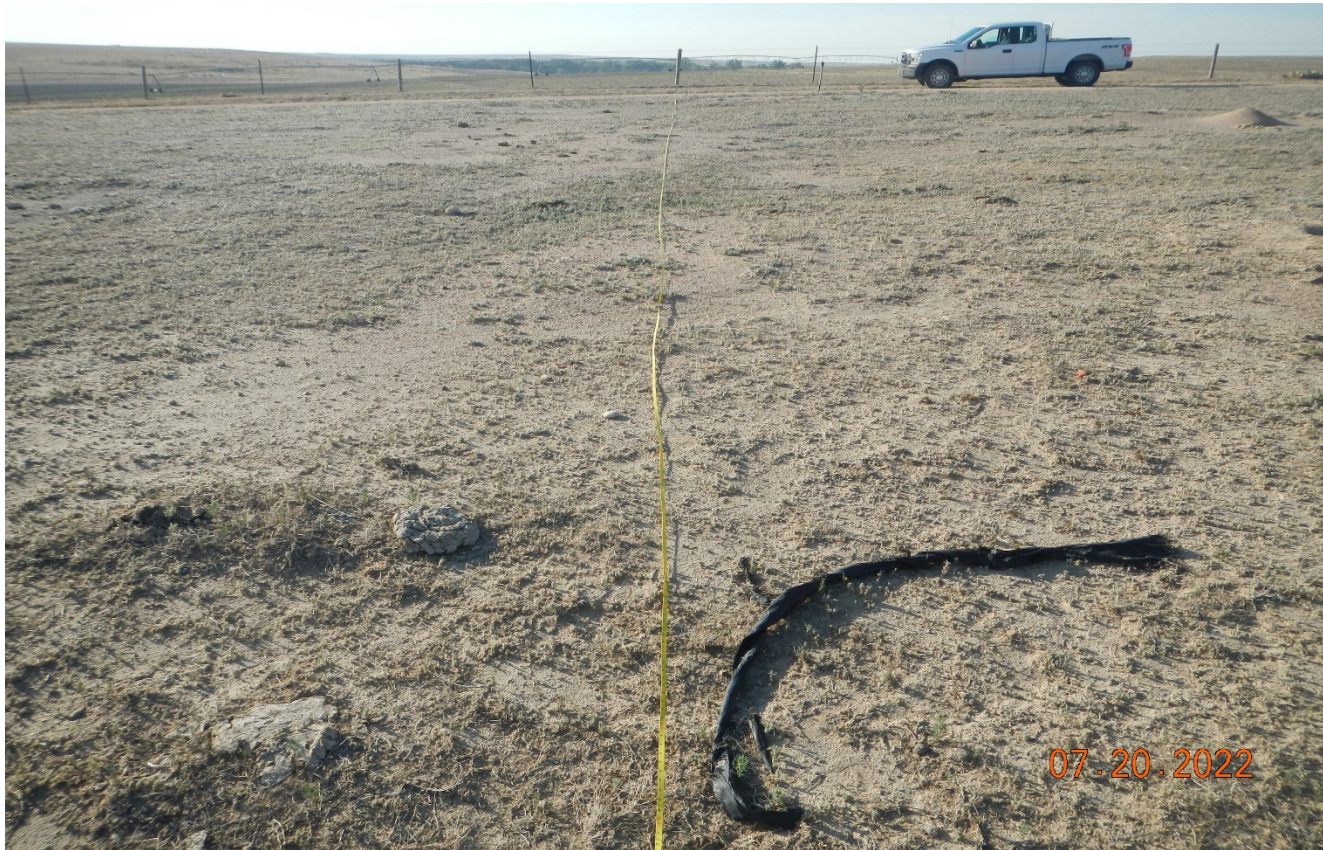
Photo 3. Facing southeast at the location. A 100 ft. tape measure is placed across the location for scale. This area does not have sufficient vegetation establishment and consists of undesirable weeds (Kochia). There is a piece of silt fence debris shown in the photo.