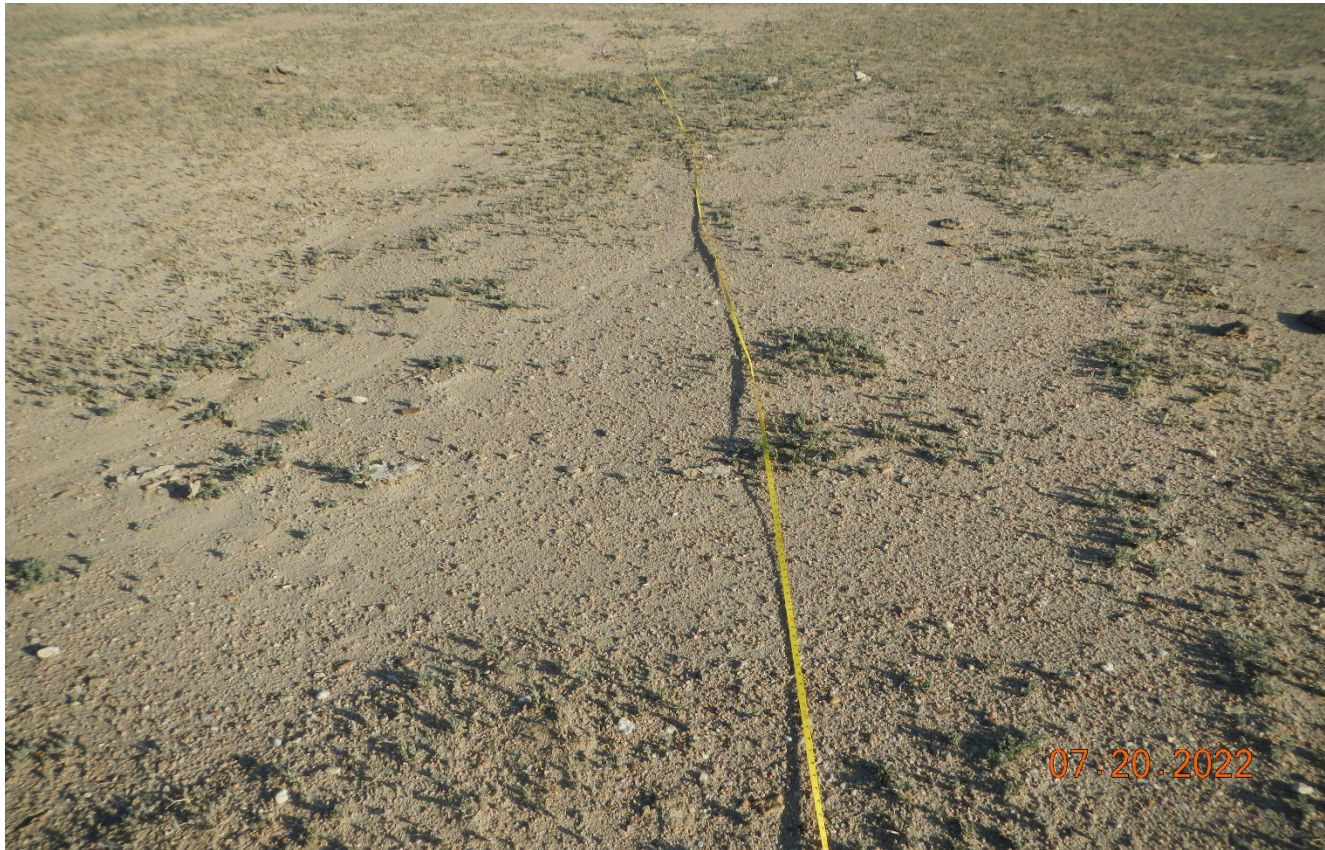
Photo 4. View of groundcover at the center of the location shows bare soils as well as undesirable weeds (Kochia).