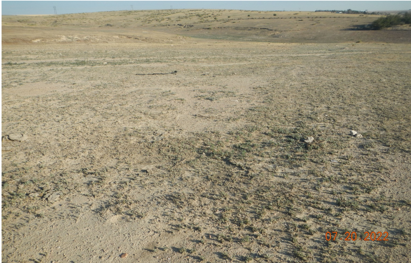
Photo 1. Facing northwest toward the location.. The location has not established desirable vegetation cover of at least 80% of reference area levels.