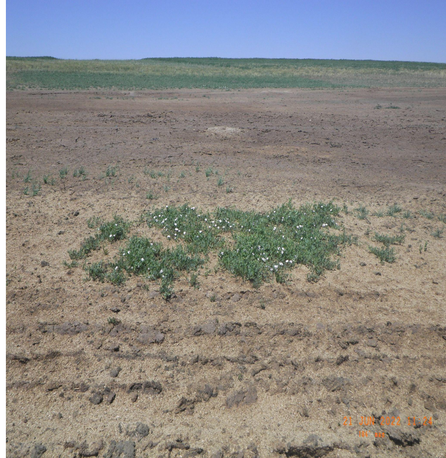
Photo 4. Cardinal photos taken from the middle of the tank battery. Left photo facing south, right photo facing west. Note: well pad shows minimal vegetation establishment and is dominated by field bindweed (a List C Colorado noxious weed species).