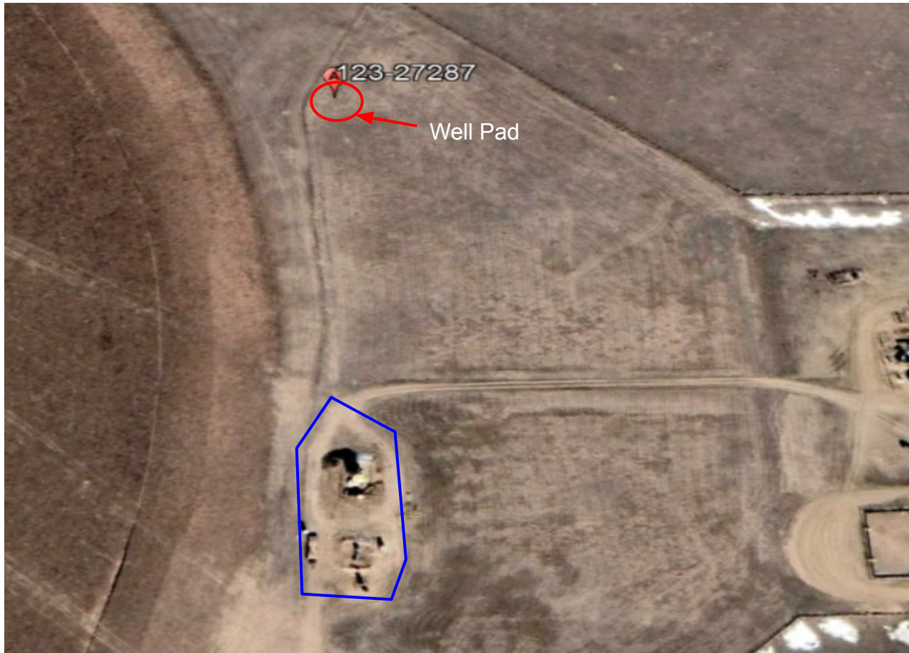
Photo 1. 2020 aerial imagery of the well pad (north is up). Note: tank battery, highlighted in blue, is associated with the Zahourek 42-31 well API #123-27289.