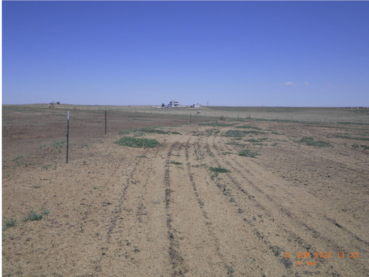
Photo 2. Overview photo of the well pad taken at ground level from the southern edge looking north. Note: well pad and surrounding area have been hydro mulch with no evidence of vegetation growth.