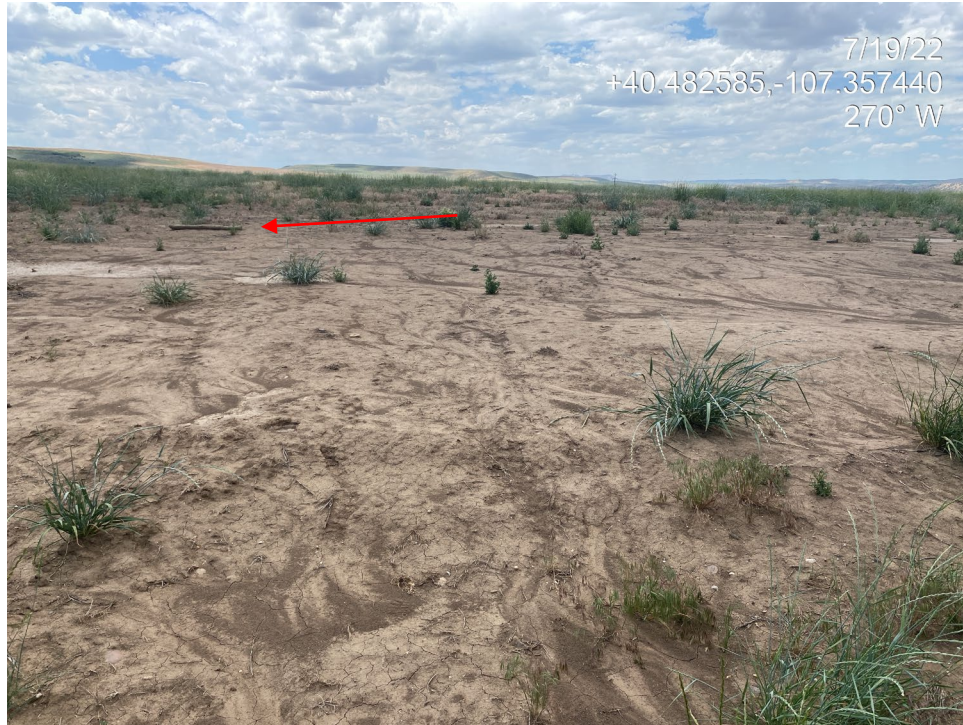
Photo 9. Photo taken from the east of the Location shows where perennial grasses have failed to establish. Bare and exposed soil dominates. Water flow patterns are evident, indicating soil erosion. Note also the wooden post left on Location (equipment/debris)