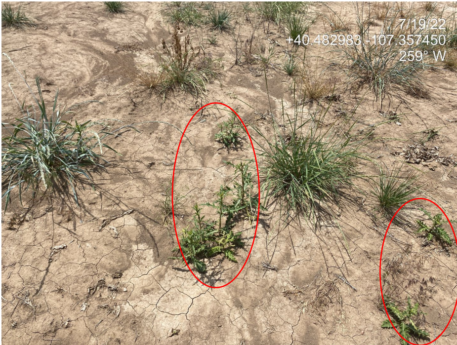
Photo 7. Photo taken from the northeast shows Canada thistle (List B Noxious Weed).