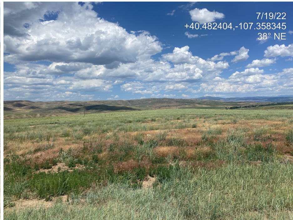
Photo 2. Photo taken from the south shows an overview of the Location.