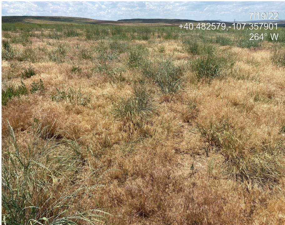
Photo 5. Photo taken from the center of the Location shows areas dominated by cheatgrass (List C Noxious Weed).