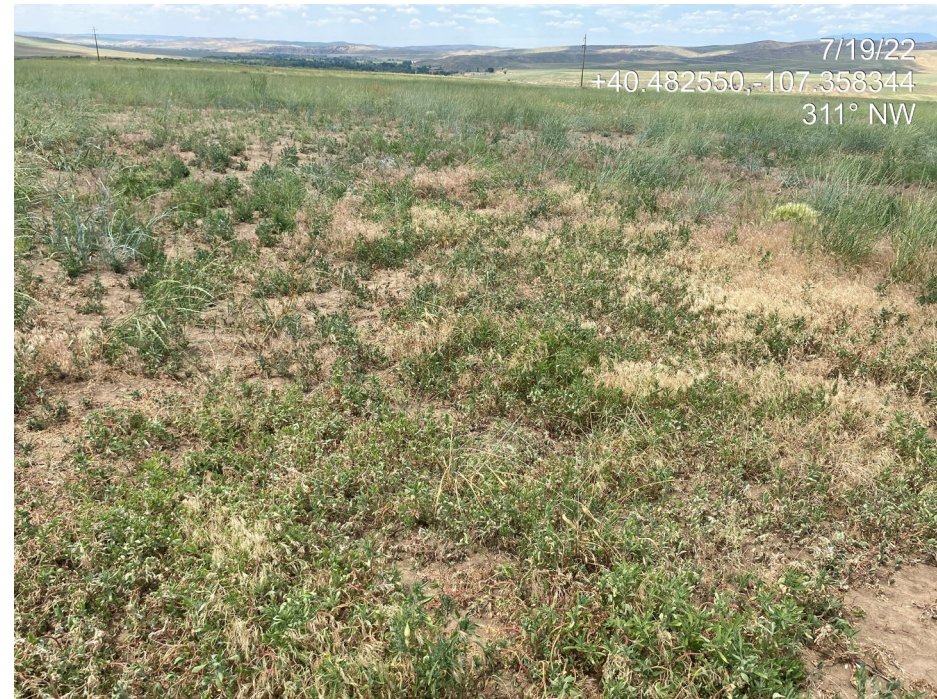
Photo 6. Photo taken from the southwest shows areas dominated by kochia (undesirable plant species) and cheatgrass (List C Noxious Weed).