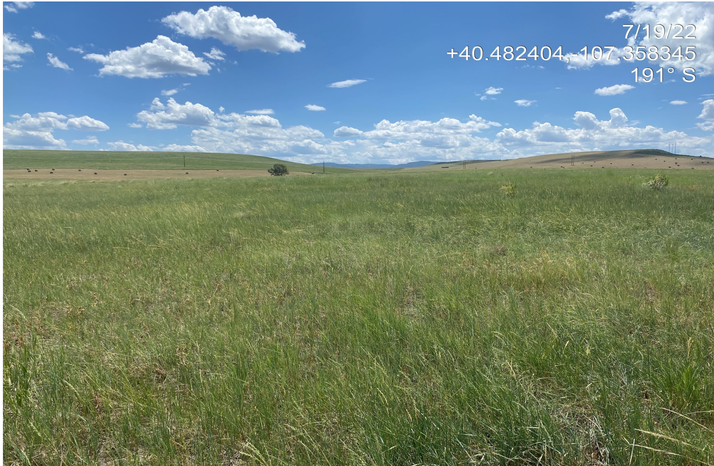
Photo 11. Photo taken from to the south of the Location shows reference area vegetation.