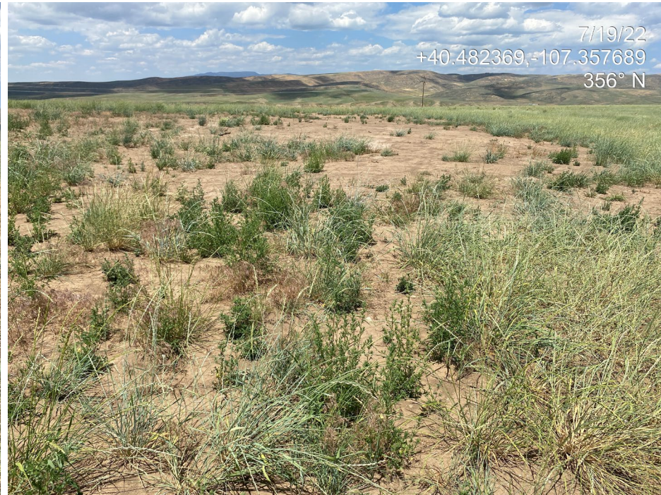
Photo 4. Photo taken from the east shows the vegetation community on Location. Note large patches of bare ground. Vegetation establishment is not uniform.