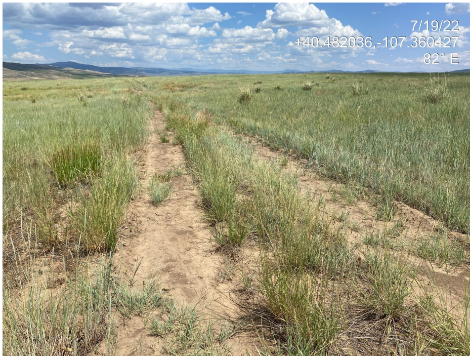
Photo 1. Photo taken from the west of the Location shows the access road. Perennial grass is failing to establish in the tracks.