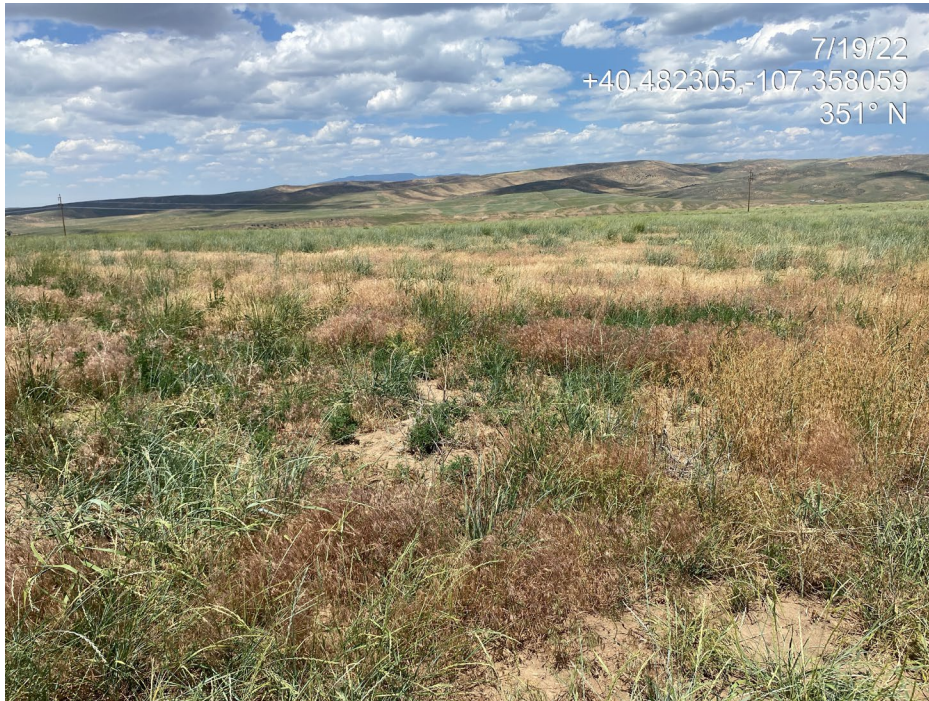
Photo 3. Photo taken from the south shows the vegetation community on Location. Light green vegetation is desirable perennial grasses. Dark green, brown and red vegetation is undesirable plant species and noxious weeds.