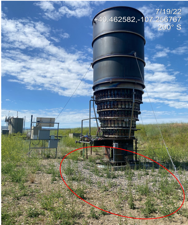
Photo 7. Photo taken from the northwest of the Location shows an example of Canada thistle, a CO List B Noxious Weed found throughout the Location. Photo also shows the working pad area is overgrown.