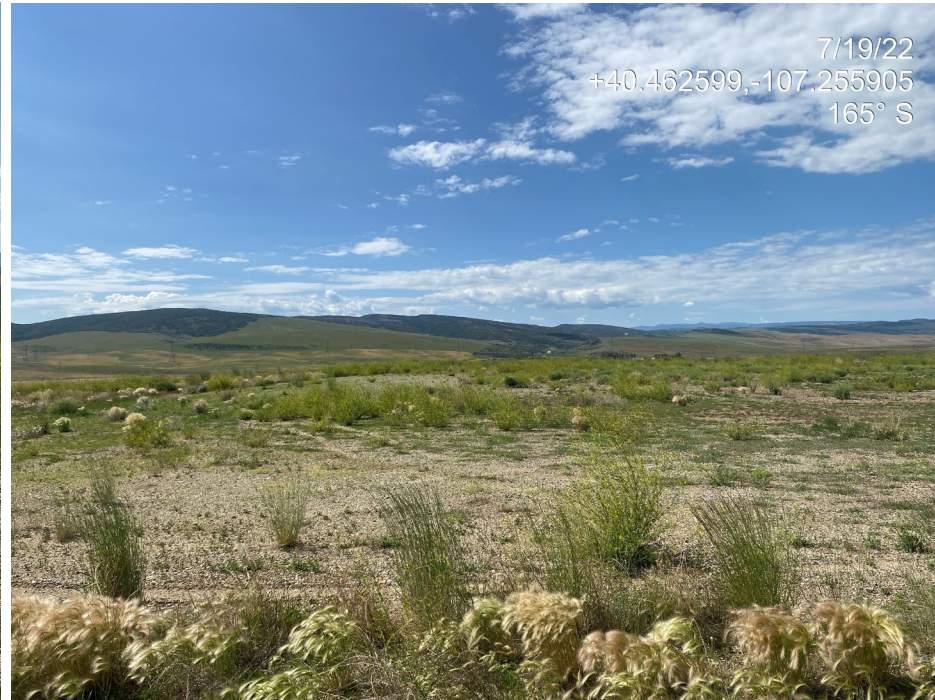
Photo 4. Photo taken from the north of the Location shows the eastern portion of the Location which does not appear necessary for production operations. Interim reclamation has not been performed.