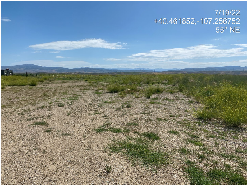
Photo 3. Photo taken from the Location entrance shows an overview of the southern portion of the Location which does not appear necessary for production operations. Interim reclamation has not been performed.