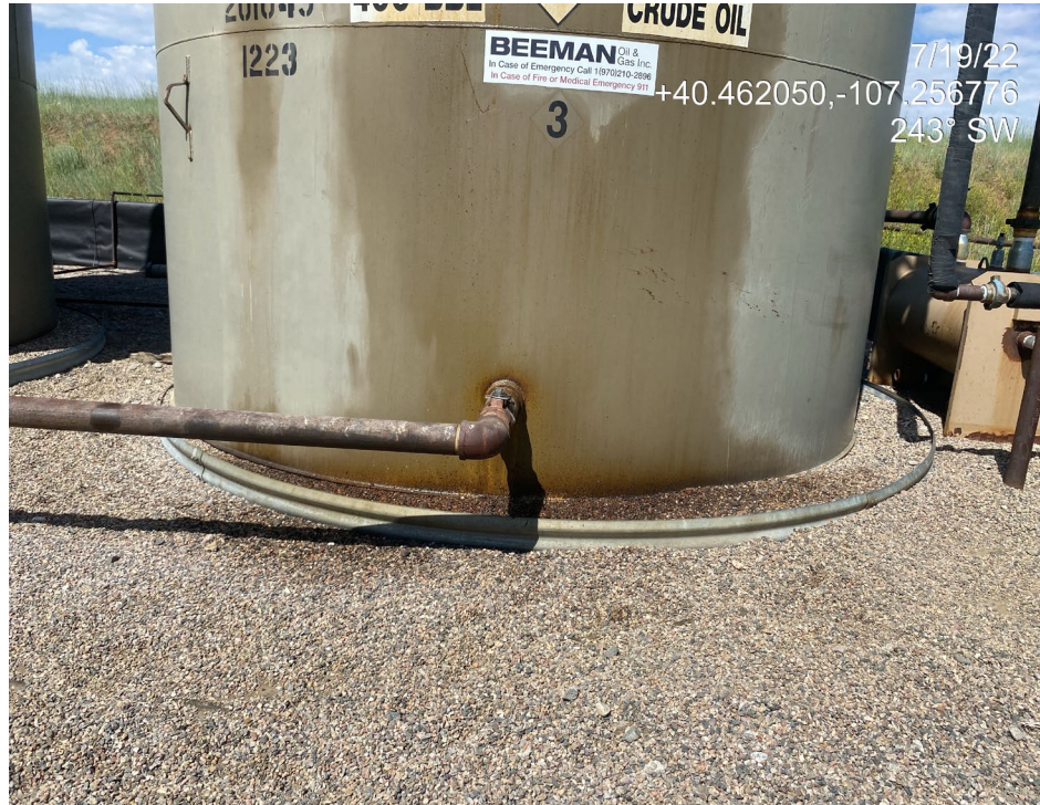
Photo 9. Photo taken from the tank battery at the west of the Location shows the northernmost tank appears to have spilled from the top of the tank. Impacted soils are present within secondary containment.