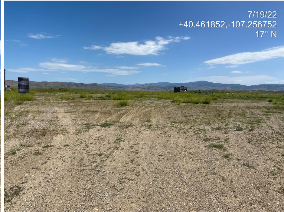
Photo 2. Photo taken from the Location entrance shows an overview of the center of the Location.