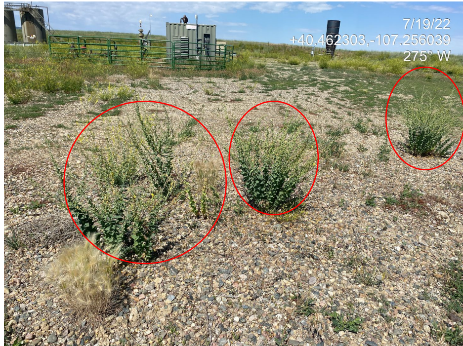
Photo 5. Photo taken from the center of the Location shows an example of Dalmatian toadflax, a CO List B Noxious Weed found throughout the Location.