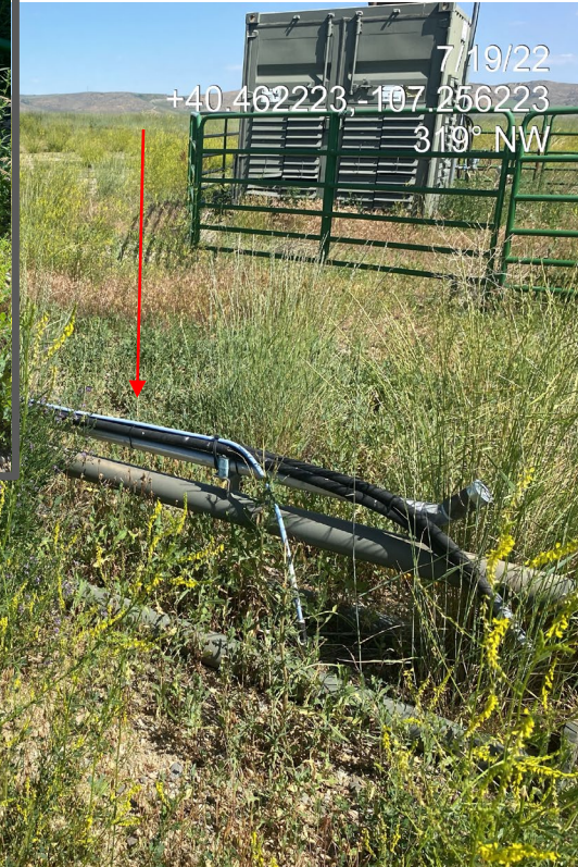
Photo 8. Photos taken from the well area shows unused equipment and the Location is overgrown, including around production equipment.