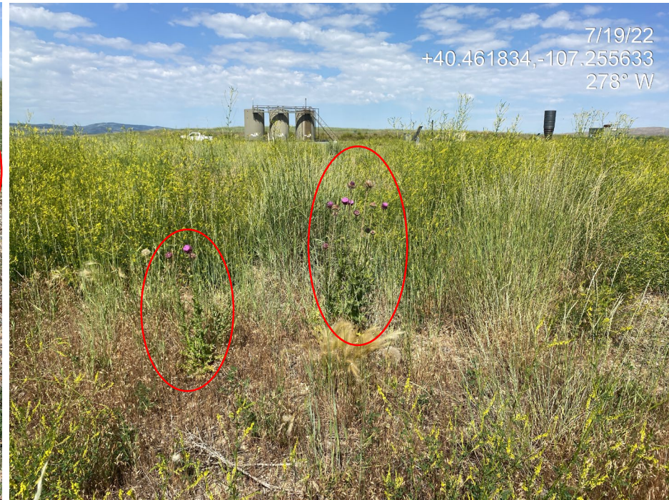
Photo 6. Photo taken from the southeast of the Location shows an example of musk thistle, a CO List B Noxious Weed found throughout the Location.