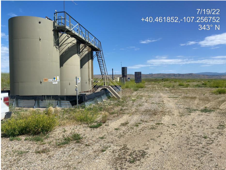
Photo 1. Photo taken from the Location entrance shows an overview of the western portion of the Location.