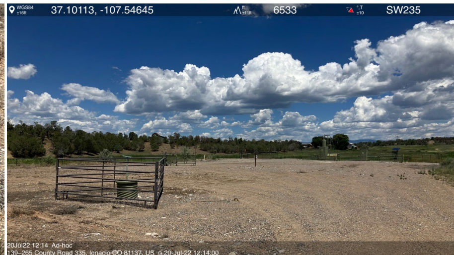
IMG 02 Location overview