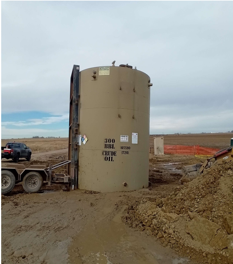
Northern AST AST= Above-Ground Storage Tank