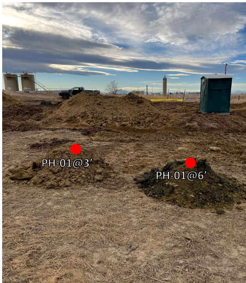
PH sampling locations looking northwest.