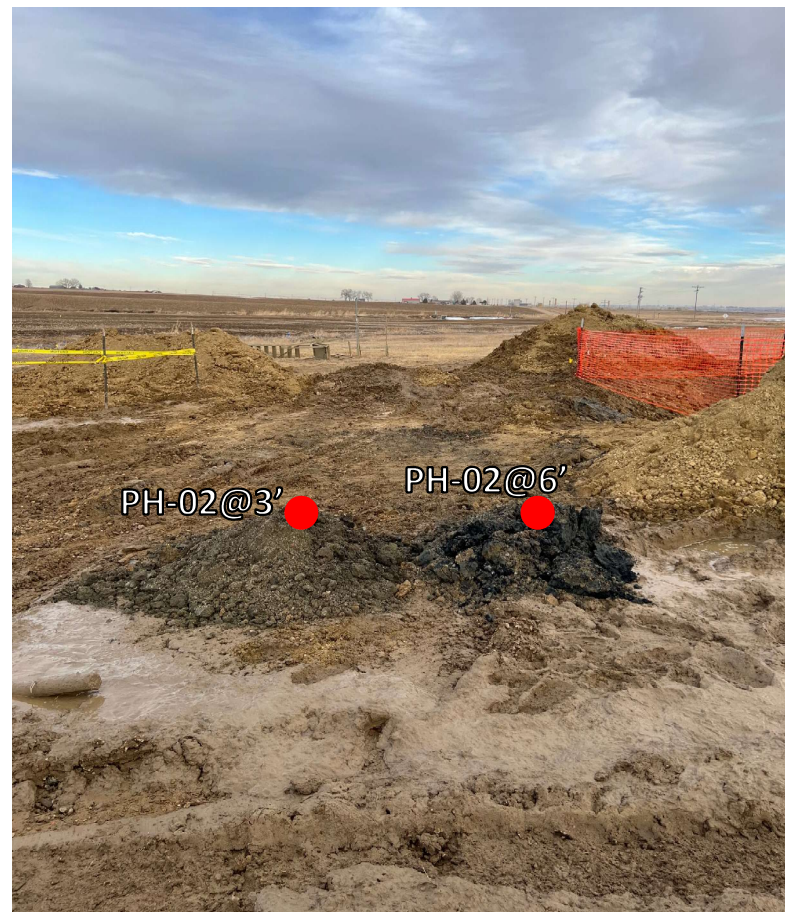
PH sampling locations looking east.