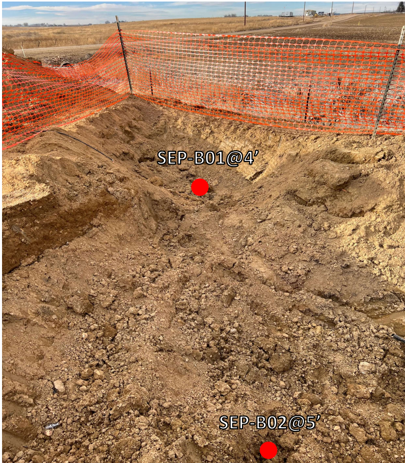
Separator base sample locations looking northwest