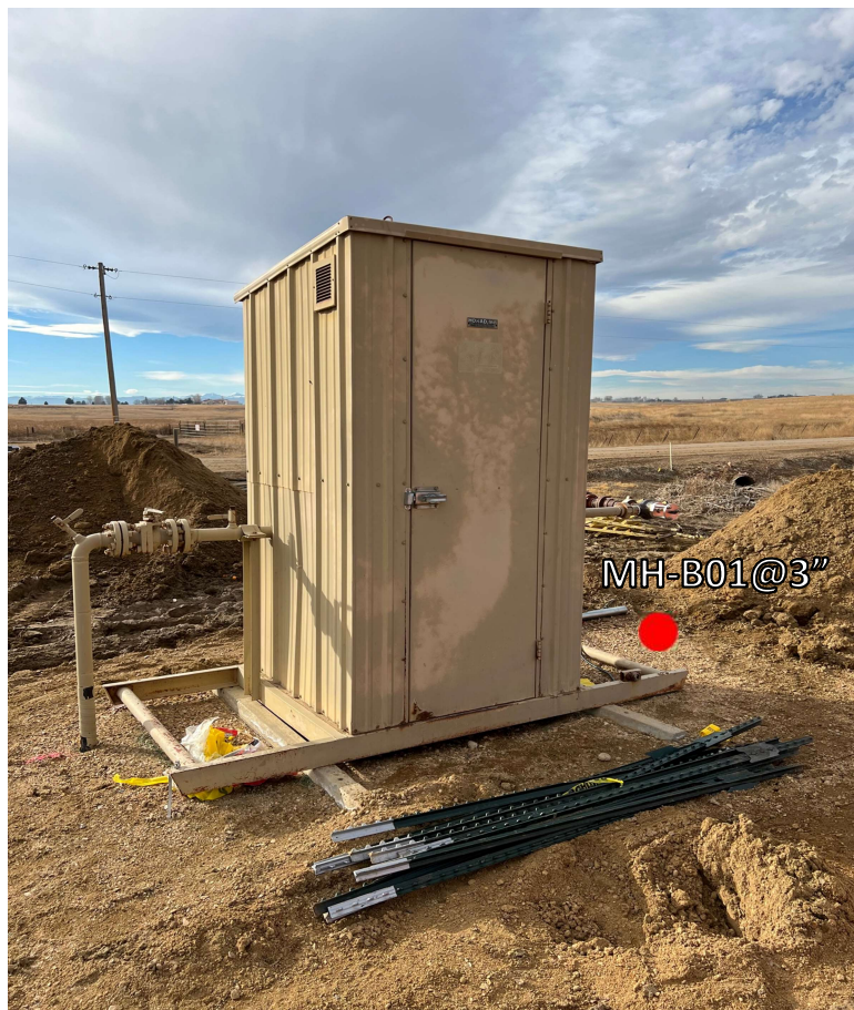
Meter house soil screening location looking northwest