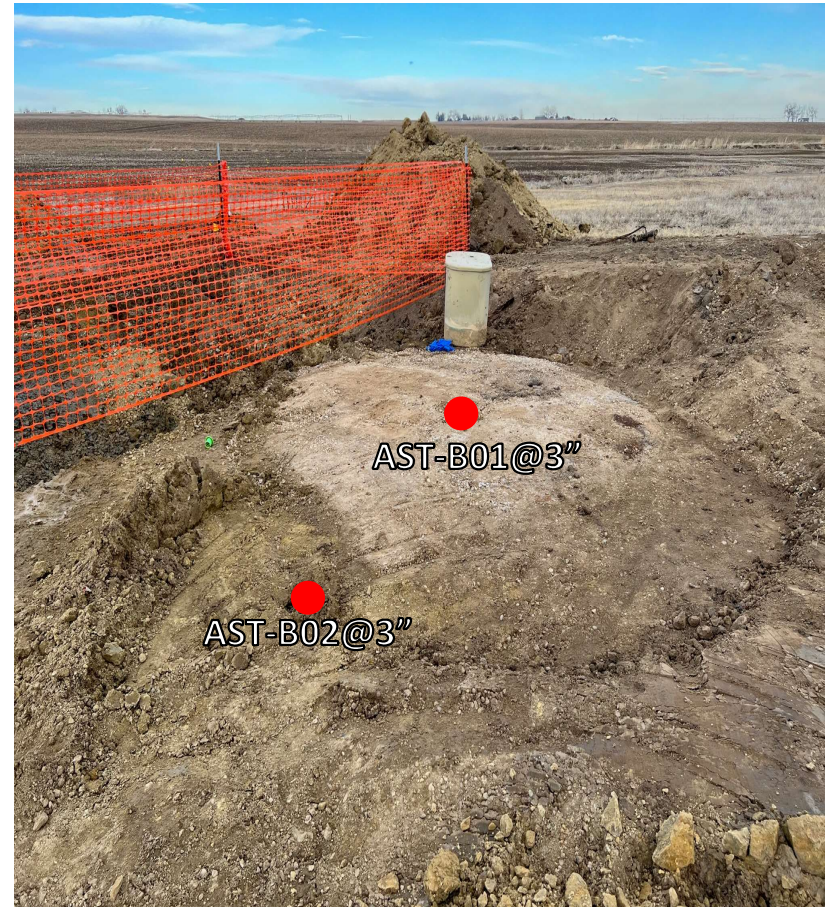
AST surface sample locations looking northwest.