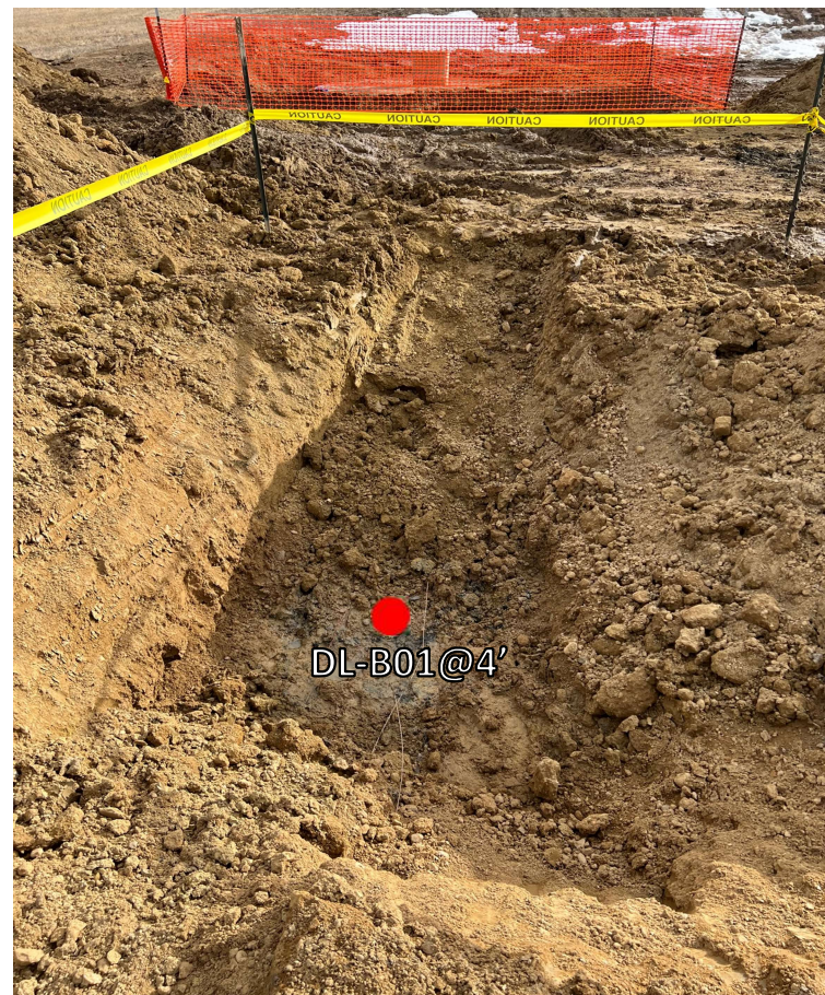
Dump line screening location looking south.