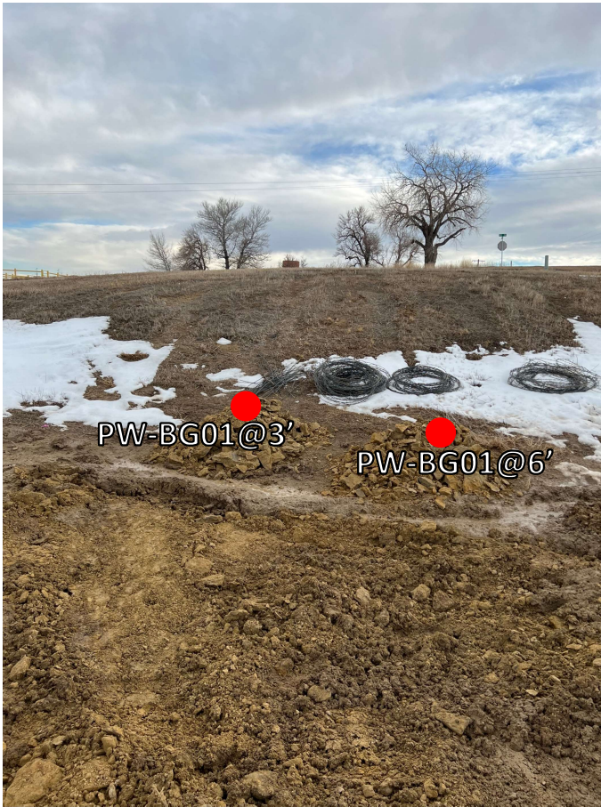
Produced water background sample locations looking south.