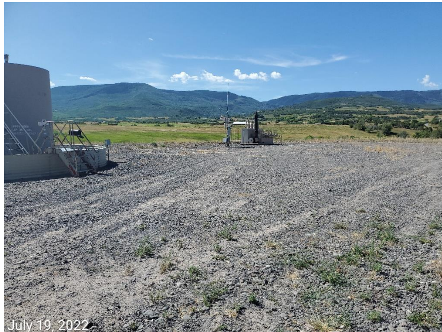
Photo 1: Photos 1-2 taken from the north end of the Location. Photos provide an overview of the Location facing east, southeast, southwest to west.