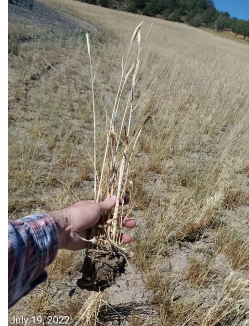
Photo 3: Photos show examples of vegetation observed on the interim areas; though desirable perennial vegetative establishment was observed within interim areas, vegetation established on the interim areas are predominantly annual grass species that do not comport with, or contribute to Rule 1003.e standards and requirements. Annual grass species also do not provide long term stabilization and competes with desirable plant species.