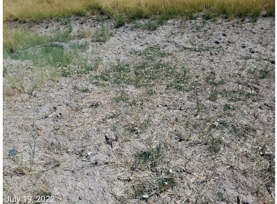
Photo 4: Photos examples showing Undesirable and Noxious plants (bind weed) establishing on the production and interim areas