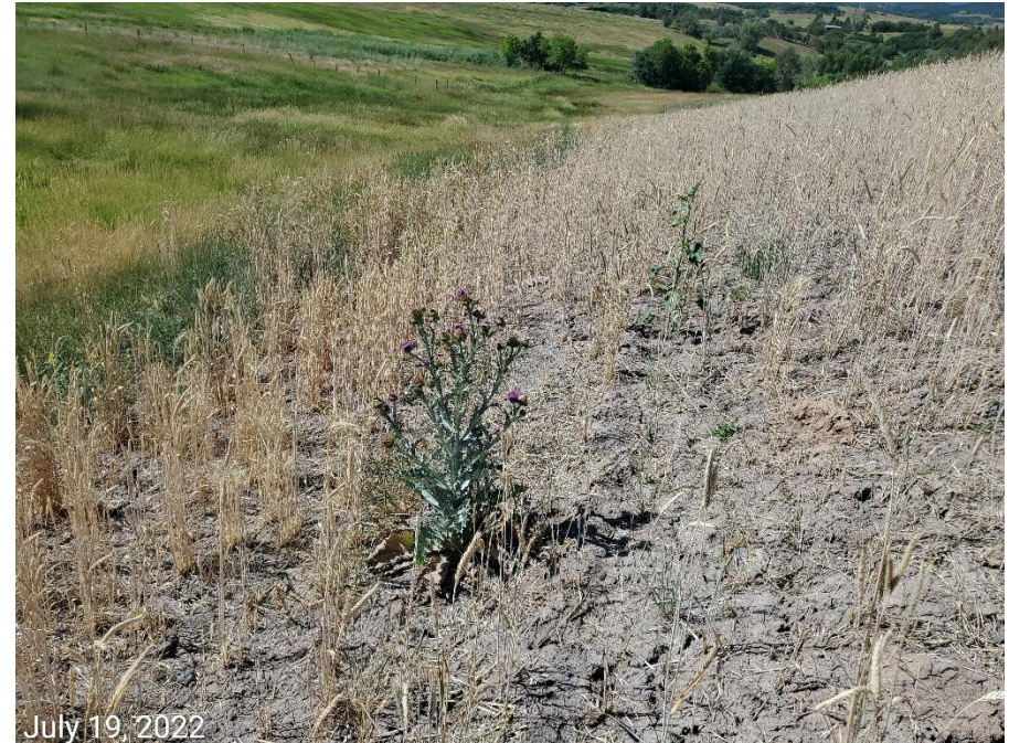
Photo 5: Photos examples showing Undesirable and Noxious plants (scotch thistle) establishing on the production and interim areas