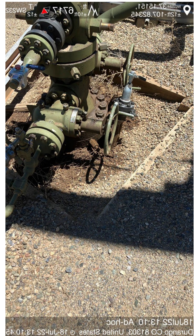
IMG 04 Impacted material