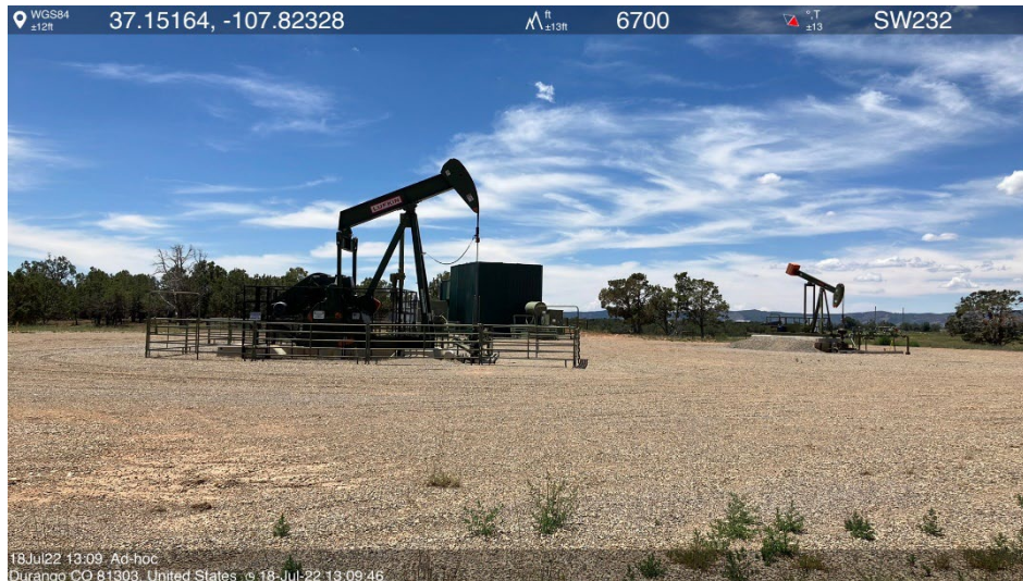
IMG 03 Location overview