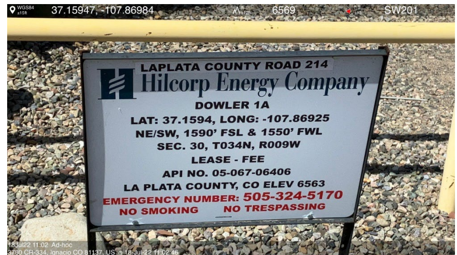
IMG 02 Well sign