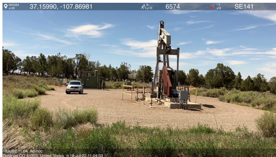
IMG 03 Location overview