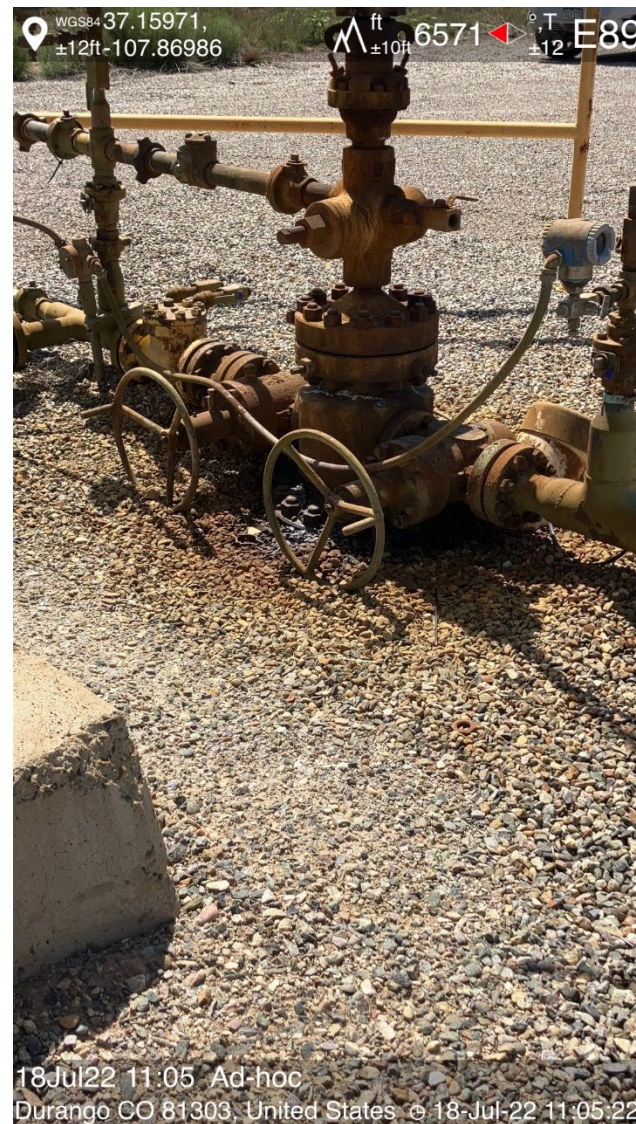
IMG 04 Impacted material