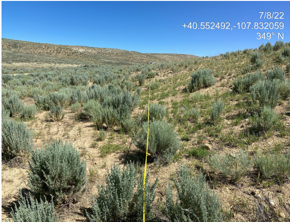
Photo 8. Photo taken from the east of the Location shows the end of disturbed area vegetation monitoring transect #2.