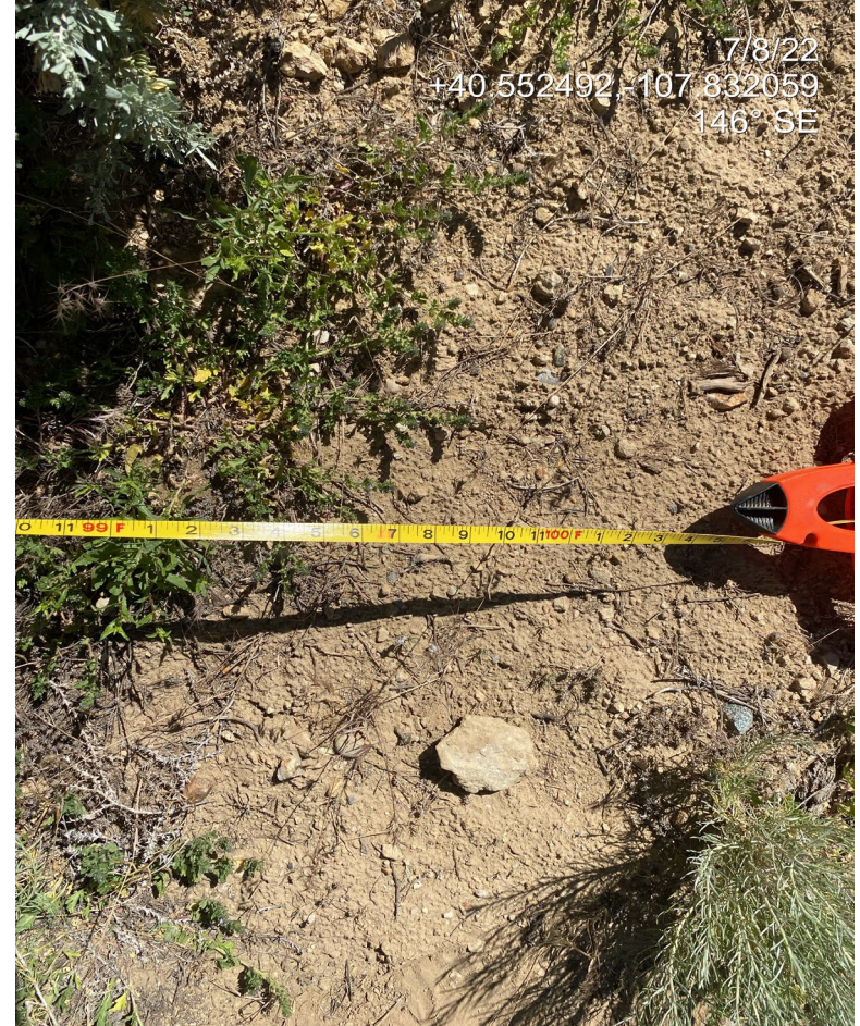
Photo 9. Photo taken from the east of the Location shows the ground surface at the end of disturbed area vegetation monitoring transect #2.