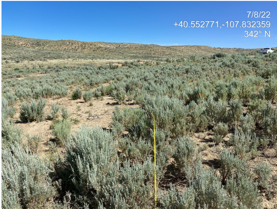
Photo 4. Photo taken from the west of the Location shows the end of disturbed area vegetation monitoring transect #1.