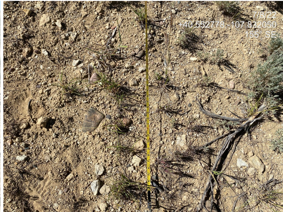
Photo 7. Photo taken from the northeast of the Location shows the ground surface at the start of disturbed area vegetation monitoring transect #2.