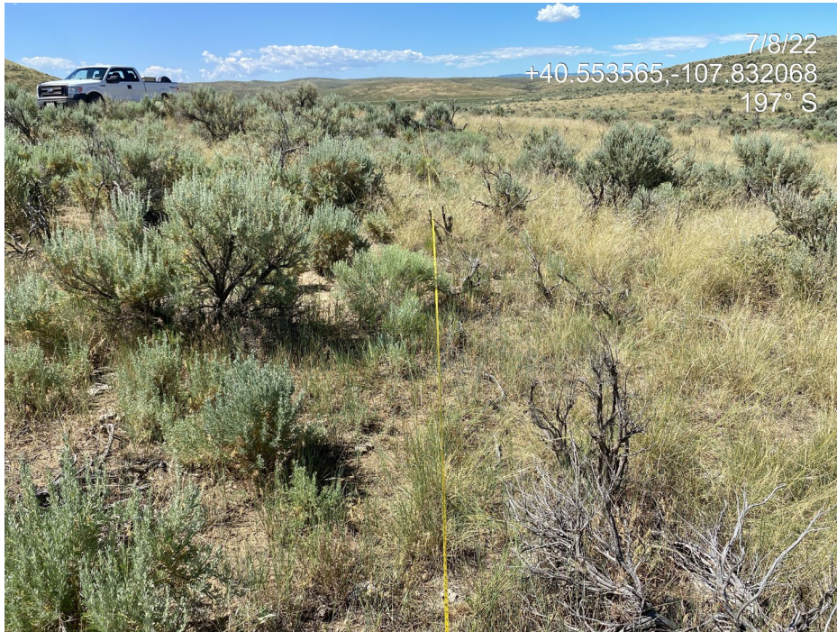
Photo 10. Photo taken from the adjacent reference area to the northwest of the Location shows the start of reference area vegetation monitoring transect #1.