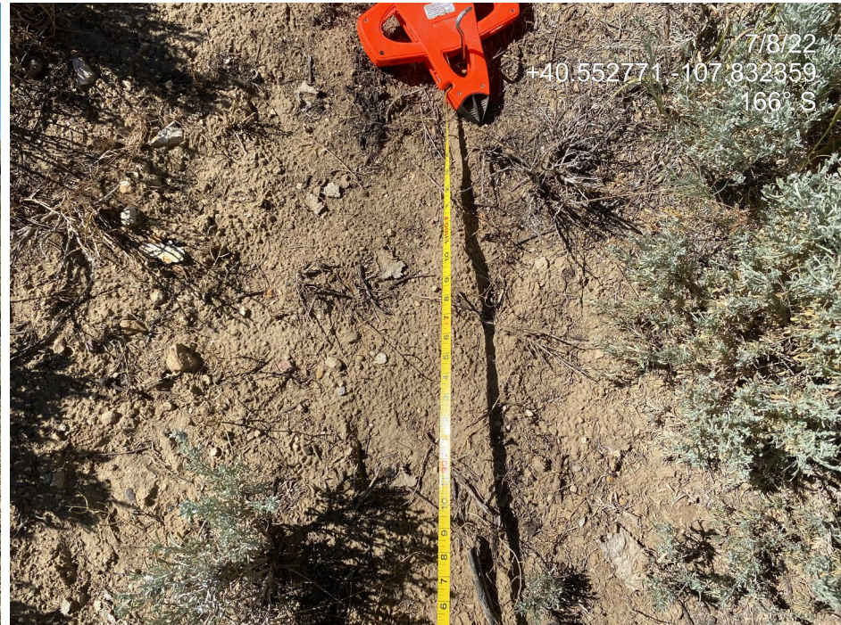
Photo 5. Photo taken from the west of the Location shows the ground surface at the end of disturbed area vegetation monitoring transect #1.