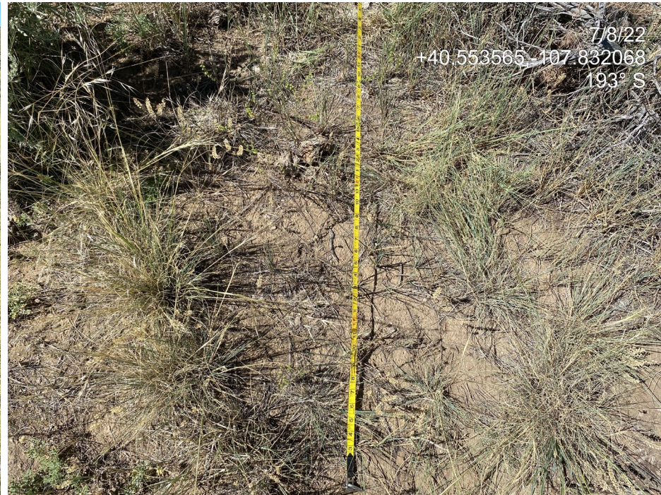
Photo 11. Photo taken from the adjacent reference area to the northwest of the Location shows the ground surface at the start of reference area vegetation monitoring transect #1.