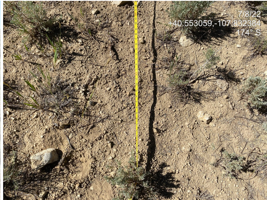
Photo 3. Photo taken from the northwest of the Location shows the ground surface at the start of disturbed area vegetation monitoring transect #1.