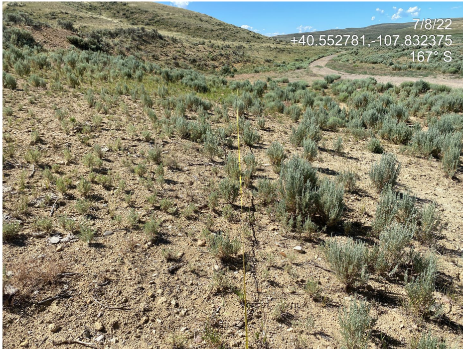
Photo 6. Photo taken from the northeast of the Location shows the start of disturbed area vegetation monitoring transect #2.