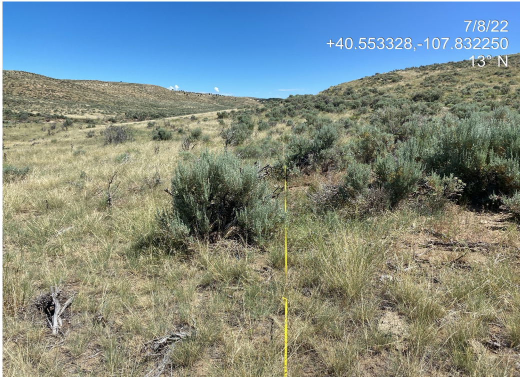
Photo 12. Photo taken to the northwest of the Location shows the end of reference area vegetation monitoring transect #1.