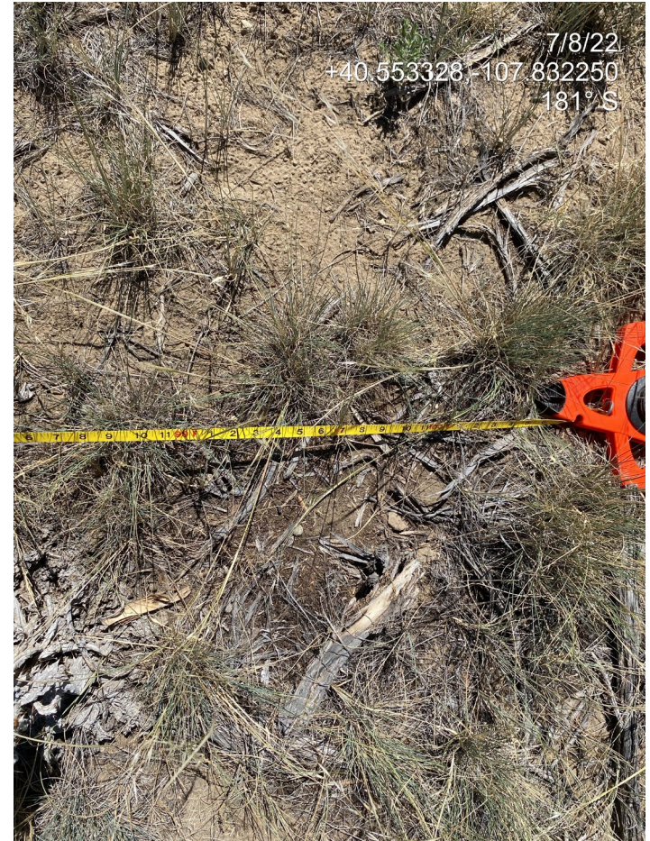
Photo 13. Photo taken to northwest of the Location shows the ground surface at the end of reference area vegetation monitoring transect #1.