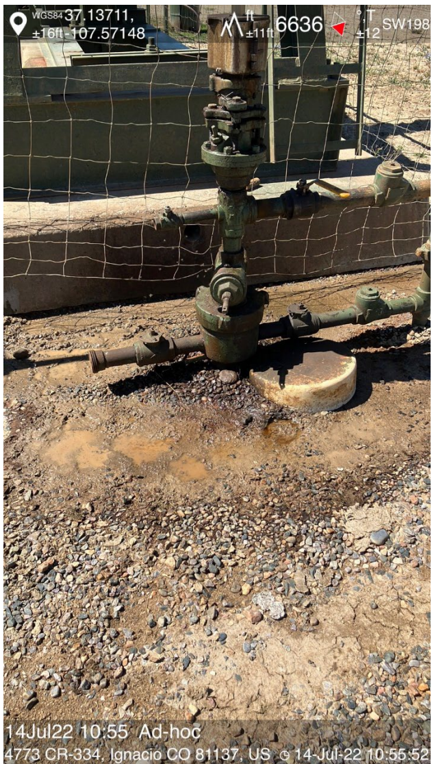
IMG 03 Produced water drip