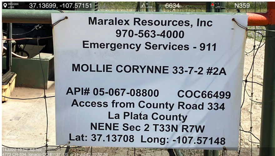
IMG 01 Well sign