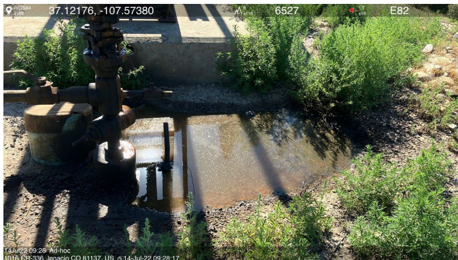
IMG 05 Produced water at wellhead