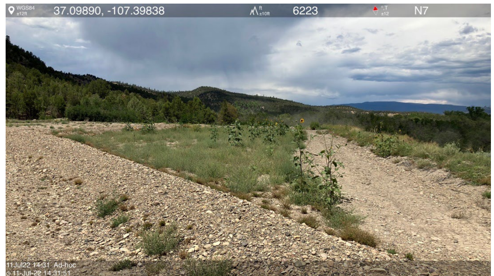
IMG 04 Weeds