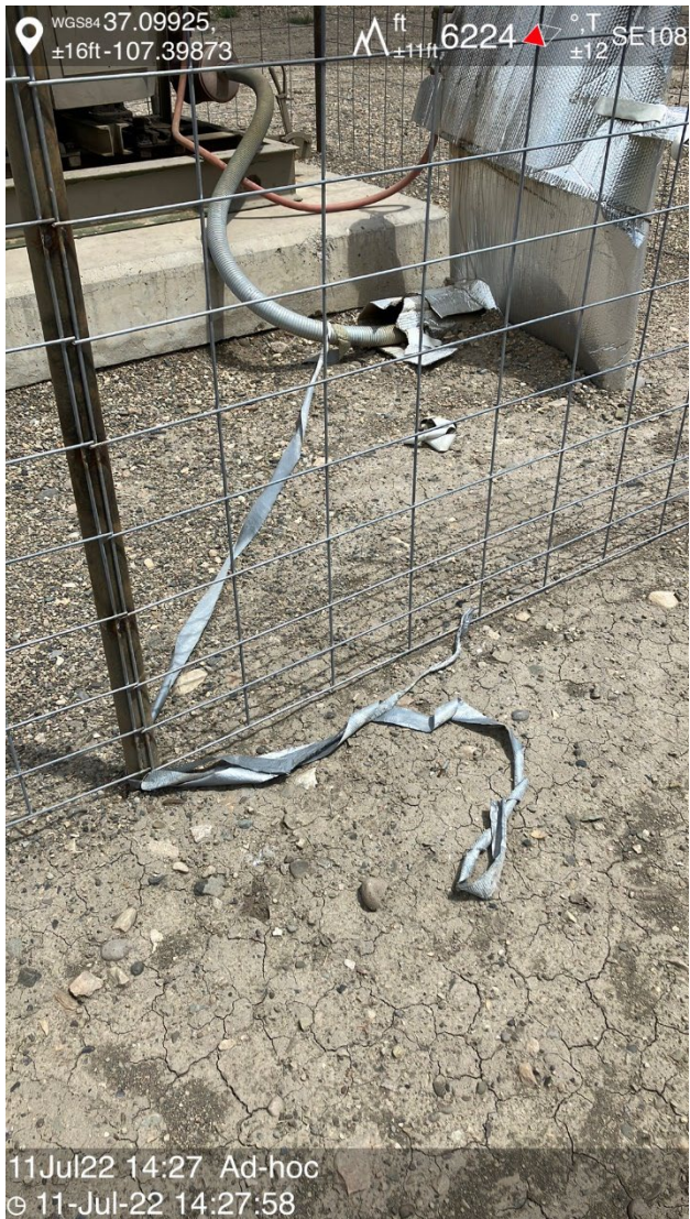
IMG 03 Trash