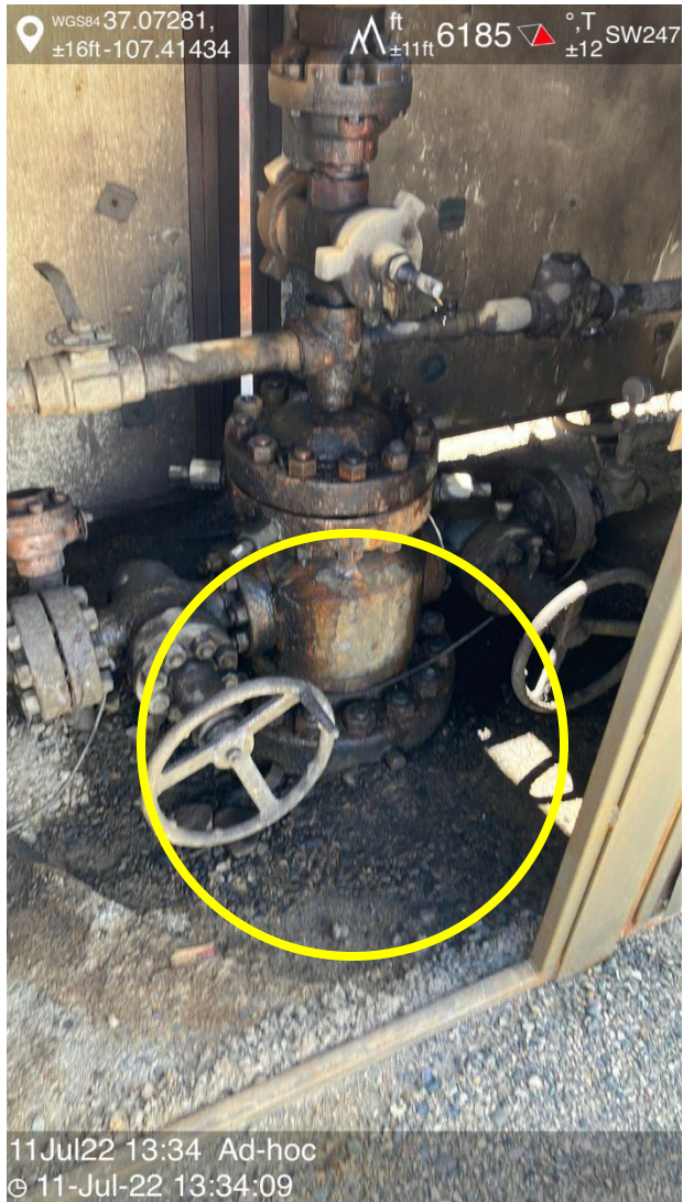
IMG 05 Impacted material