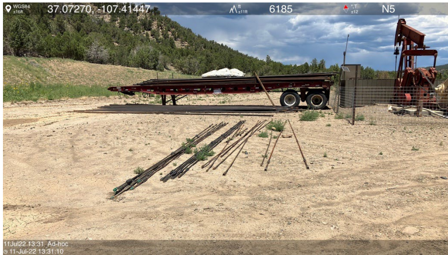
IMG 03 Unused equipment