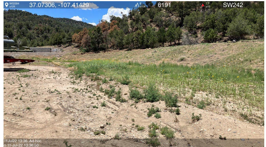
IMG 06 Weeds beginning to encroach interim revegetation