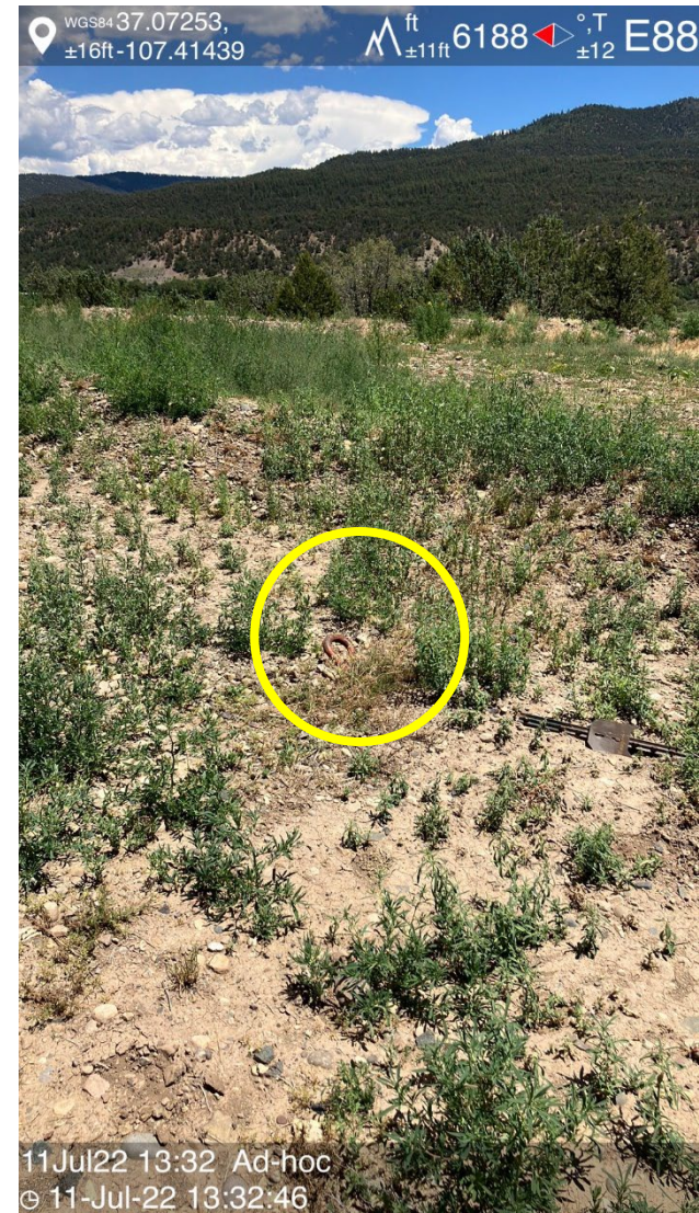
IMG 04 Unmarked rig anchor