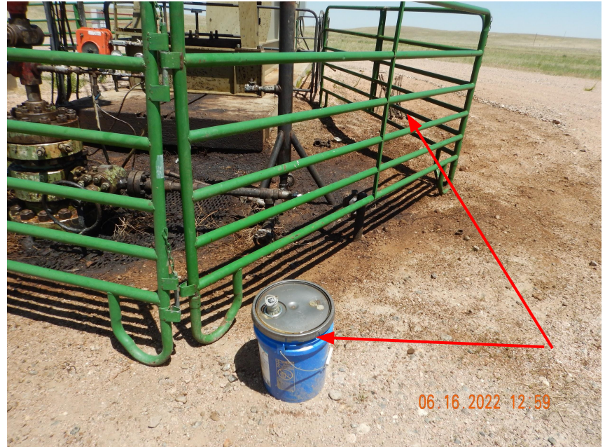
Photo 4. Photo taken from the wellhead. Photo illustrates unused equipment.