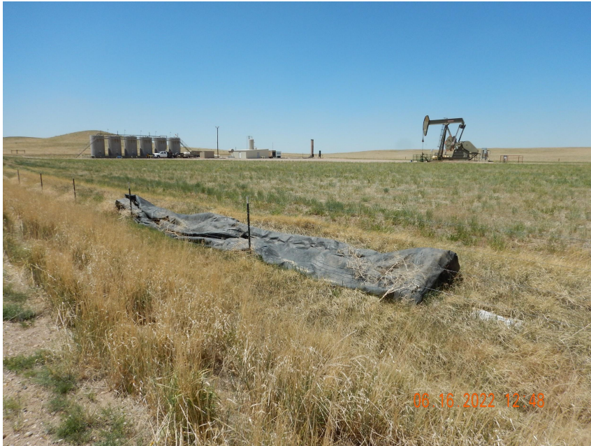
Photo 1. Photo taken from the southeastern location, facing Northwest. Photo illustrates debris that needs to be removed.