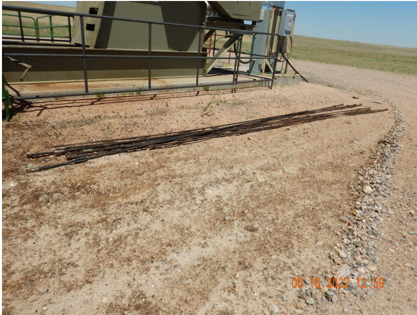
Photo 5. Photo taken from the wellhead. Photo illustrates unused equipment.