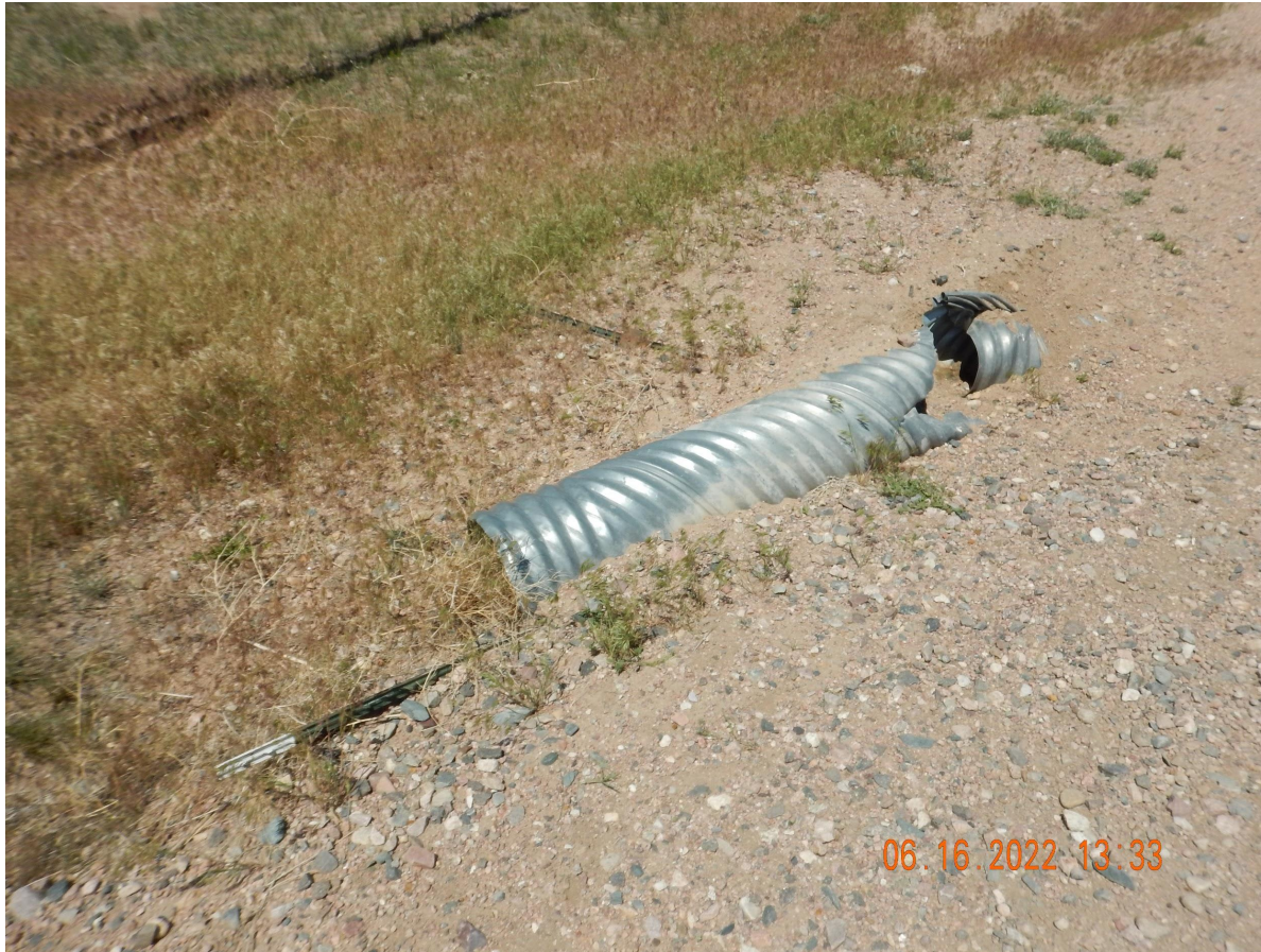
Photo 7. Photo taken from the entrance of location off CR 136. Photo illustrates damaged culverts that need to be repaired.