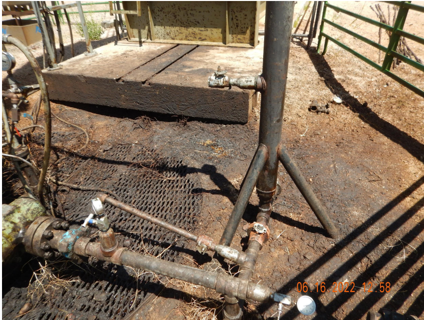
Photo 3. Photo taken from the wellhead. Photo illustrates production facility equipment is not in good mechanical condition per Rule 608.e.