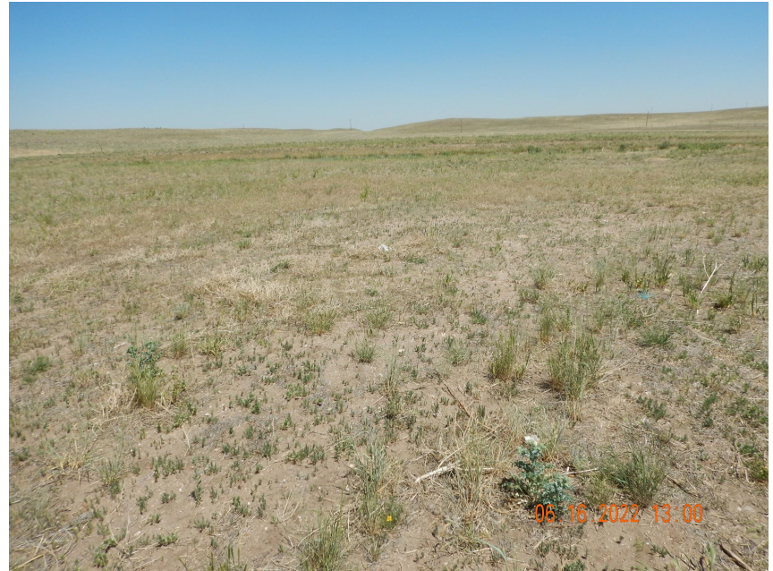
Photo 6. Photo taken from the northern interim reclamation area, facing East. Photo illustrates interim reclamation has been performed; however, an introduced seed mix was used which is not reflective of reference area vegetation per Rule 1003.