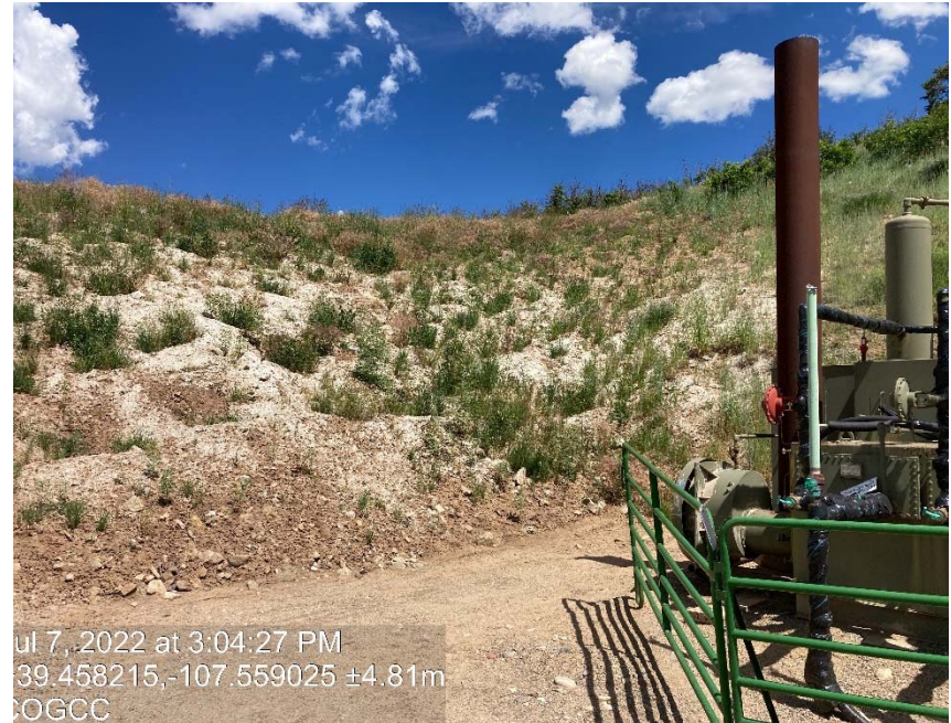
Hydro seeded and pock marked