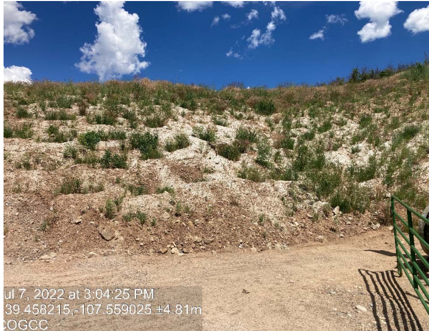
Hydro seeded and pock marked