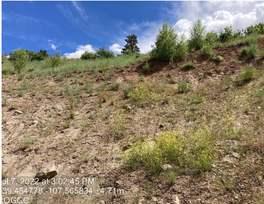
Some lack of stabilization/ erosion