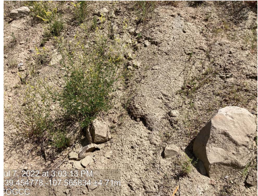
Erosion on cut slope