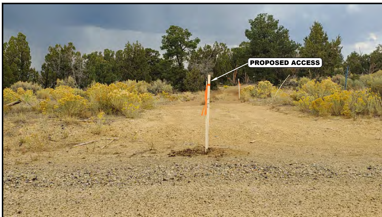
PHOTO: VIEW FROM BEGINNING OF PROPOSED ACCESS