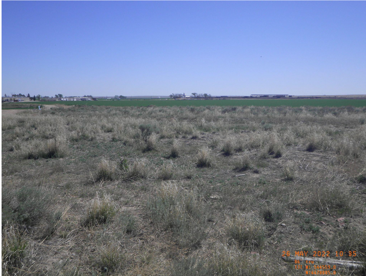
Photo 8. Tank battery reference area.