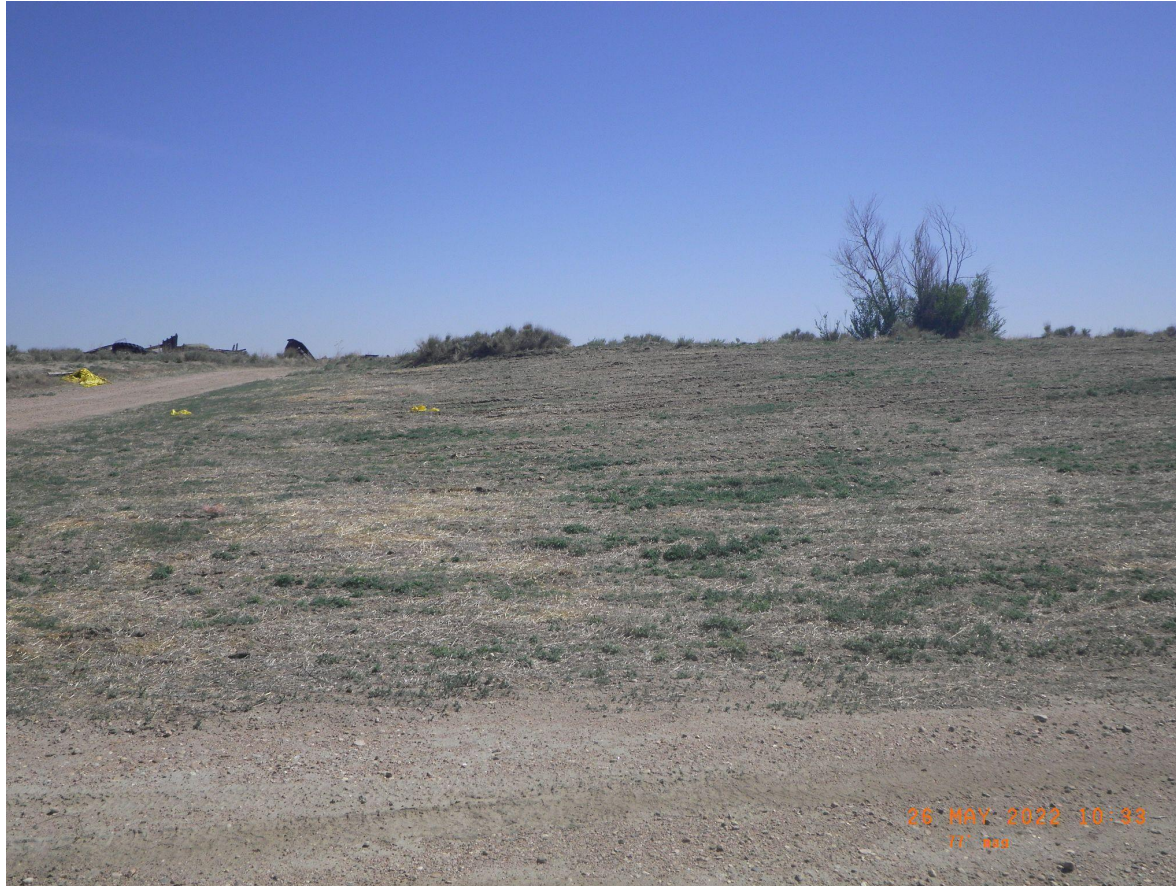
Photo 5. Overview photo of the tank battery taken at ground level from the western edge looking east.