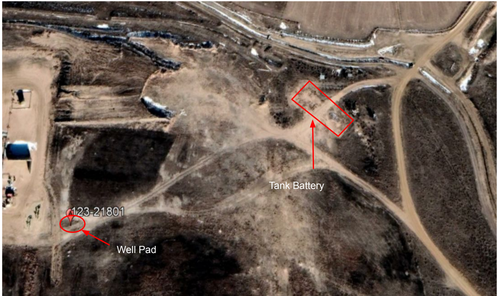
Photo 1. 2021 aerial imagery of the well pad and tank battery.