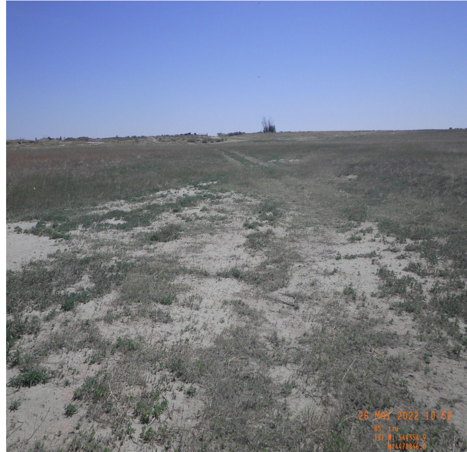
Photo 3. Cardinal photos taken from the middle of the well pad. Left photo facing north, right photo facing east.