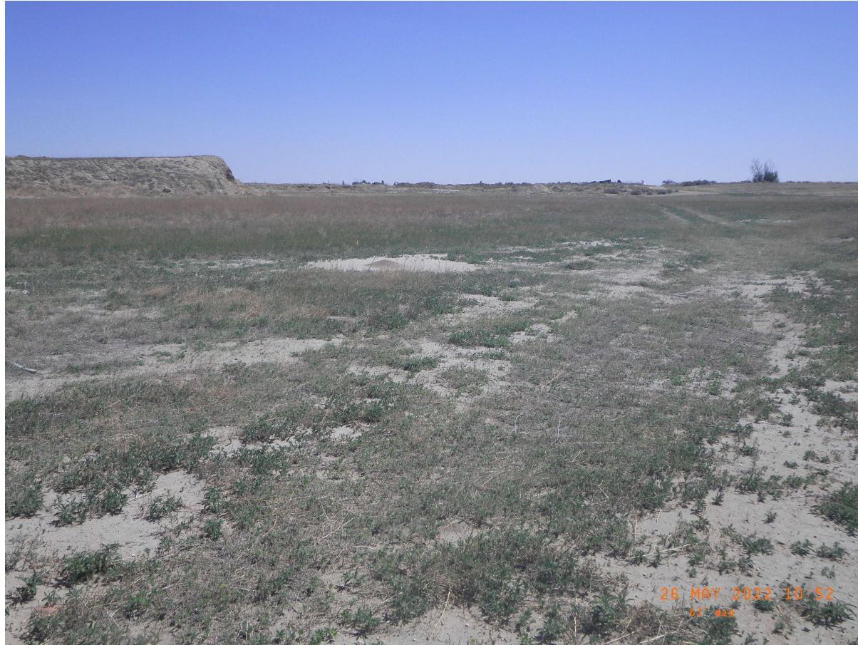
Photo 2. Overview photo of the well pad taken at ground level from the western edge looking east.