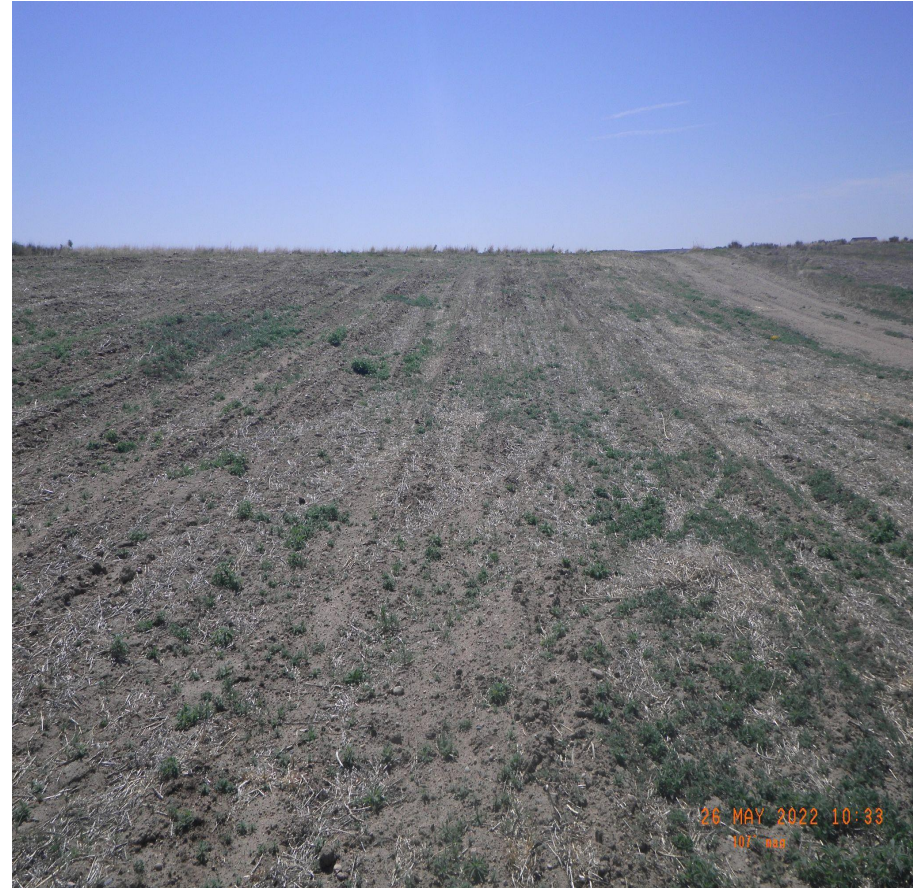
Photo 6. Cardinal photos taken from the middle of the tank battery. Left photo facing north, right photo facing east.