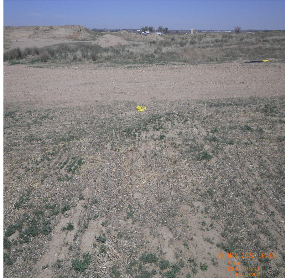
Photo 7. Cardinal photos taken from the middle of the tank battery. Left photo facing south, right photo facing west. Note: It appears that the operator has performed final reclamation activities at the tank battery however, no desirable species were observed. Tank battery does not appear consistent with tank battery reference area. (see photo 8).