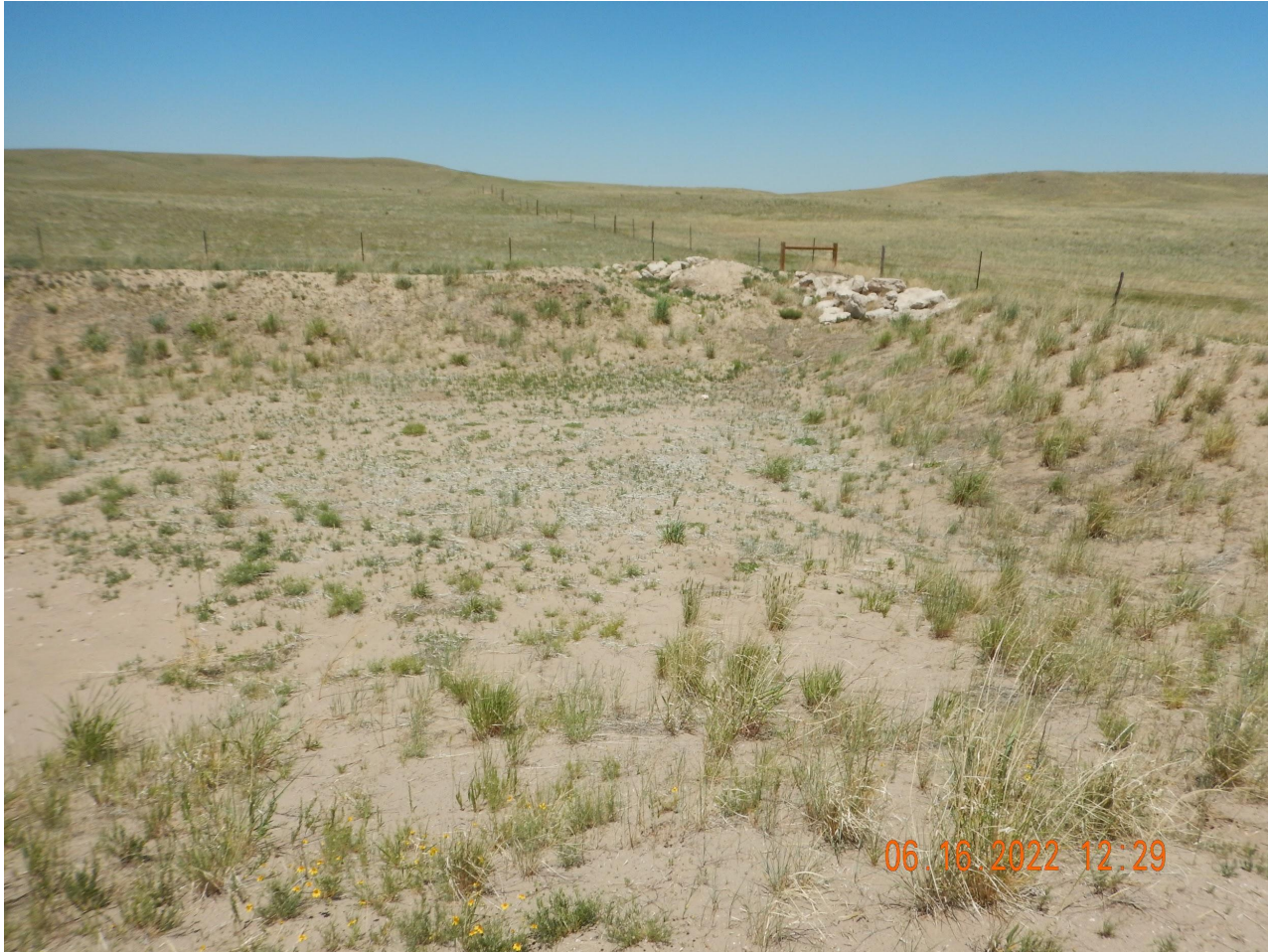
Photo 6. Photo taken from the northeastern location, facing Northeast. Photo illustrates the detention pond that is in proper functioning condition.