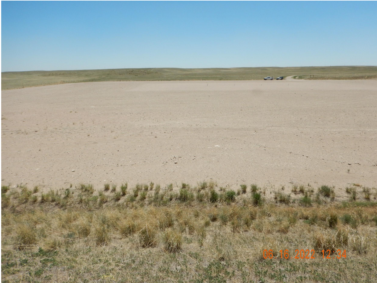
Photo 1. Photo taken from the northern location on the topsoil stockpile, facing South. Photo illustrates the Operator has not performed drilling operations.