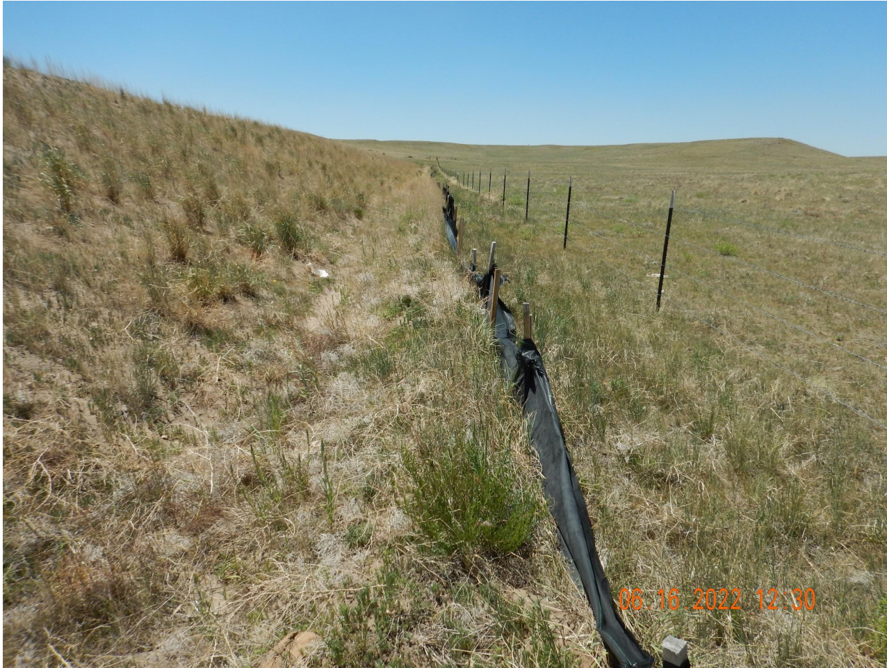
Photo 7. Photo taken from the northeastern location, facing West. Photo illustrates a silt fence BMP is disrepair. There appears to be sufficient vegetative growth that the silt fence may not be needed any further since there is a ditch BMP to the interior that is directed to a detention area.