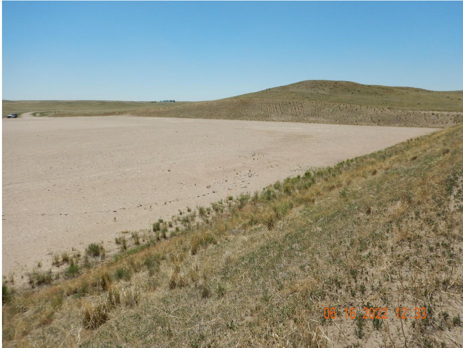
Photo 2. Photo taken from the northern location on the topsoil stockpile, facing Southwest. See comments under Photo 1.