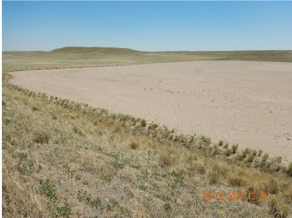
Photo 3. Photo taken from the northern location on the topsoil stockpile, facing Southeast. See comments under Photo 1.