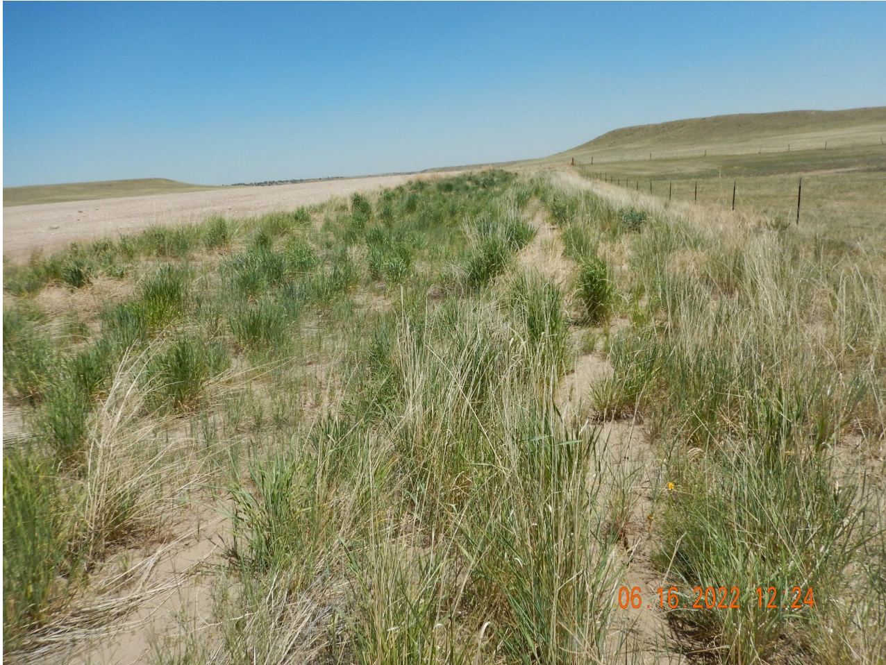
Photo 4. Photo taken from the southern location, facing East. Photo illustrates the vegetative growth that is both native and introduced plant species.