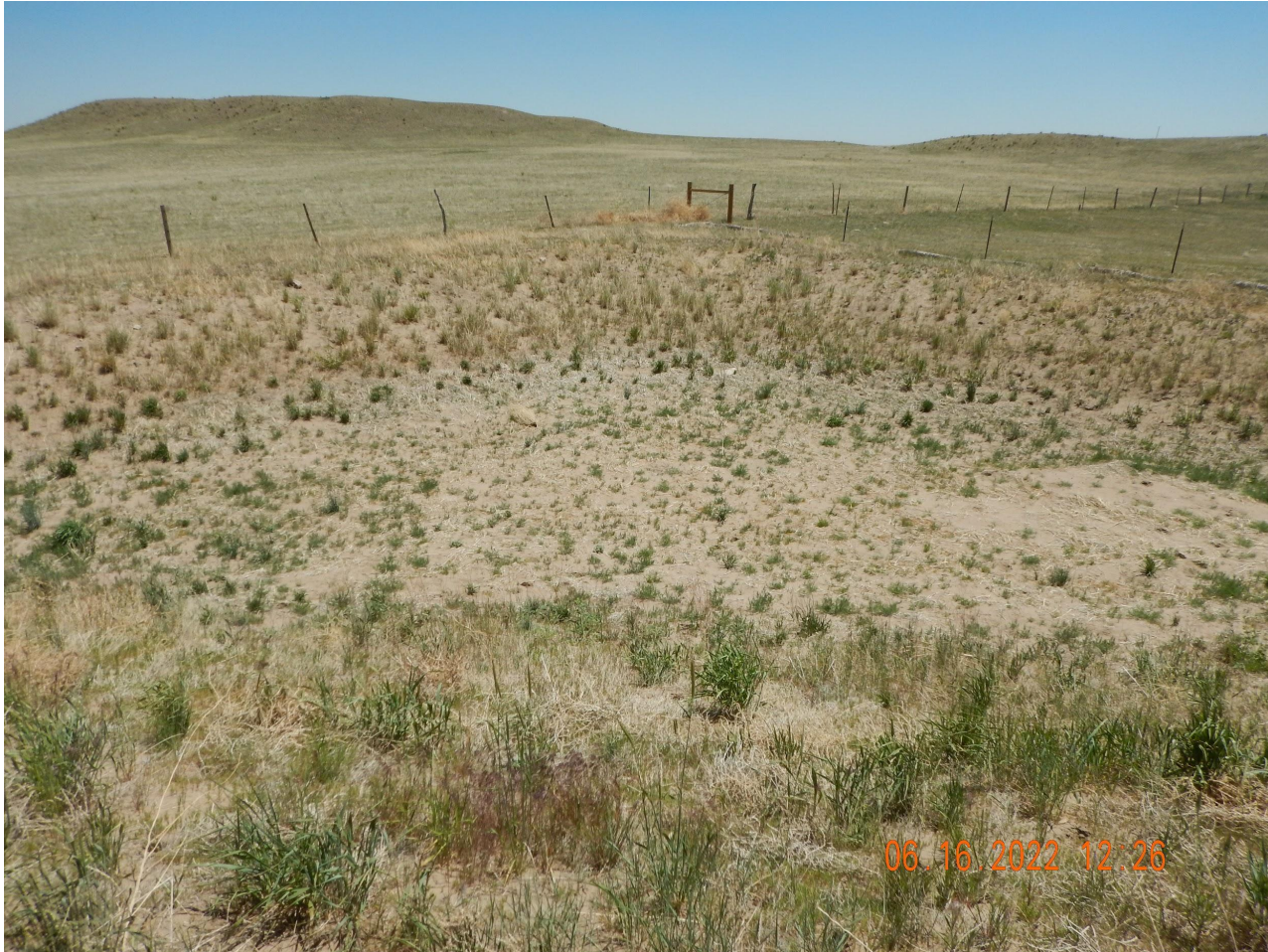
Photo 5. Photo taken from the southeastern location, facing East. Photo illustrates the detention pond that is in proper functioning condition.