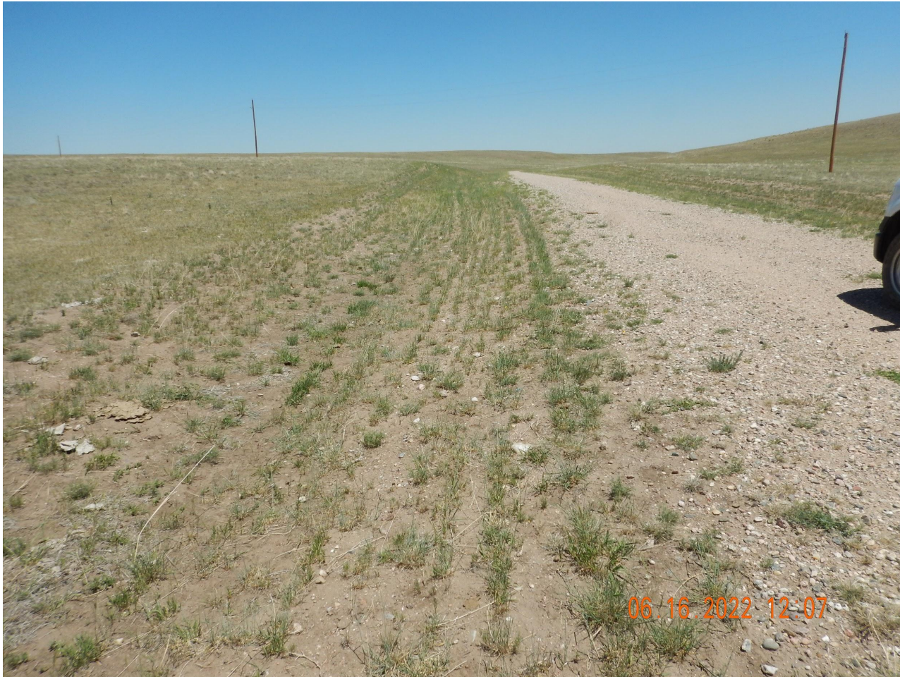
Photo 8. Photo taken from a portion of the main lease road, facing East. Photo illustrates desirable vegetation is observed but cheatgrass is starting to establish along areas of the access road.