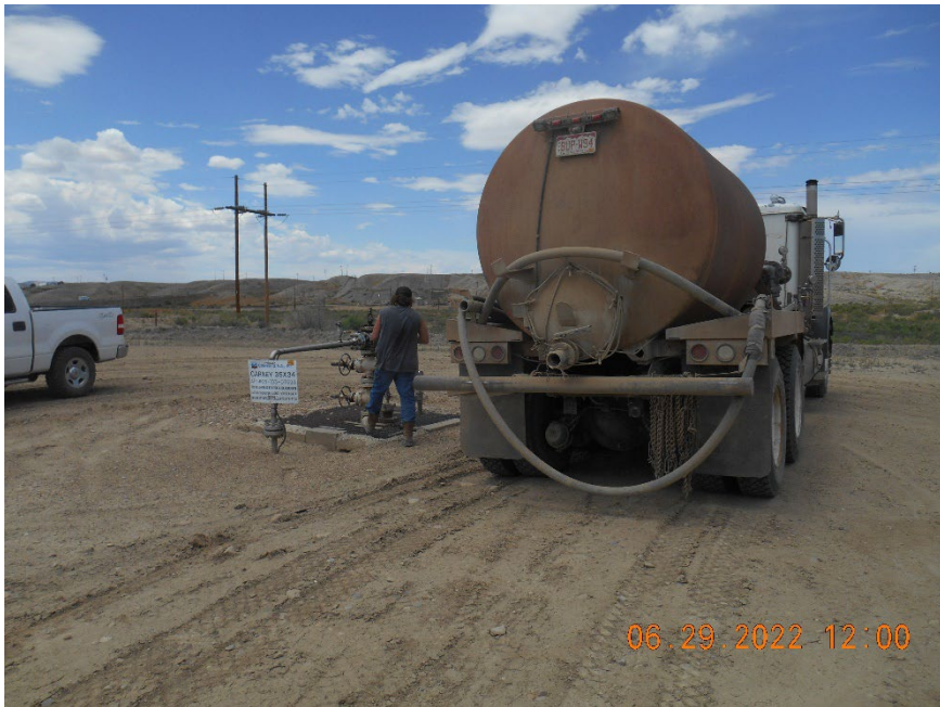
Injection wellhead during MIT