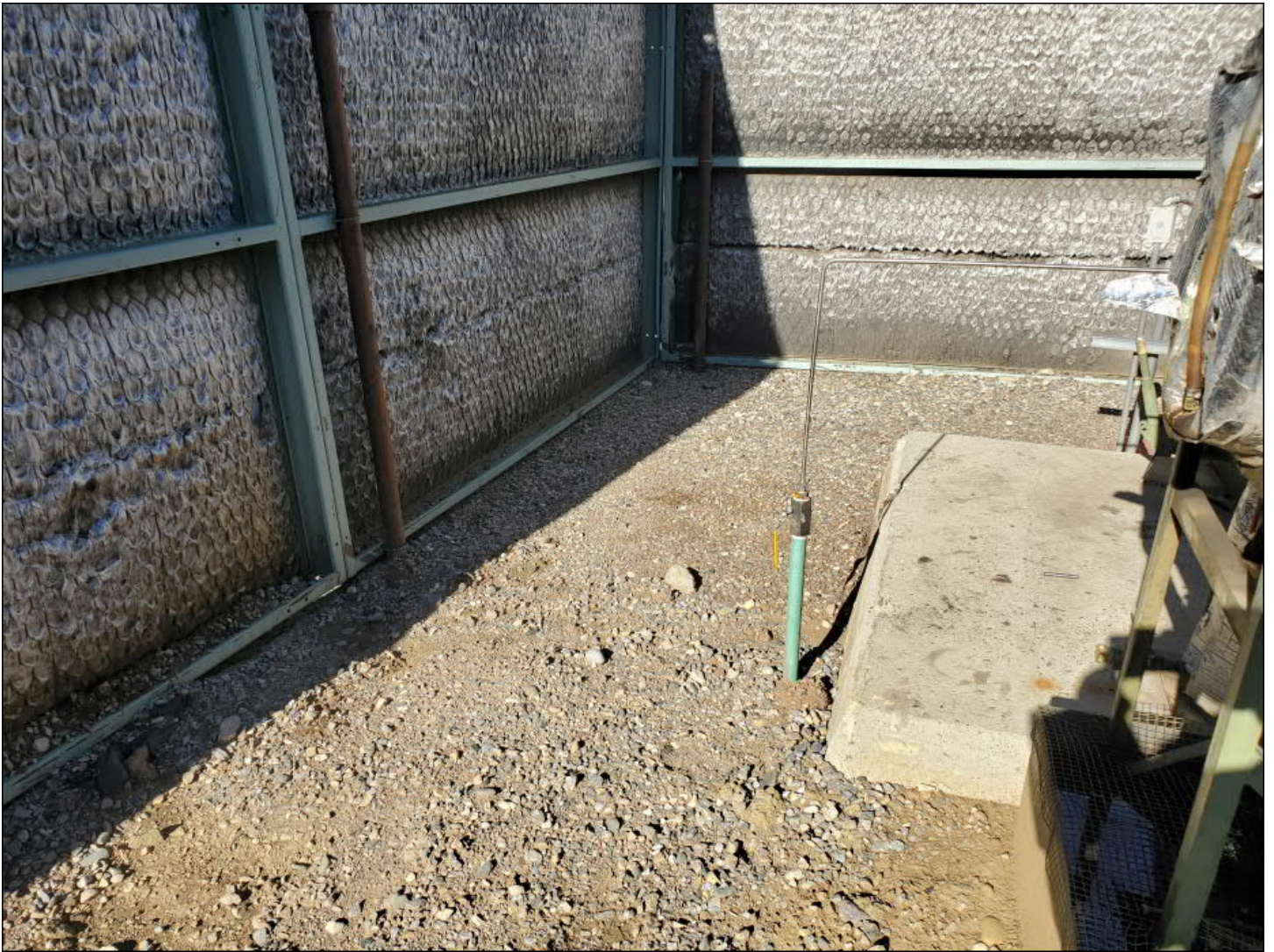
All rig anchor markers are secured properly.