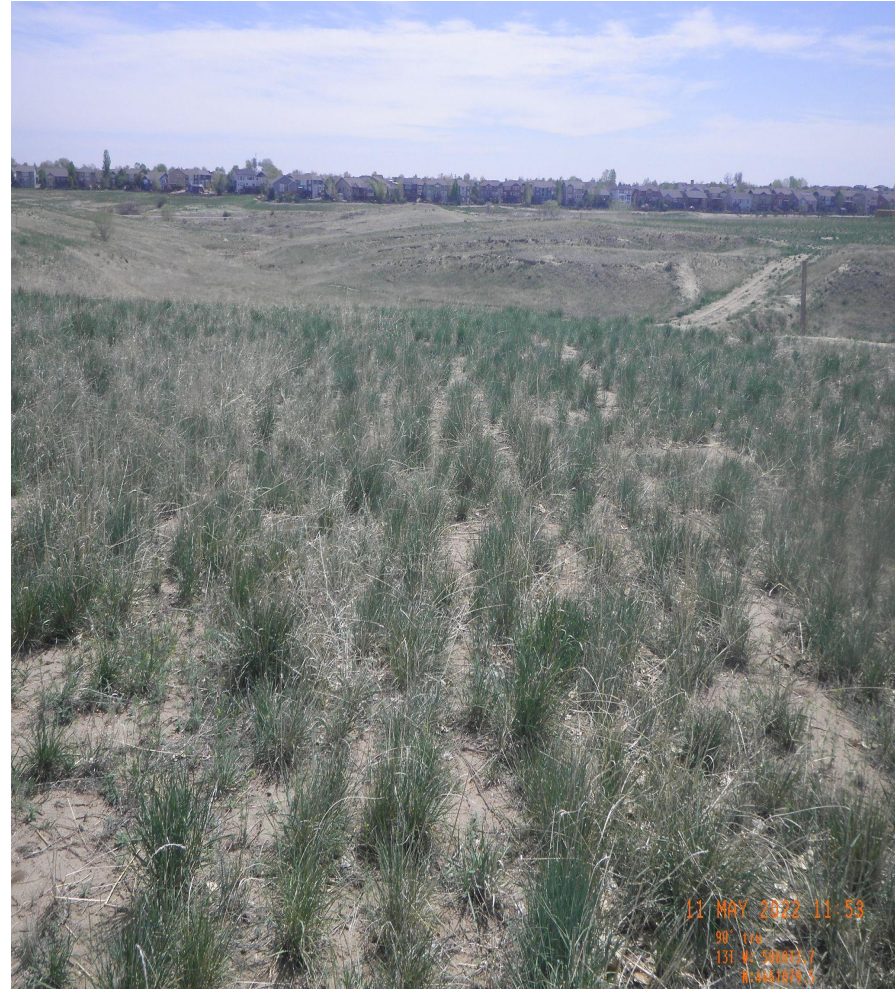
Photo 6. Overview cardinal photos of the well pad. Left photo facing north, right photo facing east.