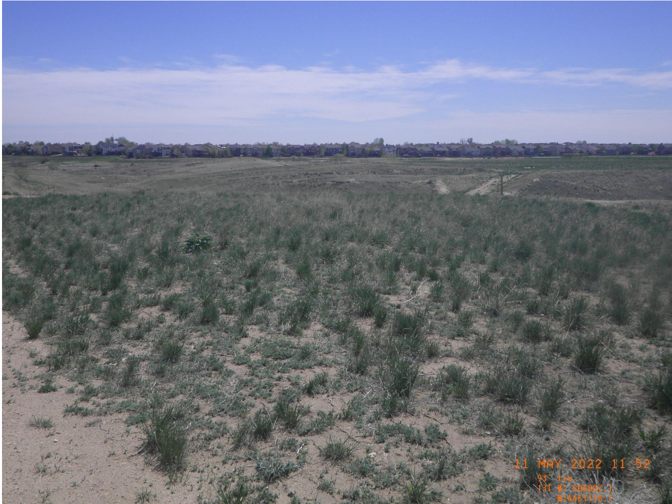
Photo 5. Overview photo of the well pad taken from the northern edge facing west.