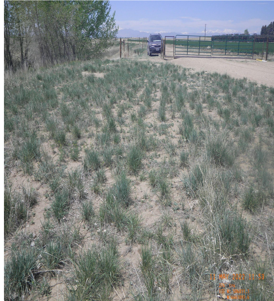
Photo 7. Overview cardinal photos of the well pad. Left photo facing south, right photo facing west. Note: kochia seedlings observed throughout well pad disturbance. Seeded species appear consistent with reference area but hasn't reached the 80% threshold. WP will remain in-process until it can be re-inspected.