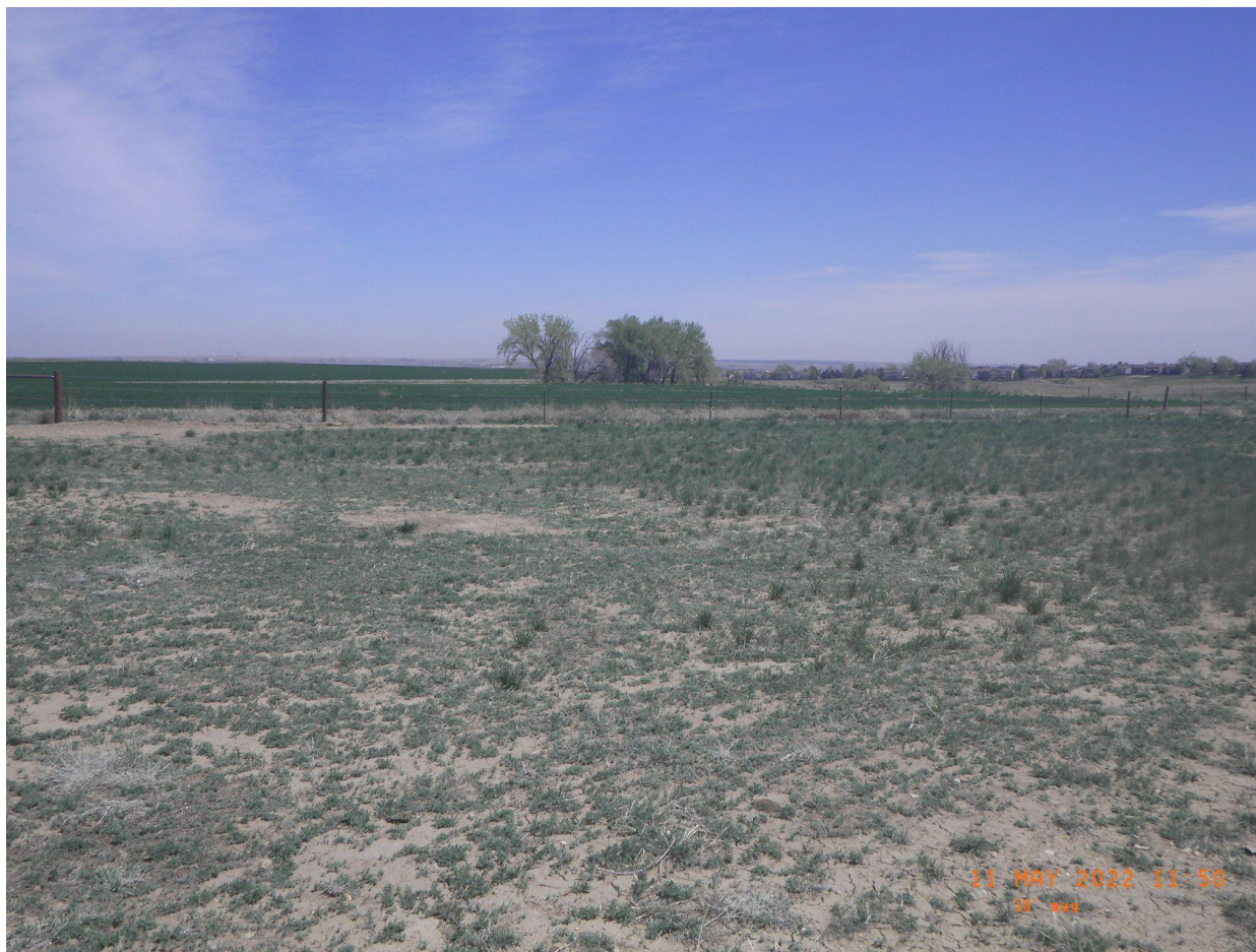
Photo 2. Overview photo of the tank battery taken at ground level from southwest edge looking north. Note: kochia seedlings littered throughout tank battery disturbance area. Seeded species appear consistent with reference area.