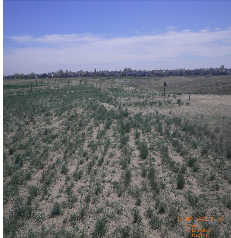
Photo 3. Overview cardinal photos of the tank battery. Left photo facing north, right photo facing east.