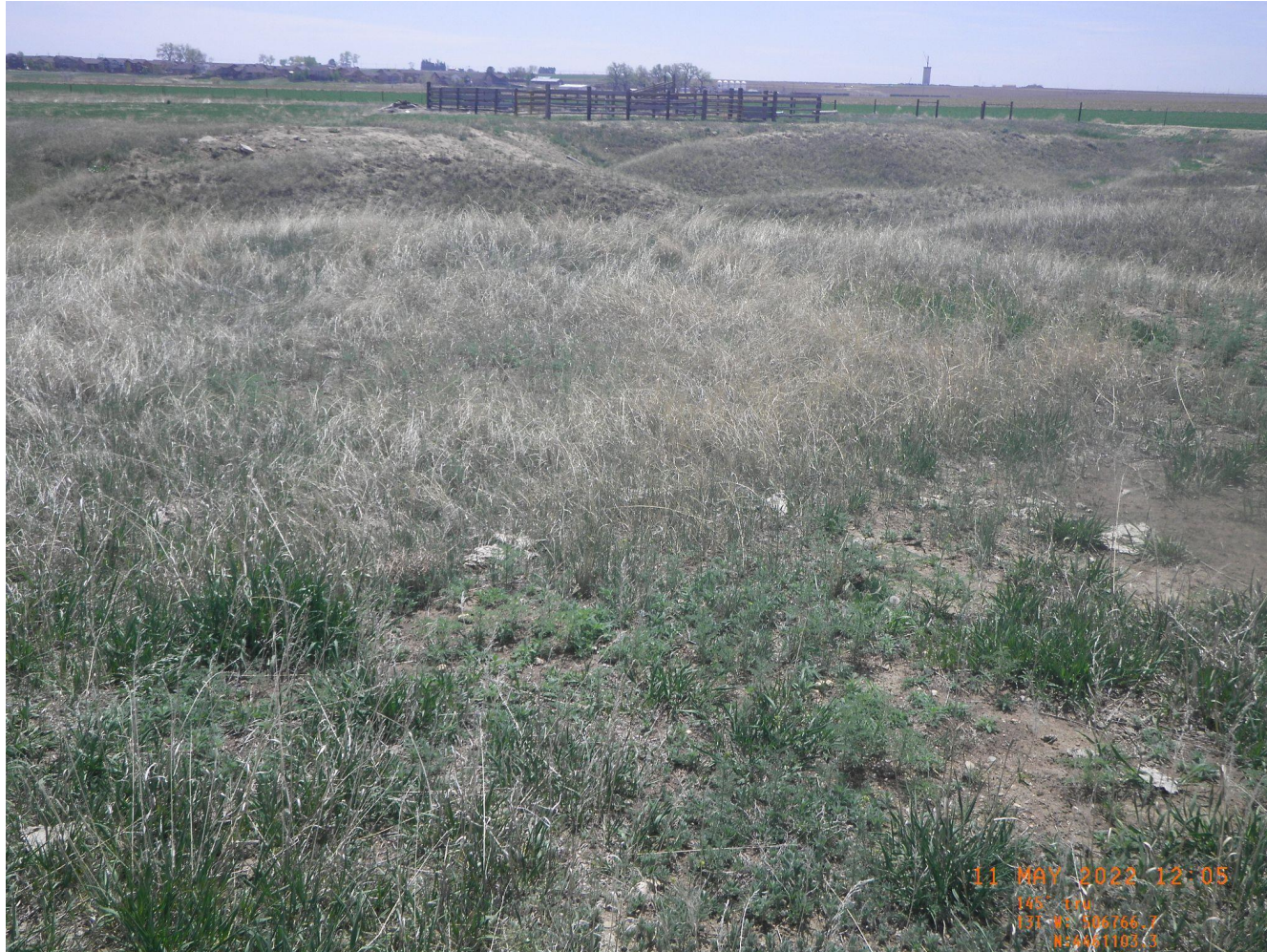
Photo 8. Reference area.