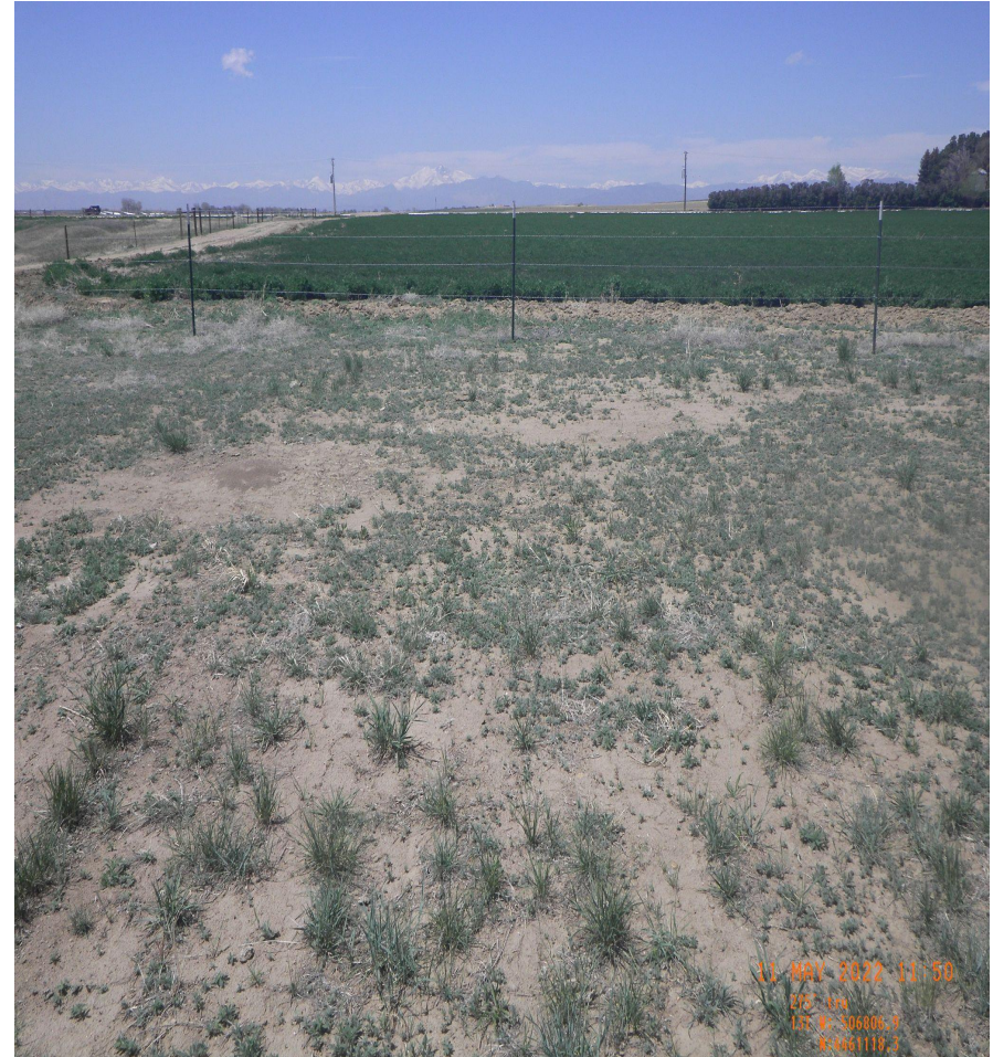
Photo 4. Overview cardinal photos the tank battery. Left photo facing south, right photo facing west. Note: kochia seedlings observed throughout tank battery disturbance area. Seeded species appear consistent with reference area but hasn't reached the 80% threshold. TB will remain in-process until it can be re-inspected.