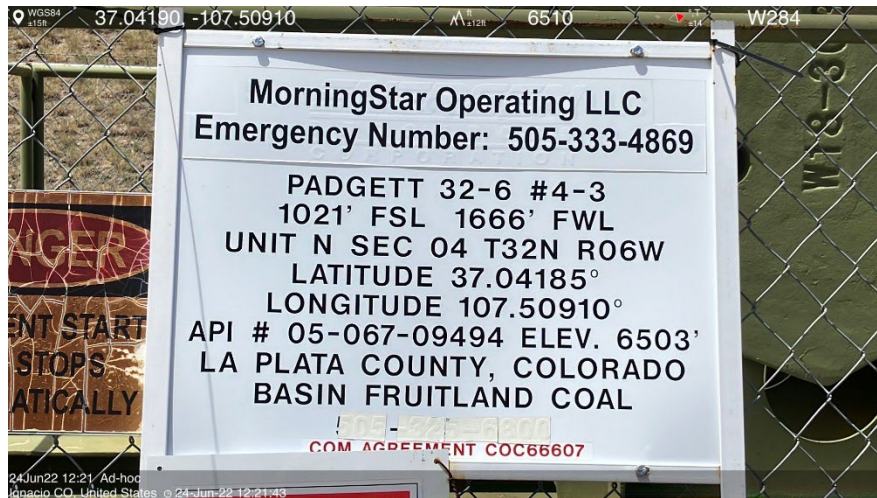
IMG 01 Well sign