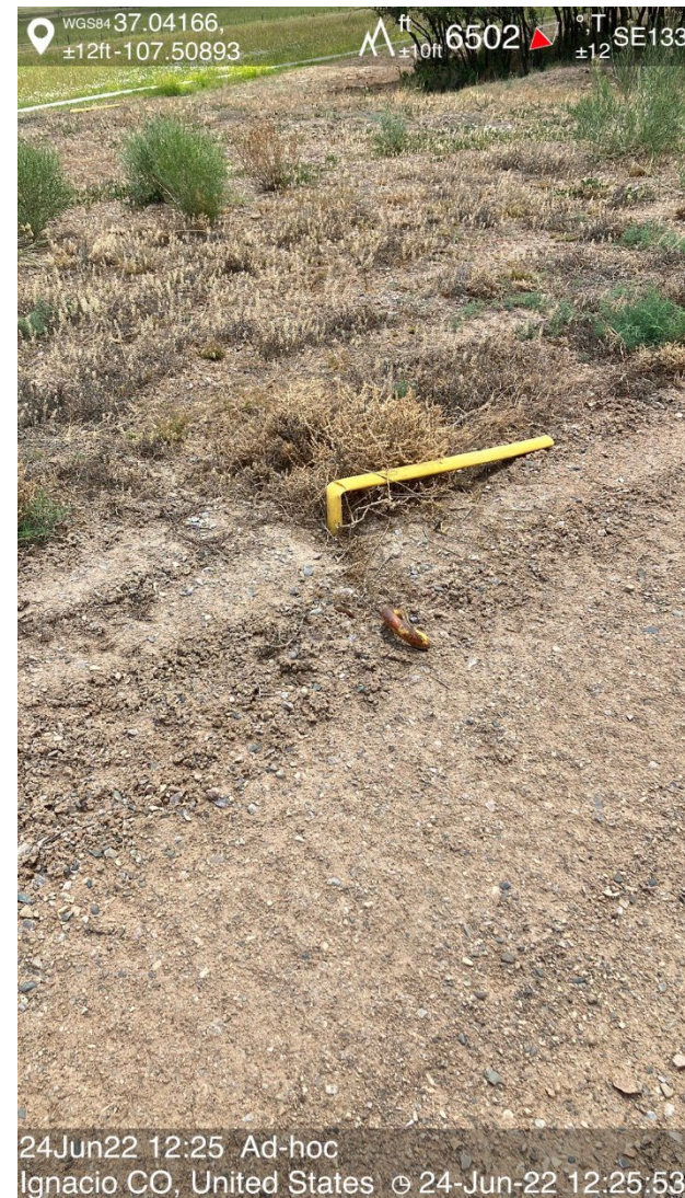
IMG 04 Rig anchor not properly marked