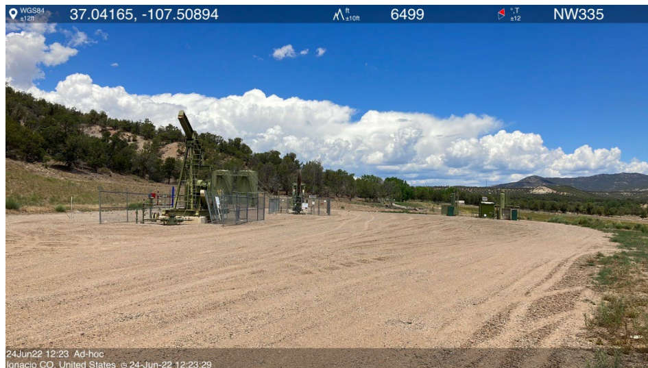
IMG 03 Location overview