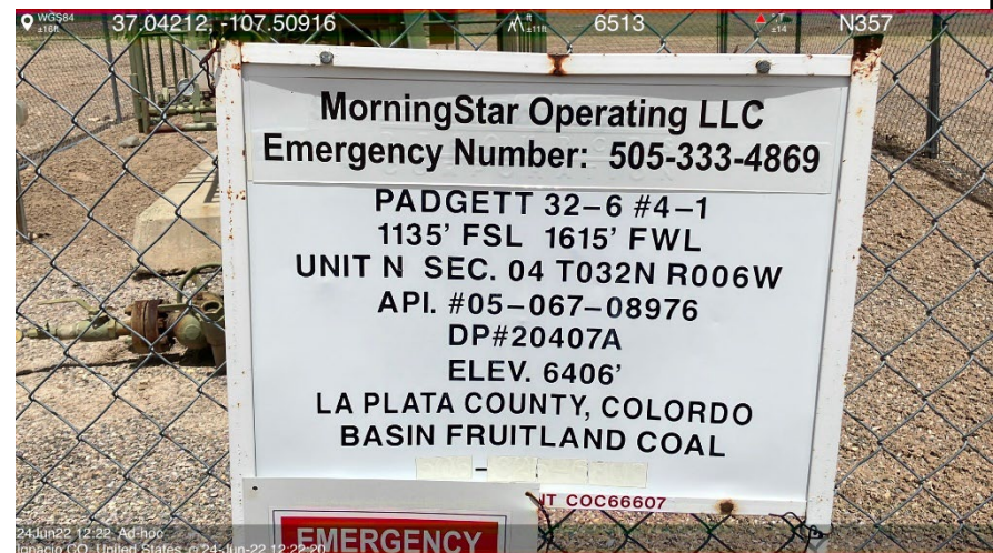
IMG 02 Well sign