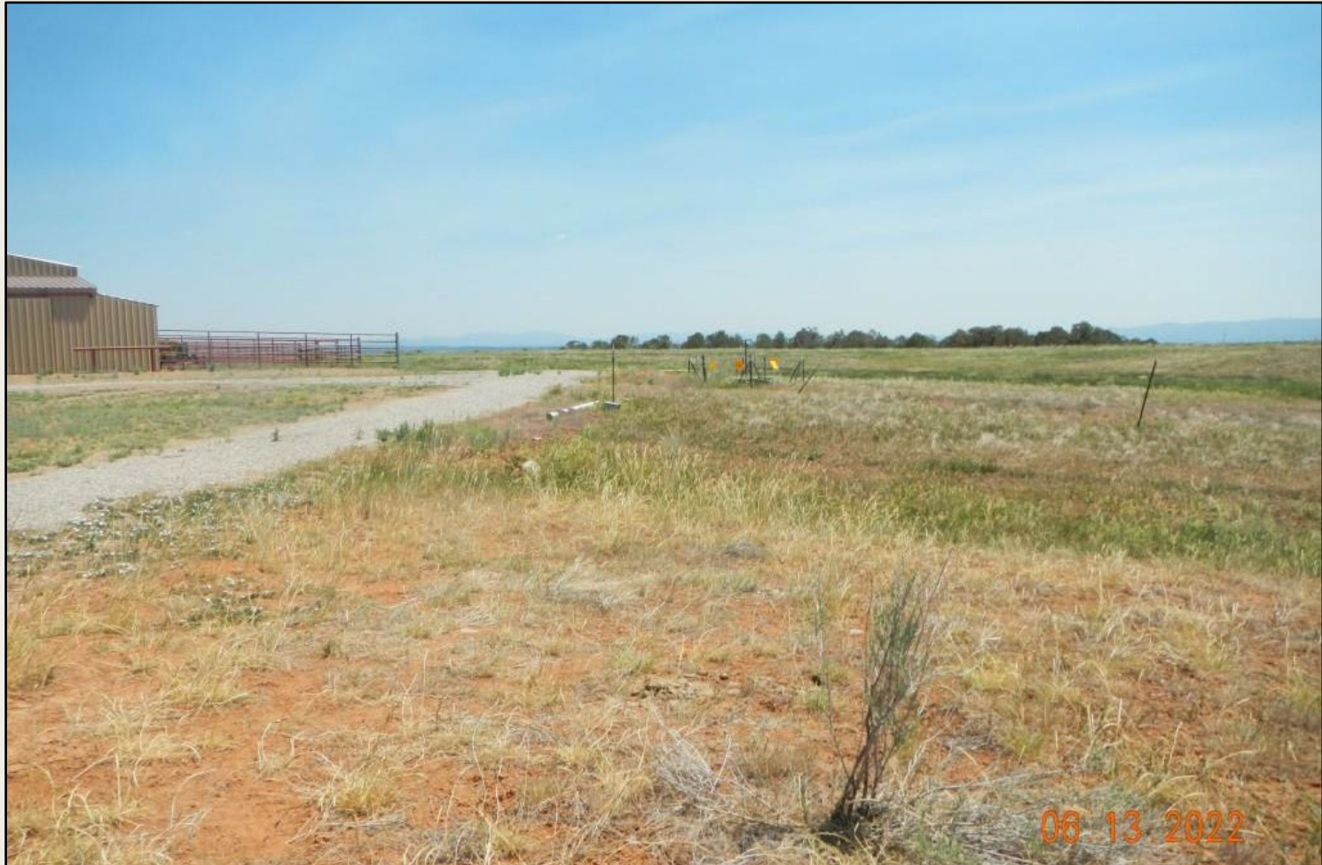
Photo 2. View of ROW in foreground facing northward. Desirable vegetation such as sand dropseed, crested wheatgrass, and smooth brome observed.