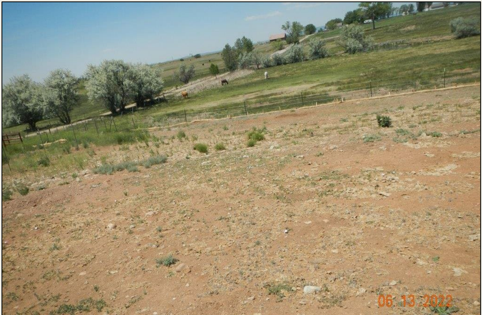
Photos 4. View of area along the western portion of the pipeline ROW where hydromulch is observed and seeding appears to be conducted.