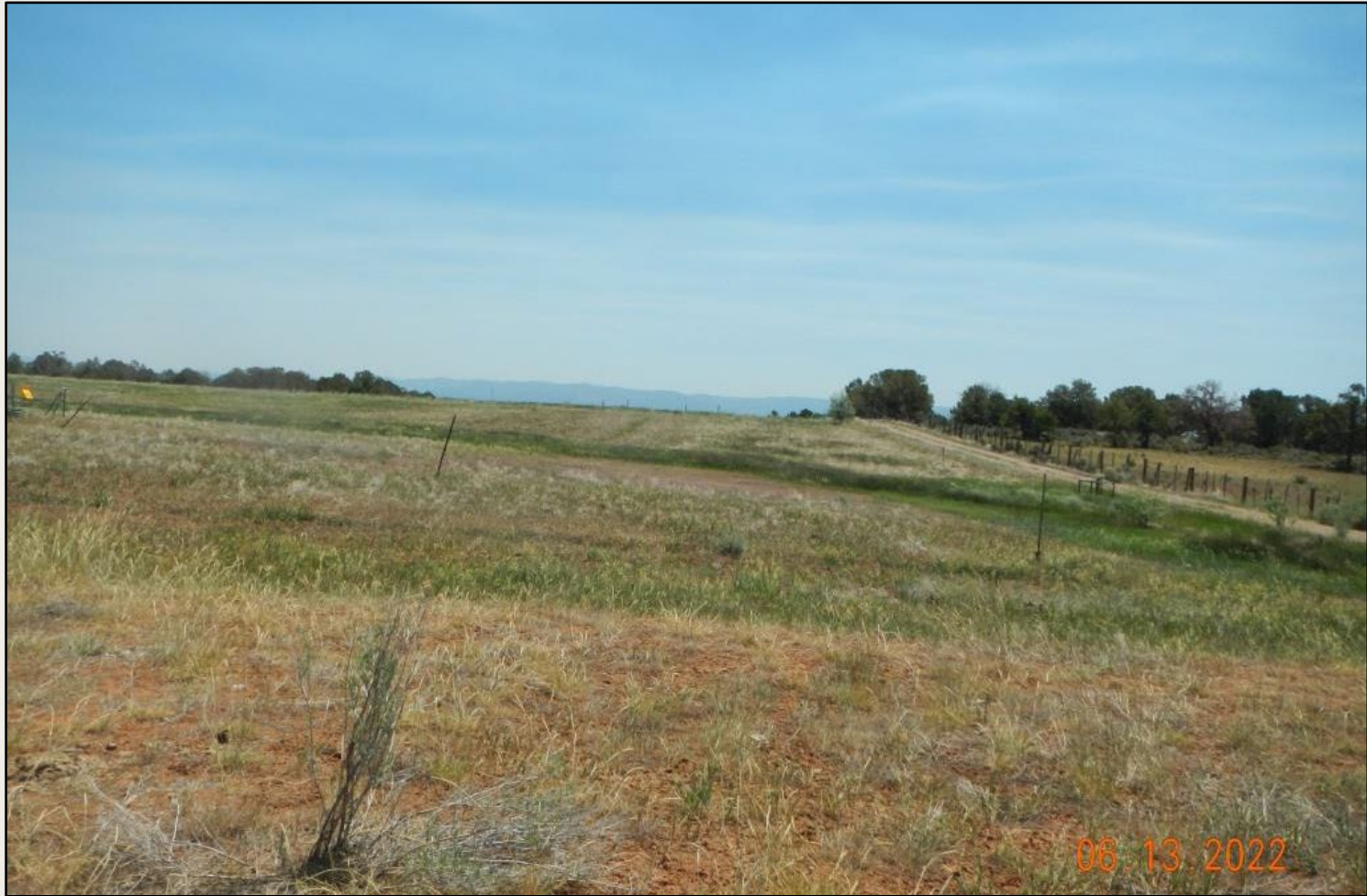
Photo 1. View of the right of way (ROW) from access entrance facing eastward along ROW.