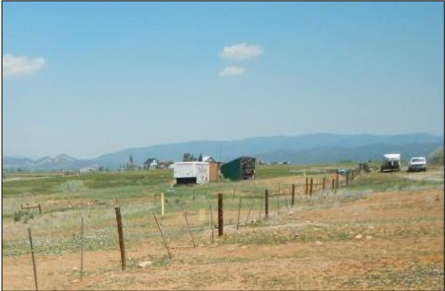
Photo 5. View of fencing repaired in the western portion of the pipeline ROW.