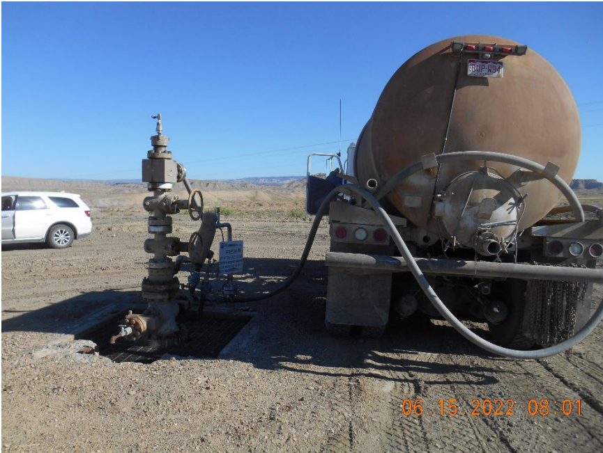
Injection wellhead during MIT