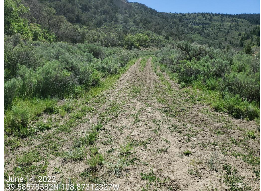
Photo 3: Photos show access road north of the Location. Historic aerial imagery shows access road pre-existed the O&G Location.