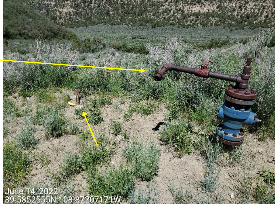
Photo 2: Photos taken from the North end of the Location. Photo shows piper risers / surface equipment remaining on the Locaiton. Equipment requires removal pursuant to Rule 1004.a