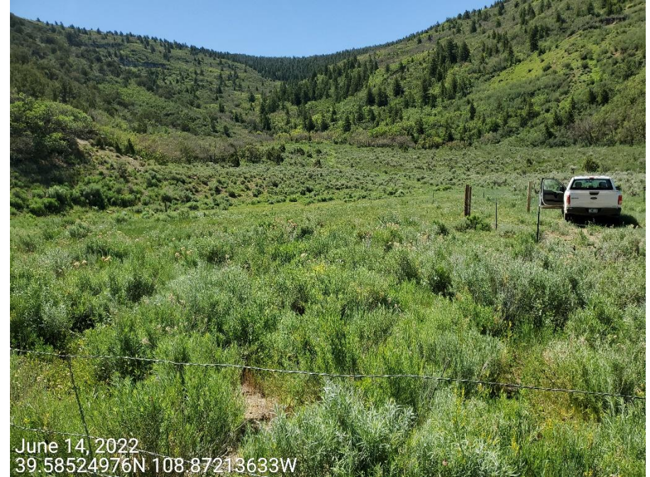
Photo 1: Photos taken from the north end of the Location, facing southeast / south. Photos show reclamation of the Location meets 1004 reclamation requirements,