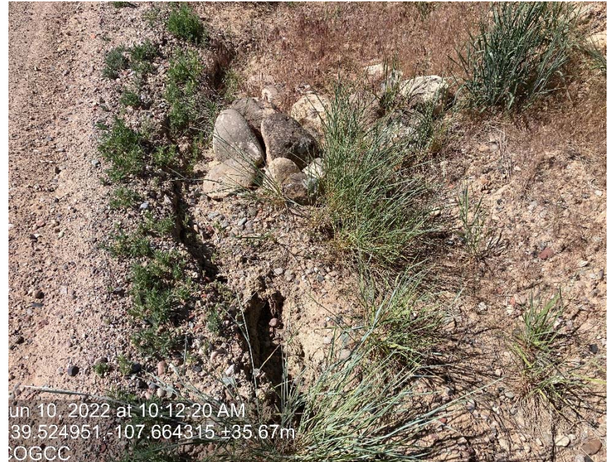
Check dam not working on access road