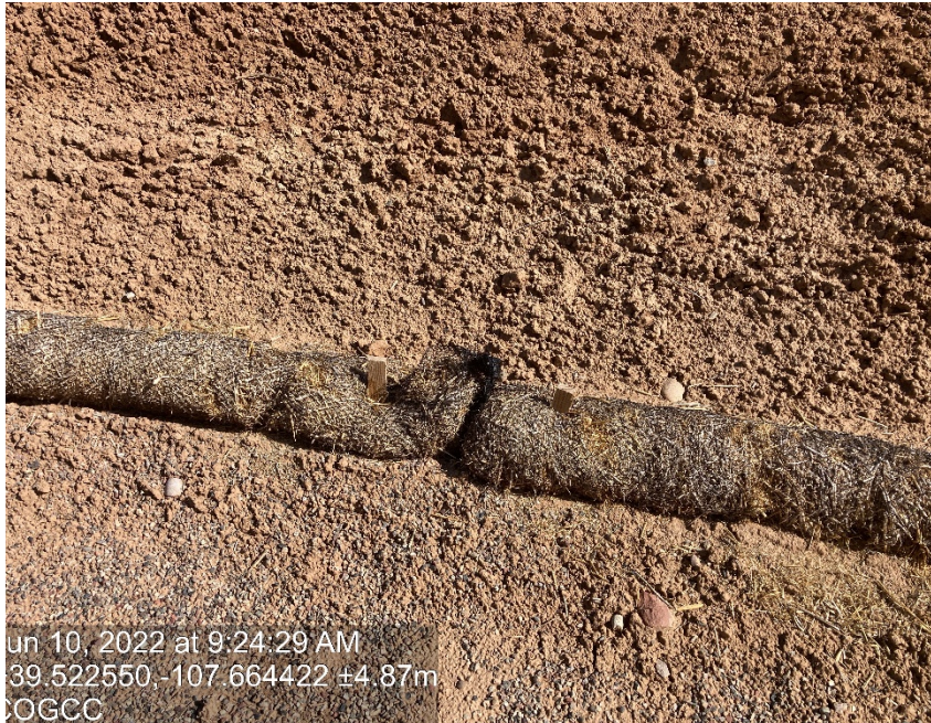
Waddles butt together not overlapped