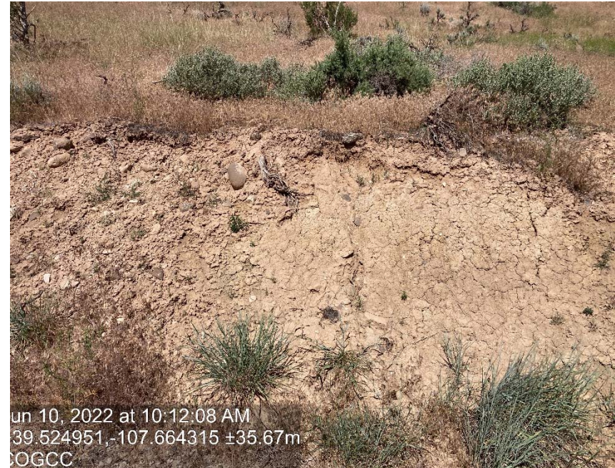
Lack of stabilization on access road