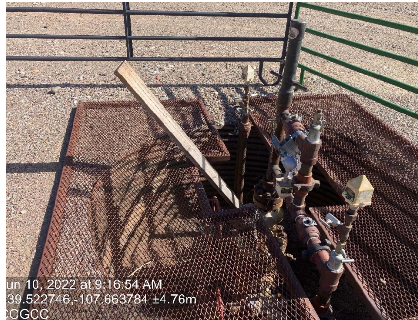
Wild life ramp