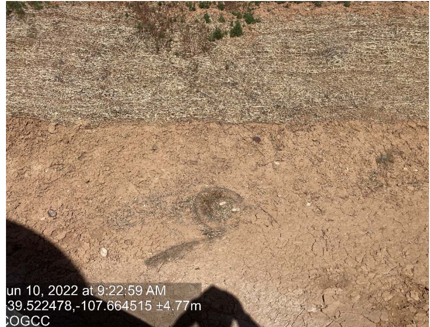
Debris old waddle buried from slope erosion