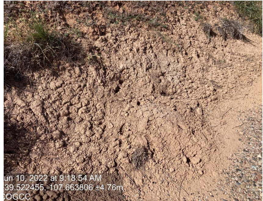
Lack of stabilization