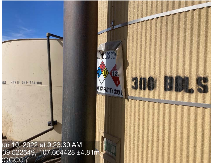
Label falling off of tank