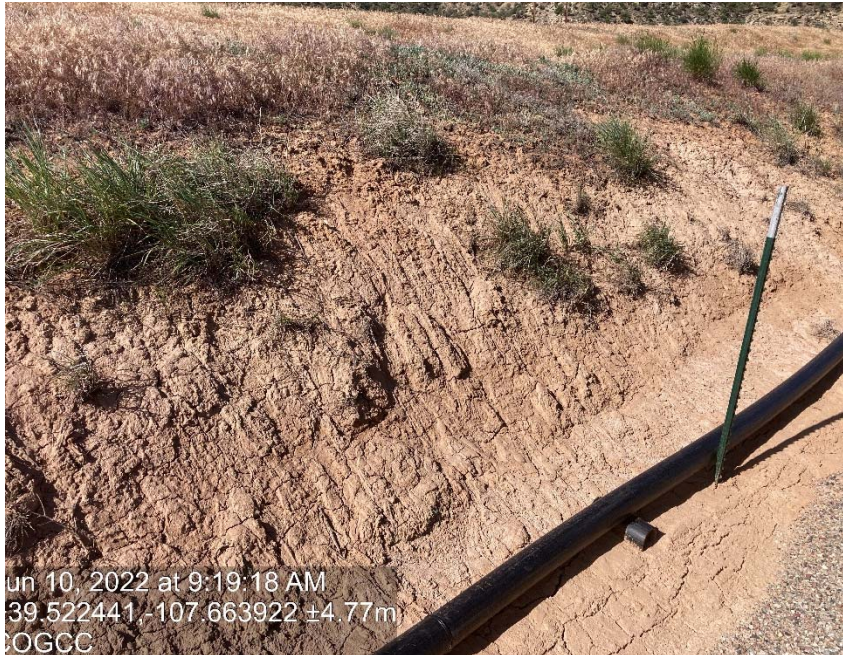
Lack of stabilization