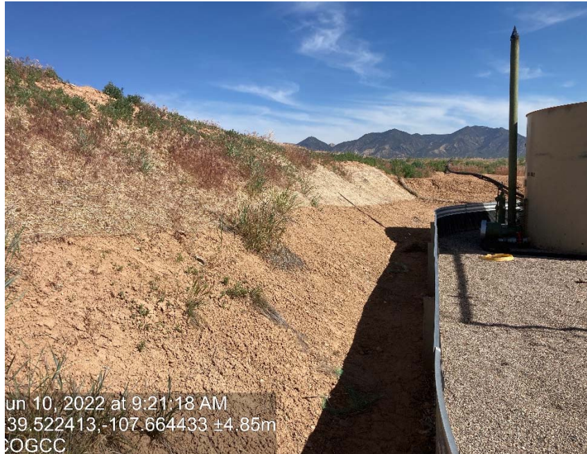
Lack of stabilization