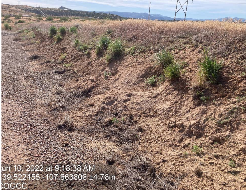
Lack of stabilization