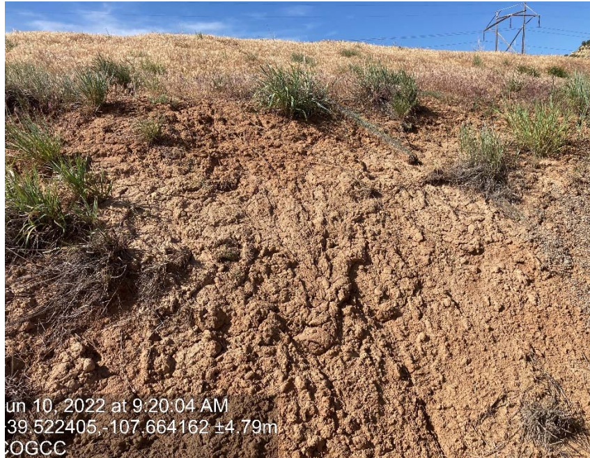
Lack of stabilization