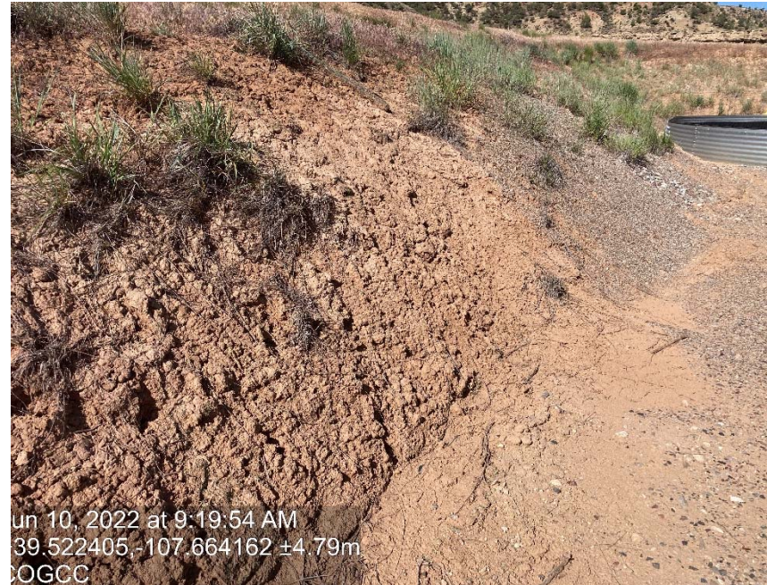
Lack of stabilization