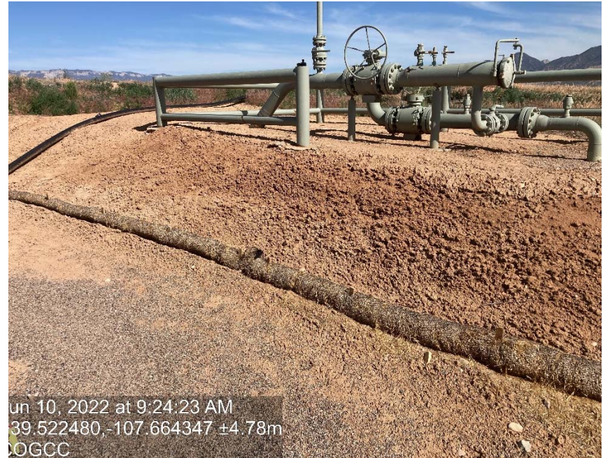
Lack of stabilization