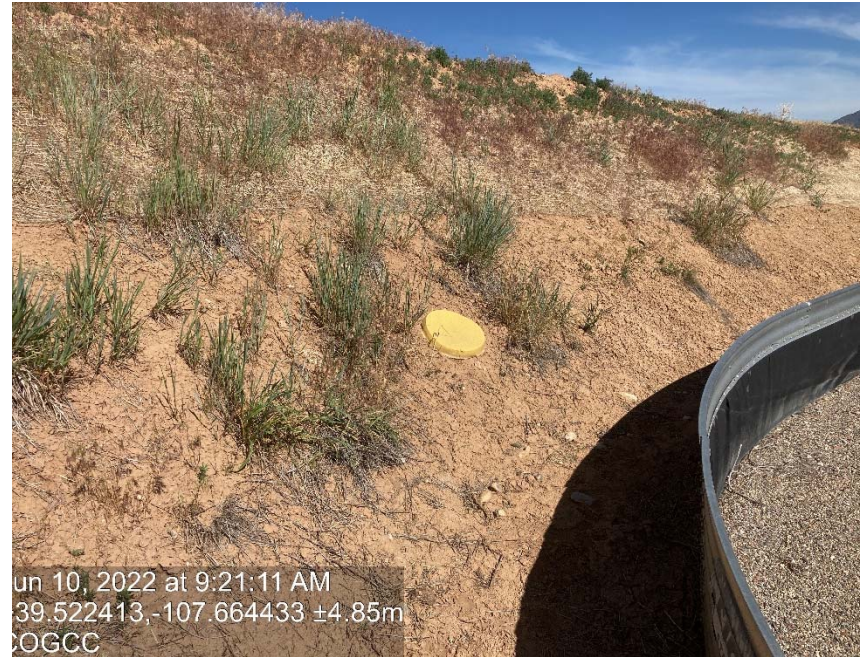
Lack of stabilization/ Debris