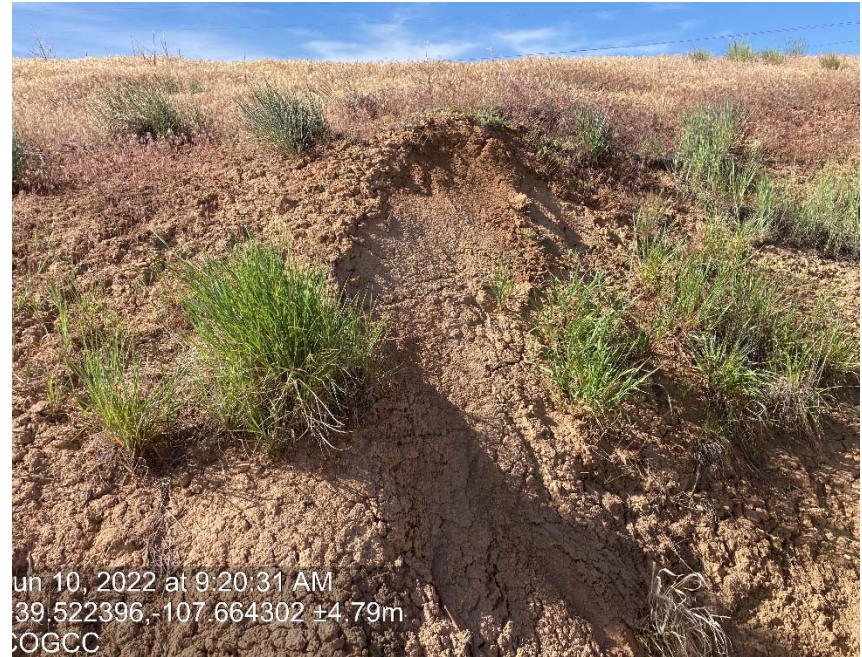
Lack of stabilization (photo from recent inspection)