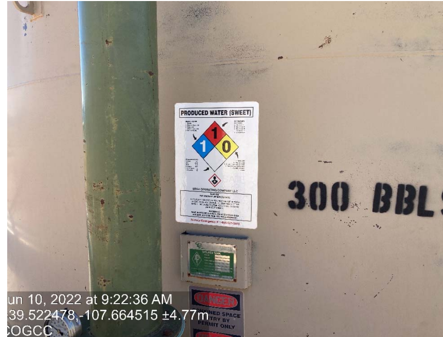
Label with different operator