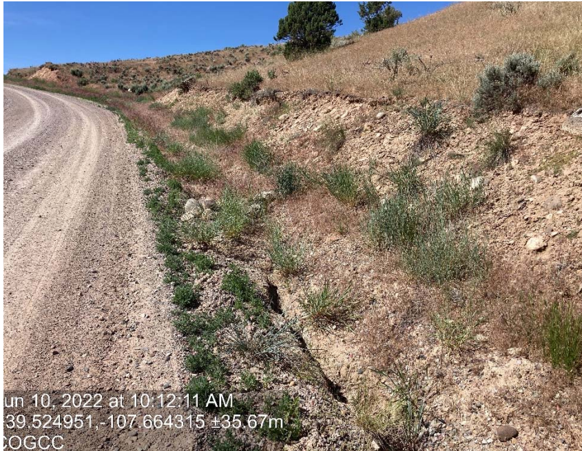
Check dam not working on access road