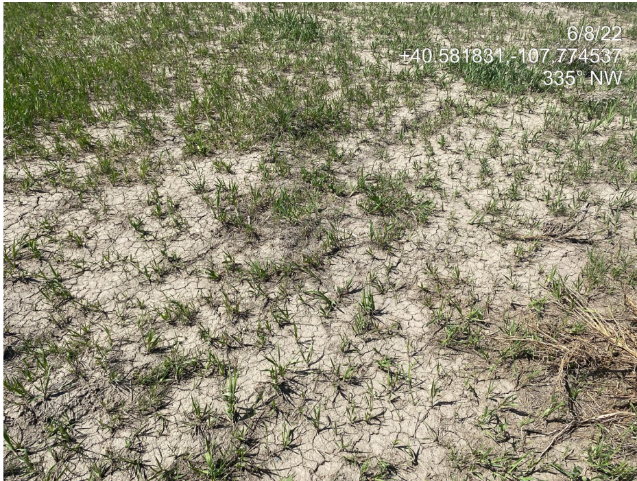
Photo 7. Photo taken from the north of the Location shows interim areas with poor vegetation cover due to highly compacted soils.