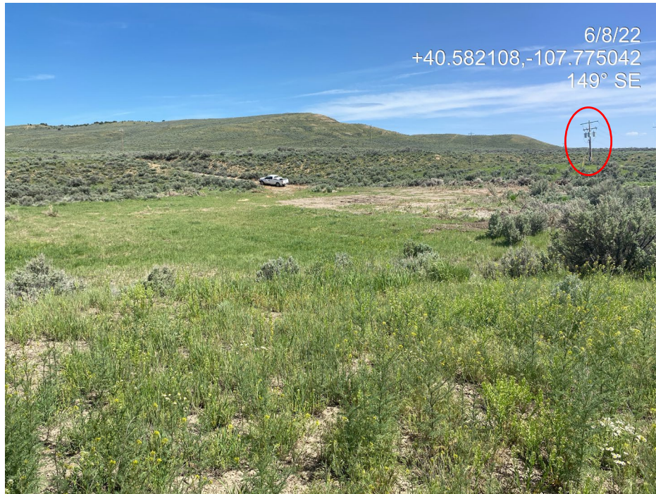
Photo 3. Photo taken from the northwest of the Location shows a power line to the south which must be removed for final reclamation. Photo also shows the contour of the pad does not match the surrounding landscape.