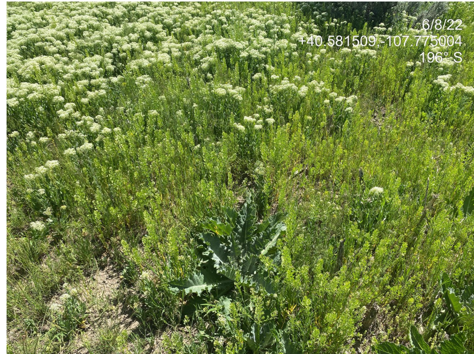
Photo 6. Photo taken from the south of the Location shows a patch of whitetop and a scotch thistle, both noxious weeds.