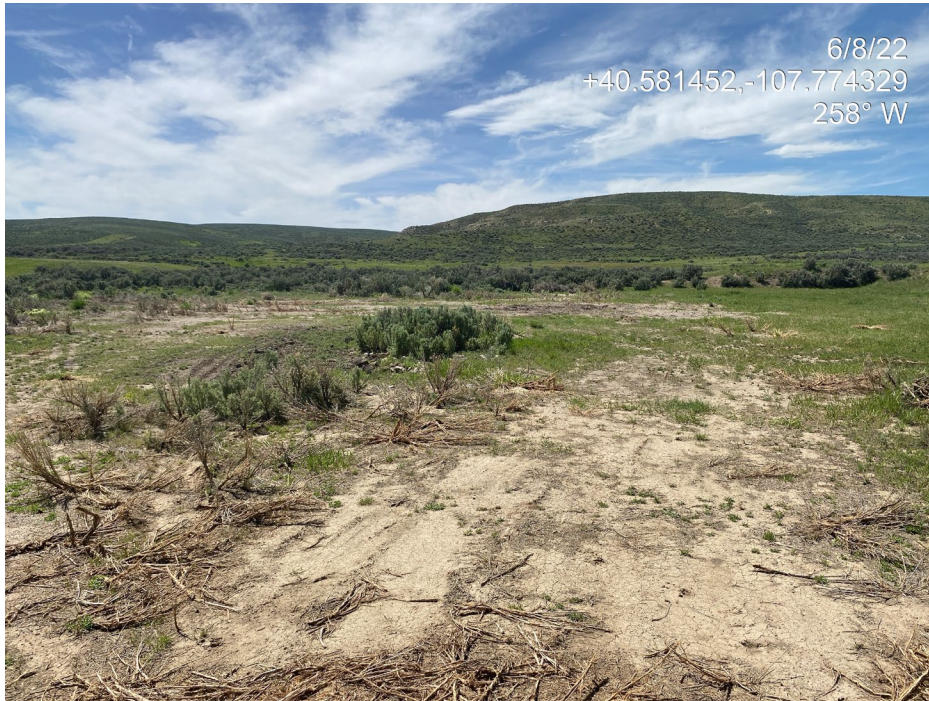
Photo 1. Photo taken from the south of the Location shows an overview of the Location.