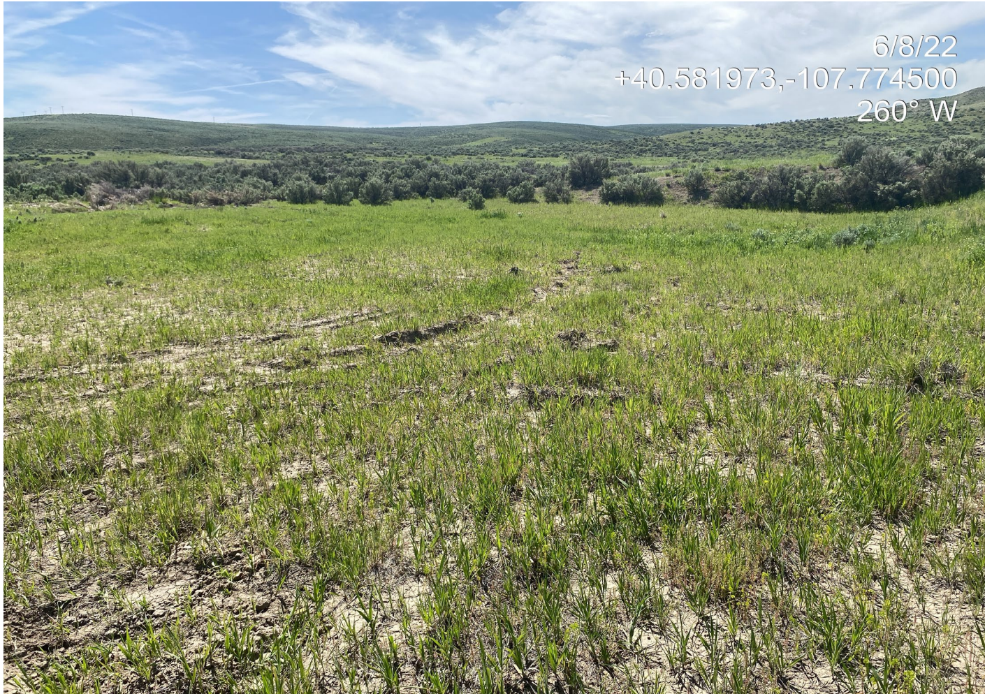
Photo 9. Photo taken from the north of the Location shows areas seeded with smooth brome, a nonnative species not found in the adjacent reference areas.