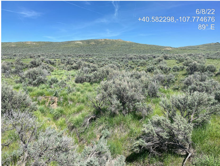
Photo 11. Photo taken from the north of the Location shows adjacent reference area vegetation.