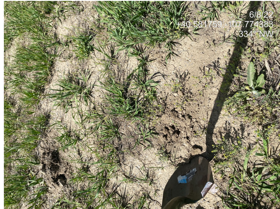
Photo 8. Photo taken from the north of the Location shows interim areas with highly compacted soils.