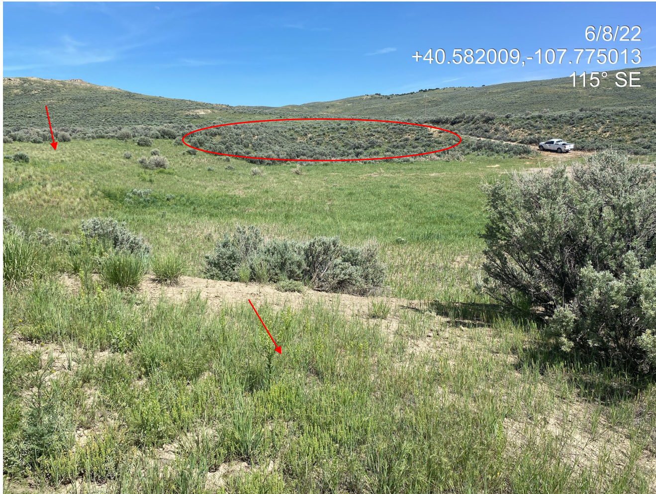
Photo 10. Photo taken from the northwest of the Location shows the contour of the Location does not match the adjacent areas. The cut slope (red circle) remains. There are also several berms and /or soil piles on Location (red arrows).