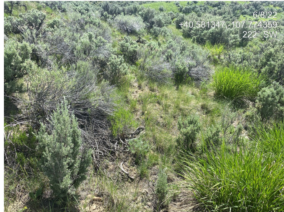
Photo 12. Photo taken from the south of the Location shows adjacent reference area vegetation.