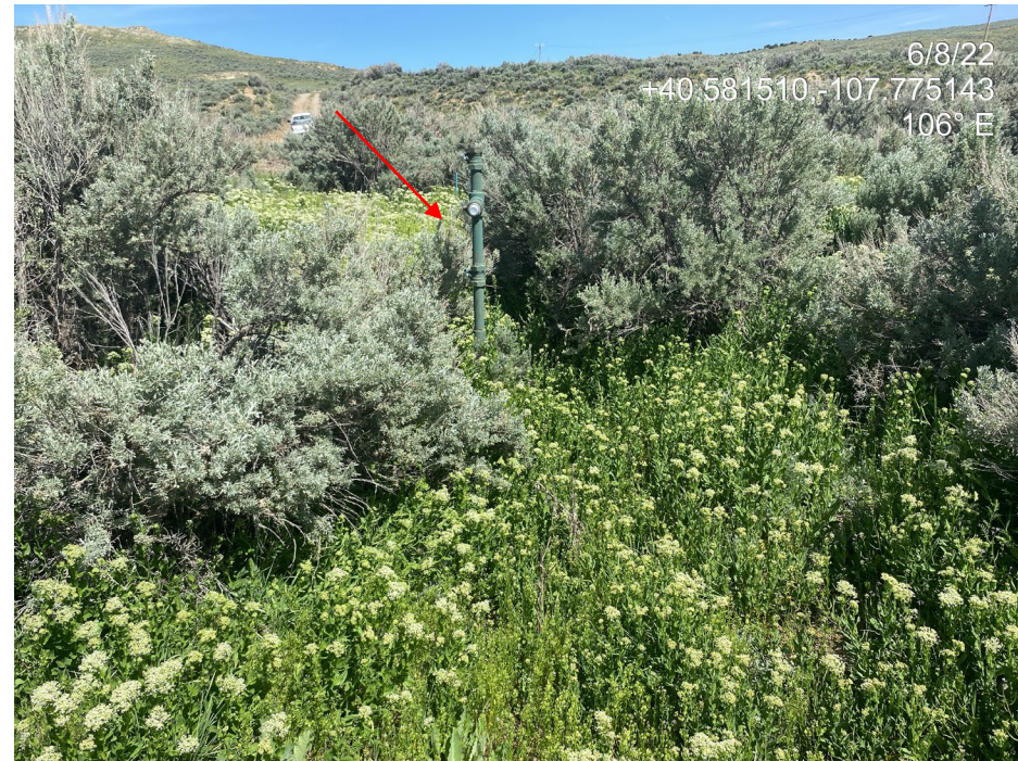
Photo 4. Photo taken from the south of the Location shows a riser which will need to be removed for final reclamation. Also note dense cover of whitetop, a noxious weed.