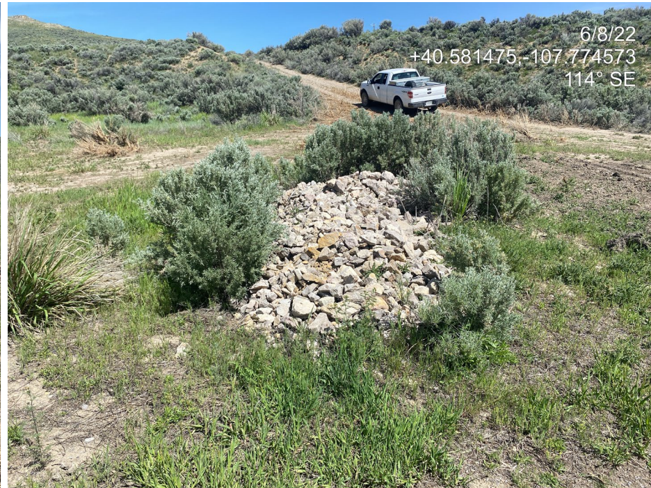
Photo 2. Photo taken from the south of the Location shows a pile of stone which must be removed for final reclamation.