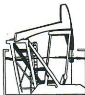
Lufkin 456 w/ Wauk 330gas engine

Surface: 2450' FWL & 3000' FSL Sec. 31, T12S, R50W Cheyenne County, CO Completed: October 1984 Elevation: 4805' KB: 9' API #: 05-017-6478