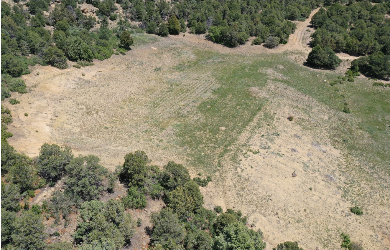
Photo 5. Facing northeast toward the location. The location is not recontoured and reclaimed. Previous corrective action was not performed.