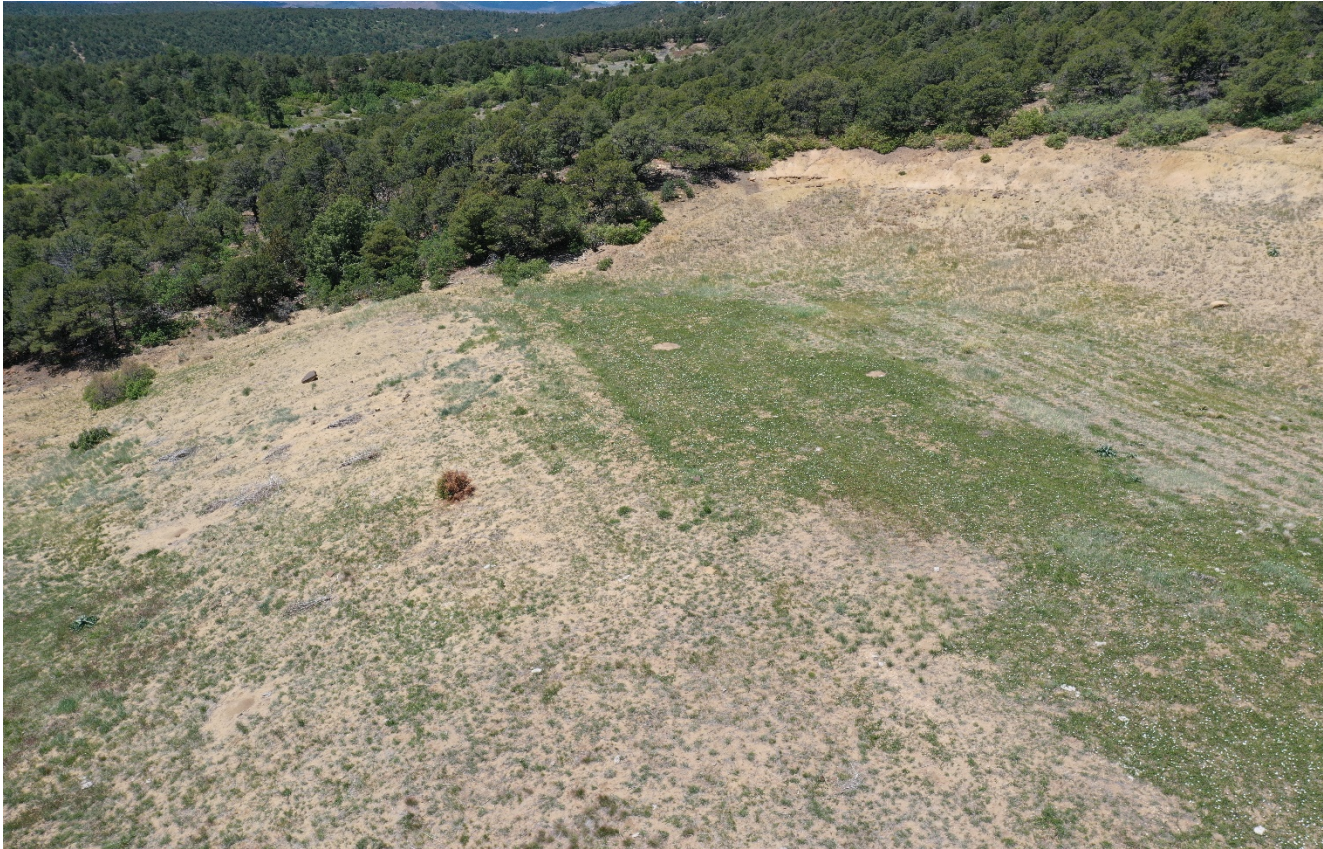
Photo 3. Facing southwest down toward the fill slope of the location. The desirable vegetation has not reestablished at the location and there were noxious weeds observed including Red stem filaree, Field bindweed, and Scotch thistle.