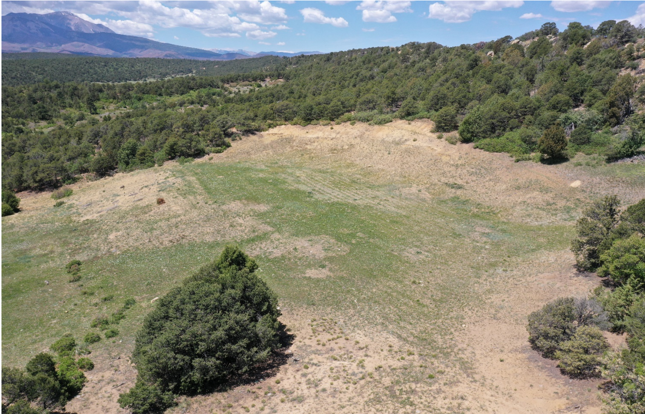
Photo 2. Facing southwest toward the location which was not recontoured and reclaimed. Previous corrective action was not performed.