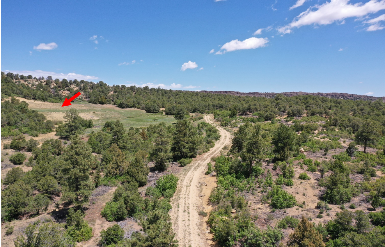
Photo 1. Drone aerial photo facing north along the former access road. The road was not recontoured and reclaimed but continues on past the location. Location shown at red arrow.