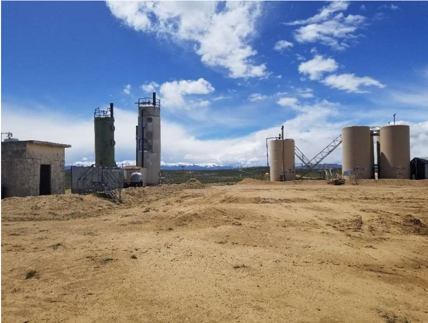
Photo 3. Overview of battery portion of location taken facing west.