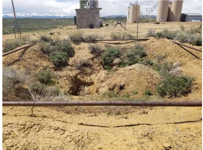
Photo 4. Photo of pit taken facing west.