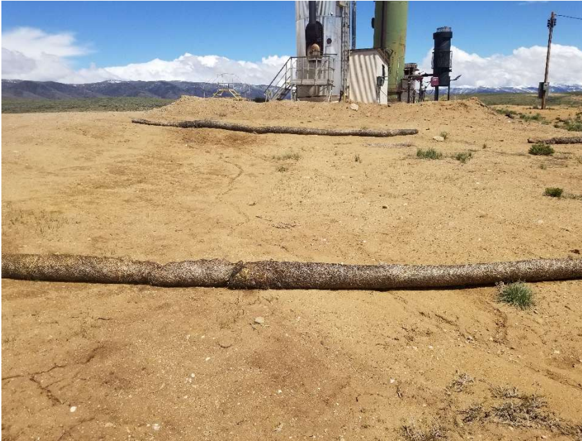
Photo 5. Sediment migration occurring under and through wattles.