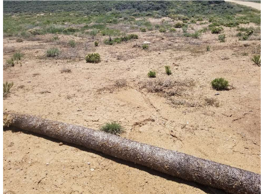
Photo 6. Sediment migrating under and through wattles and off location.