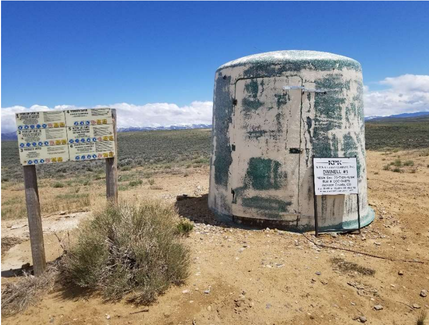
Photo 1. Overview of wellhead portion of location taken facing east.