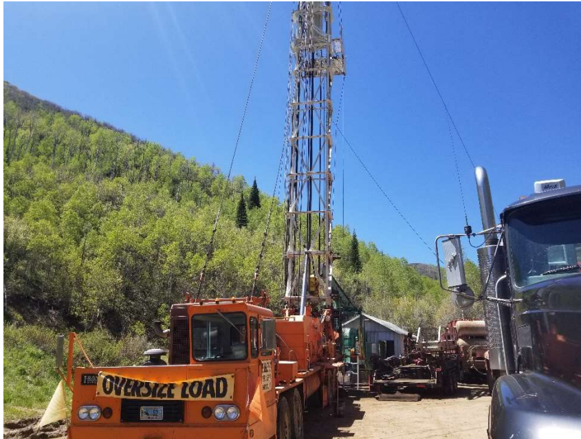
Photo 1. Workover on location replacing stuck pump.