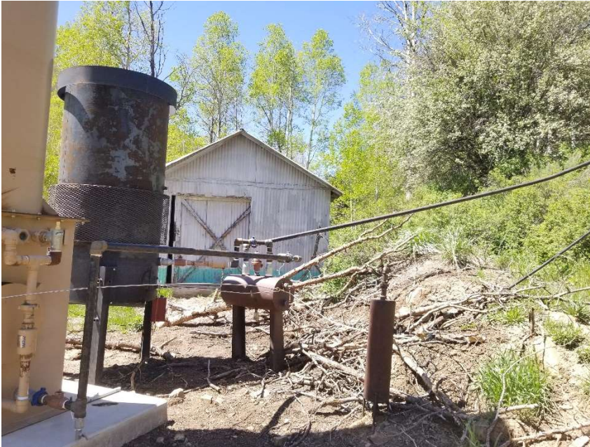
Photo 3. Photo of line plumbed from separator uphill into new combustor.