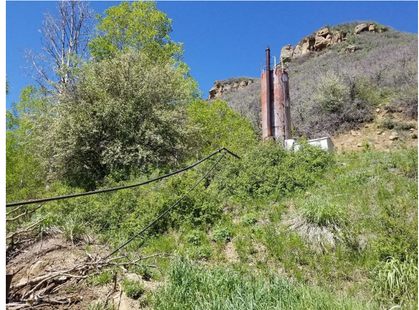
Photo 4. Photo of line going uphill to separator.