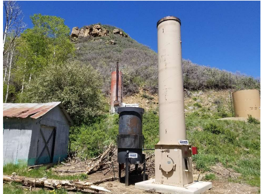
Photo 2. Tan combustor has been added to location. Black one does not appear to be in use.