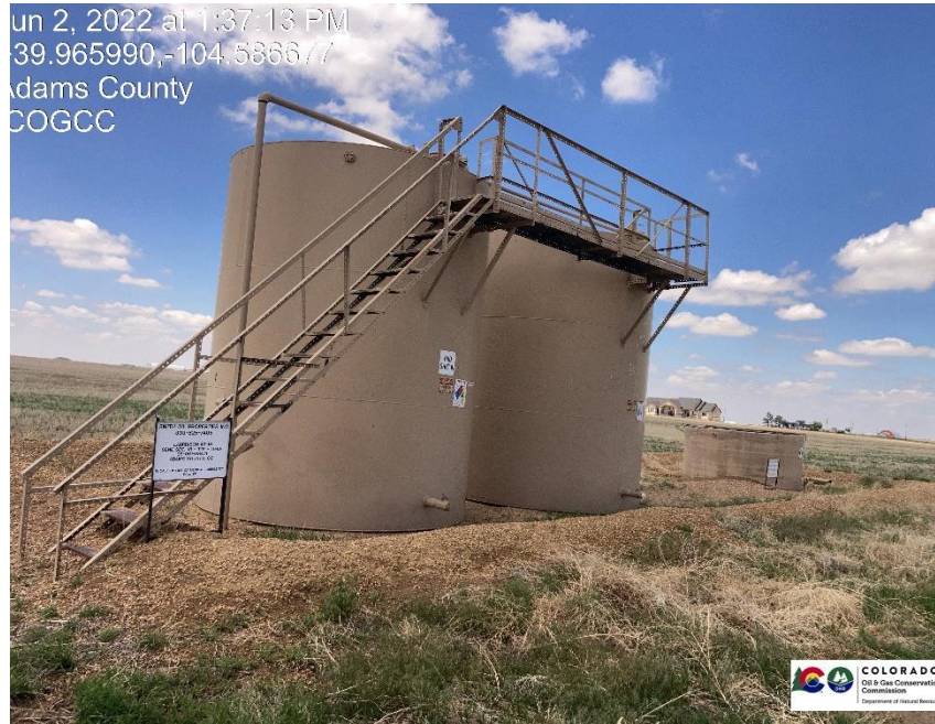
Pic 3 tanks