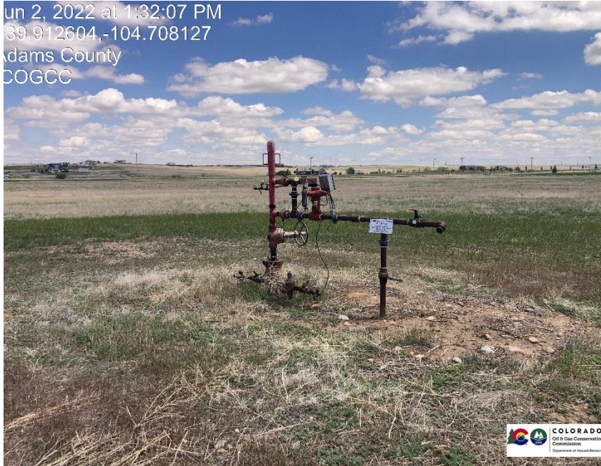
Pic 1 wellhead

Jun 2, 2022 at 1:32:07 PM 39.912604,-104.708127 Adams County COGCC