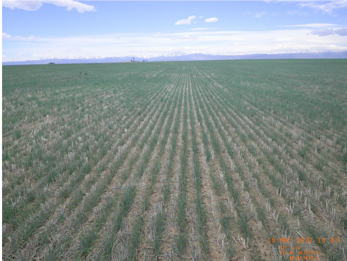
Photo 2. Overview photo of the well pad taken from the eastern edge looking west.