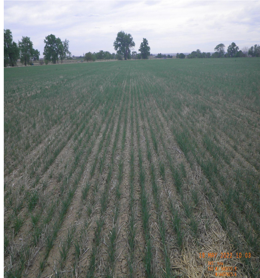
Photo 3. Carindal photos taken from the middle of the well pad. Left photo facing north, right photo facing east.