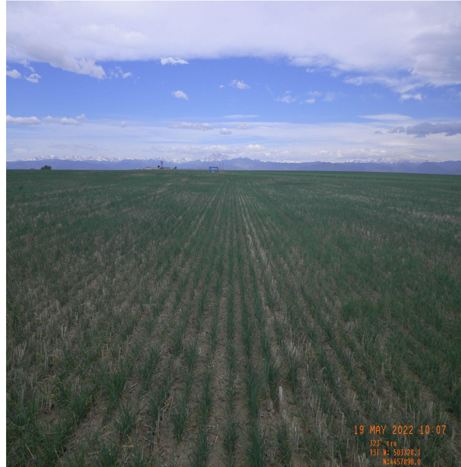
Photo 4. Cardinal overview photos taken from the middle of the well pad. Left photo facing south, right photo facing west. Note: crop growth within well pad appears consistent with surrounding crop.