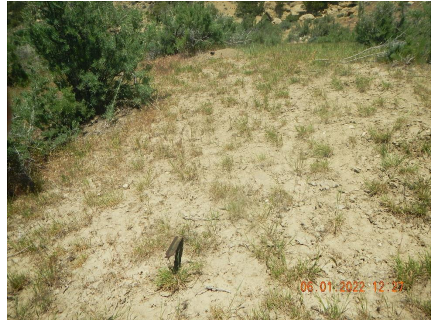
South east edge of location.