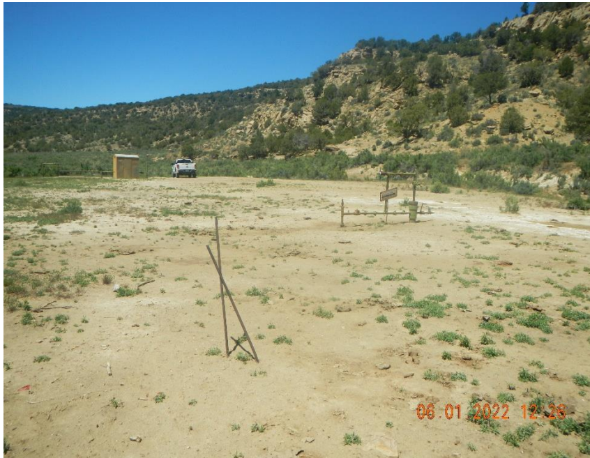
2 rods in the ground. Purpose unclear.