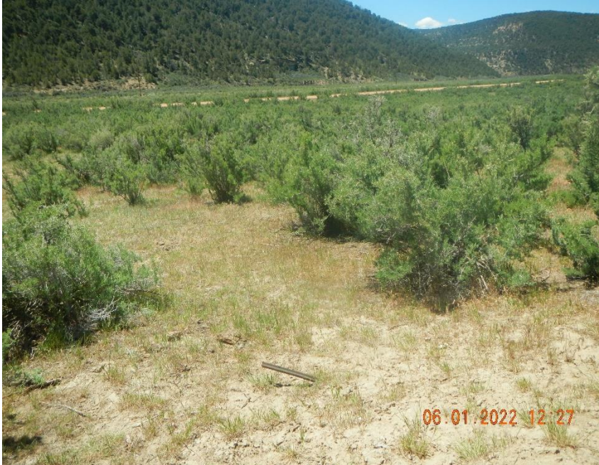
Marker is knocked over and not brightly colored.