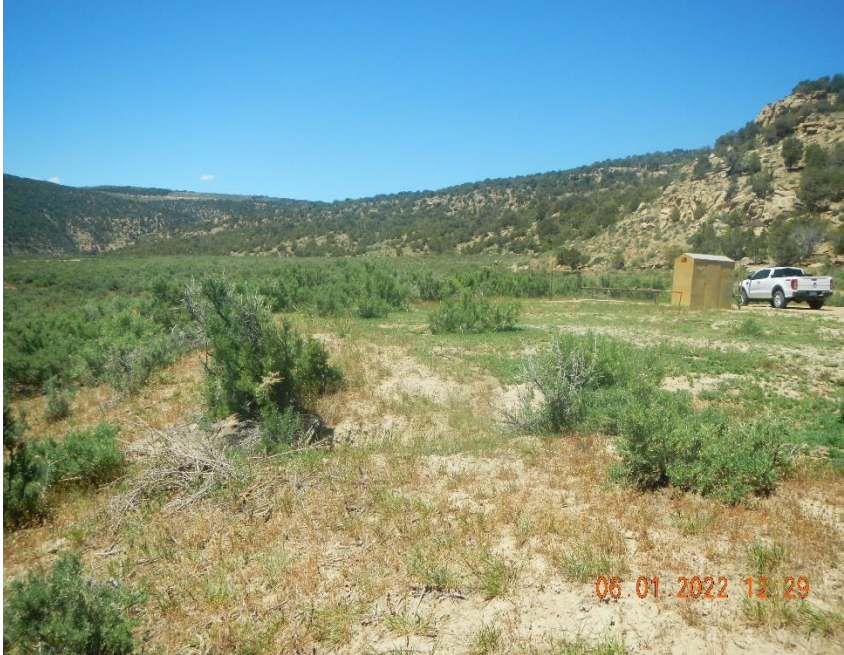
Storm water erosion on south edge of location.