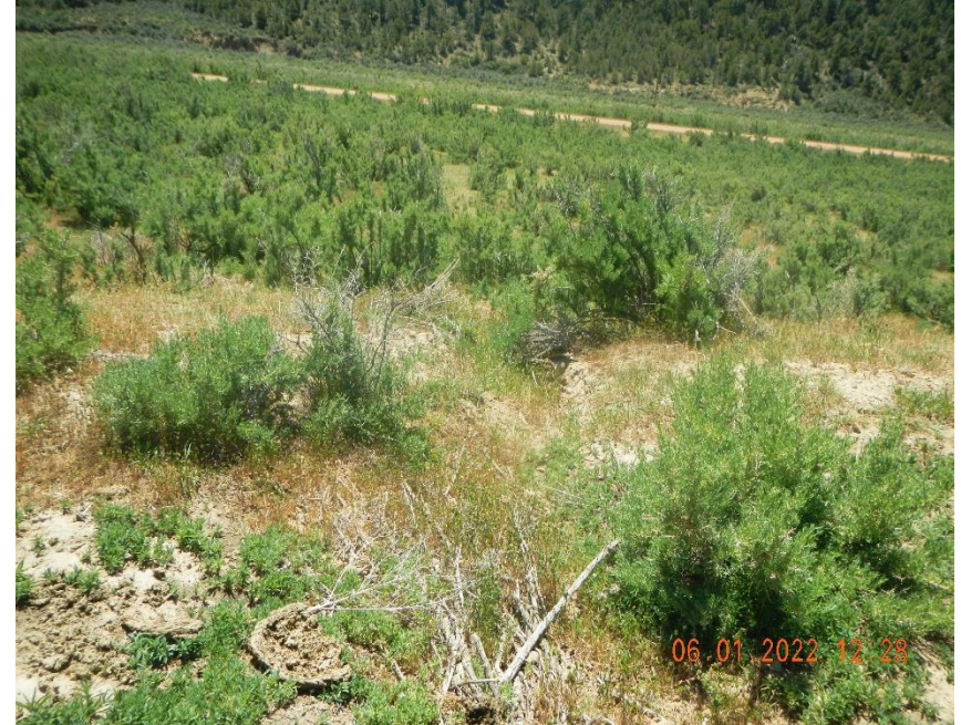
Storm water erosion on south edge of location.