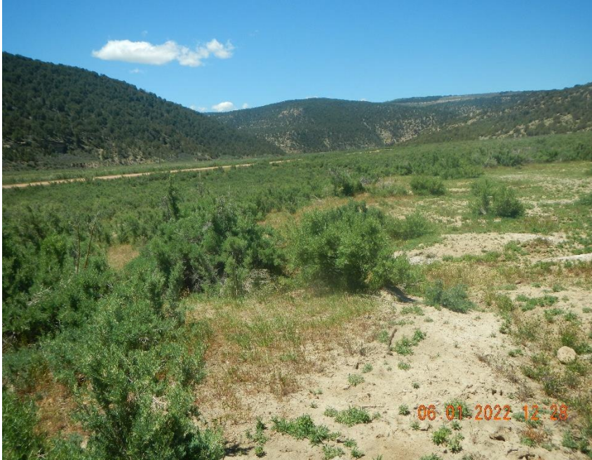
Storm water erosion on south edge of location.