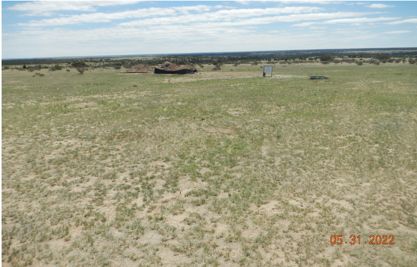
Photo 2. Facing southeast toward the location.