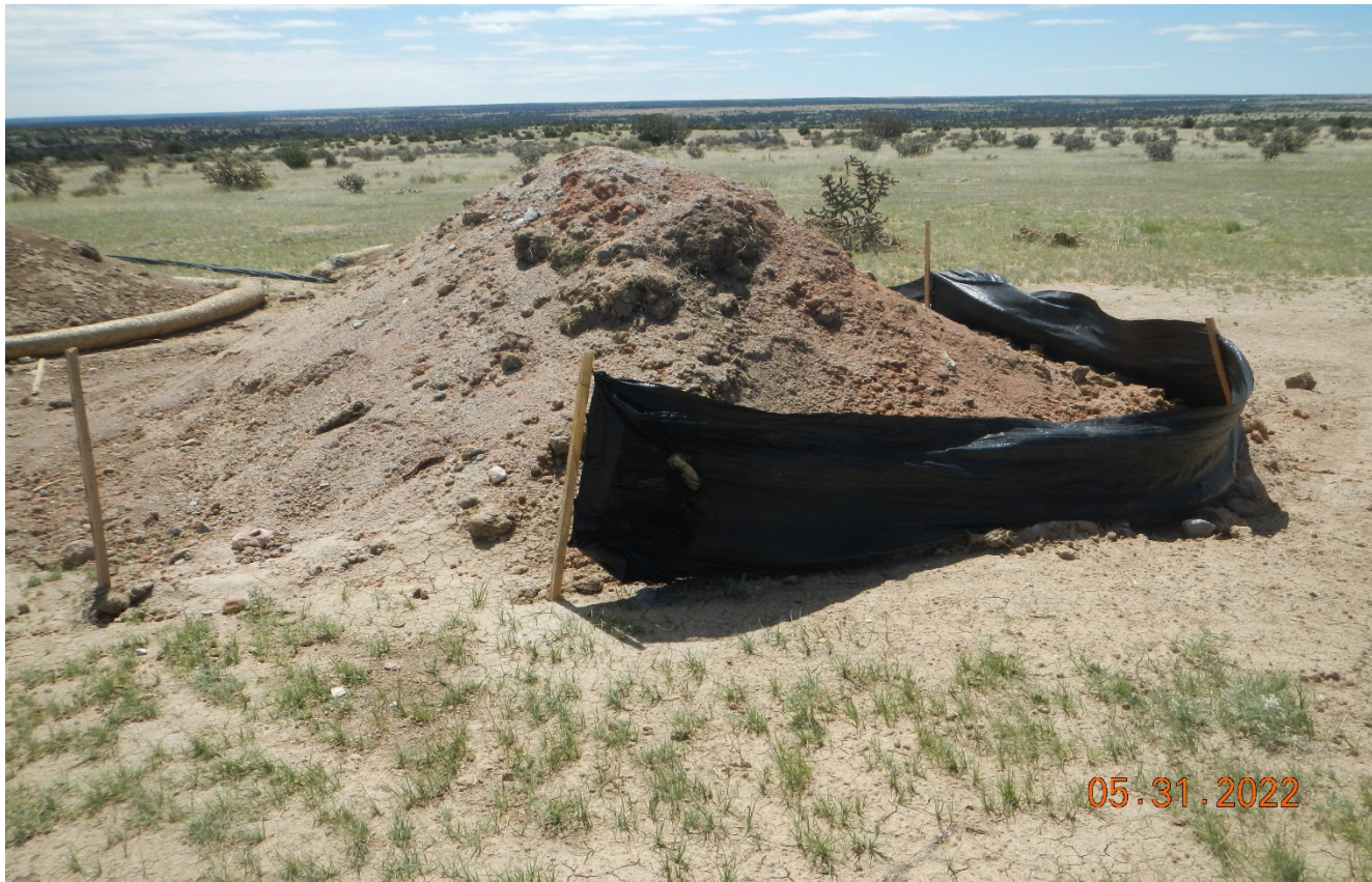
Photo 4. There is inadequate stormwater controls down gradient and around the cuttings pile. The silt fence is not properly installed or maintained.