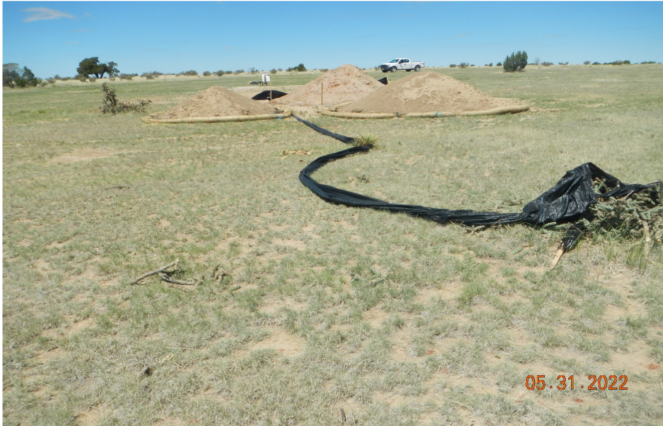
Photo 6. The silt fence is strung across the location.