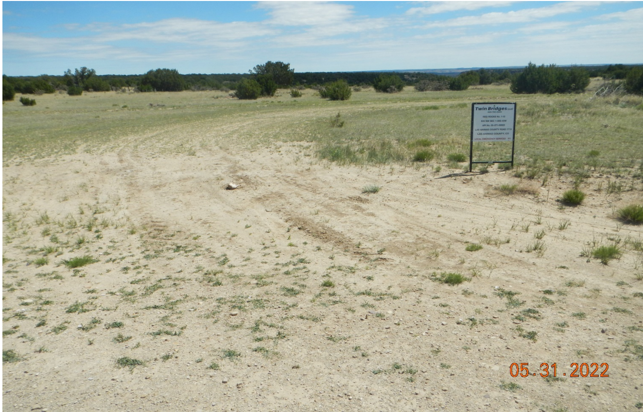
Photo 1. Facing southeast at the entrance of the access road. Sign is posted at entrance.