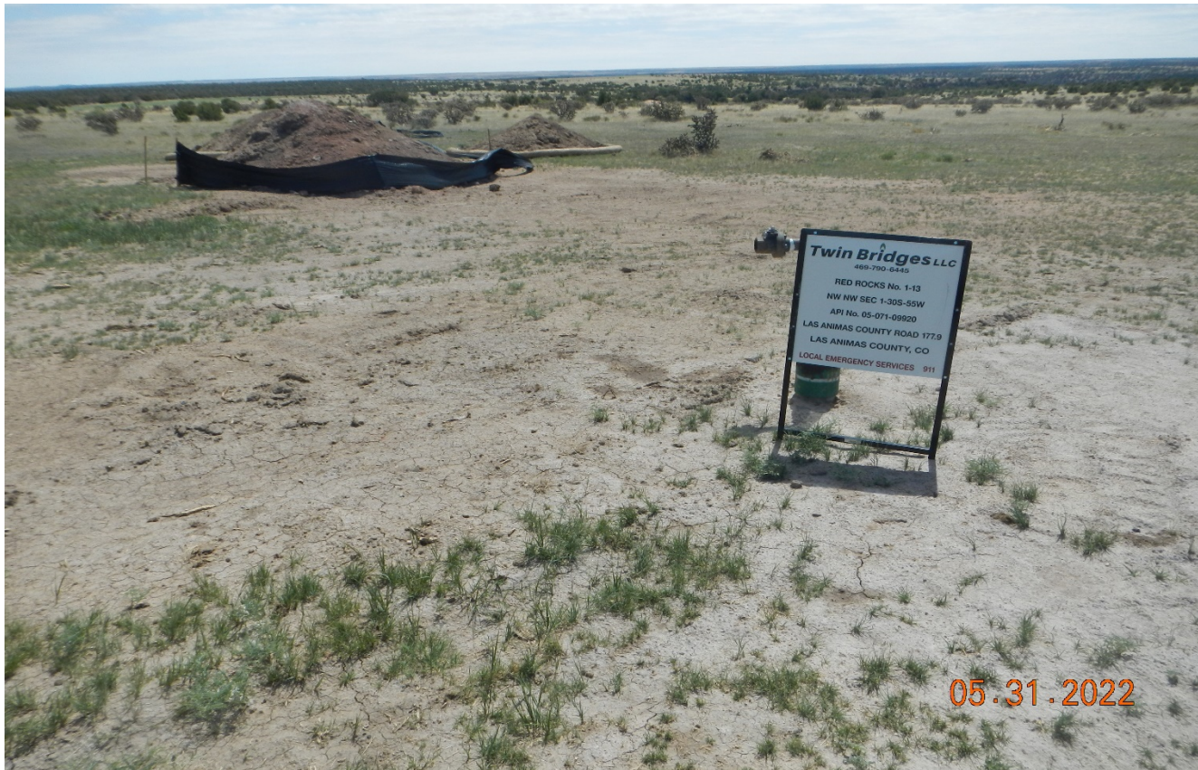
Photo 3. The well has been drilled at the location.