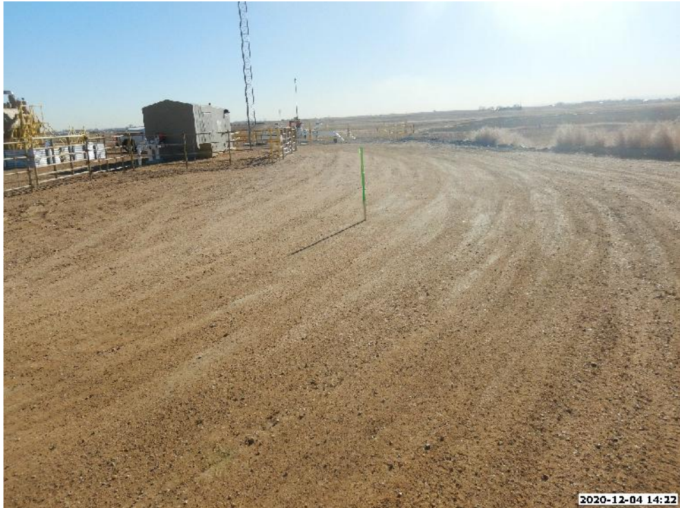
LOCATION PICTURE OF BERRY FARMS 8-8HZ FACILITY PAD - CAMERA VIEW SOUTH