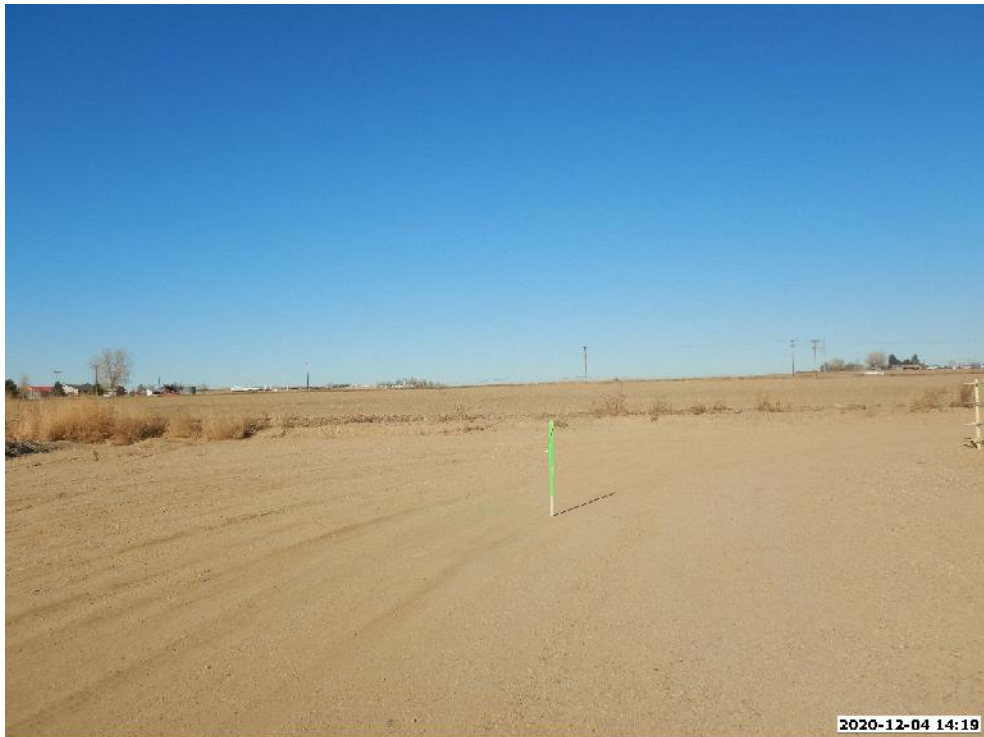
LOCATION PICTURE OF BERRY FARMS 8-8HZ FACILITY PAD - CAMERA VIEW NORTH

N1/2 NE1/4 SECTION 8, TOWNSHIP 3 NORTH, RANGE 67 WEST, 6TH P.M., WELD COUNTY, COLORADO