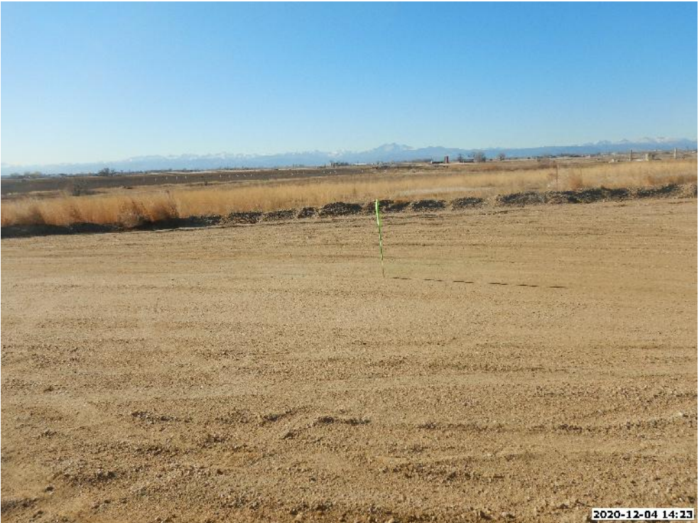
LOCATION PICTURE OF BERRY FARMS 8-8HZ FACILITY PAD - CAMERA VIEW WEST

K:\ANADARKO\2020\2020_11_BERRY_FARMS_TN_167N_167E_8TH_P.M._WELD_CO_COLORADO\DWG\BERRY_FARMS.dwg, 12/8/2021 8:38:14 AM, seven