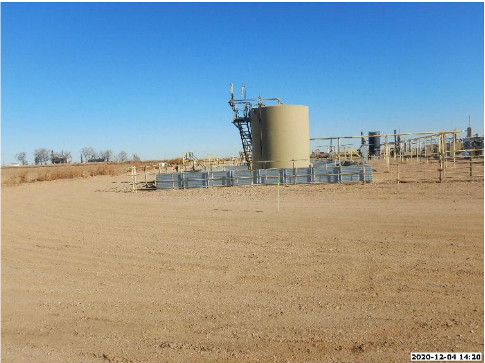
LOCATION PICTURE OF BERRY FARMS 8-8HZ FACILITY PAD - CAMERA VIEW EAST