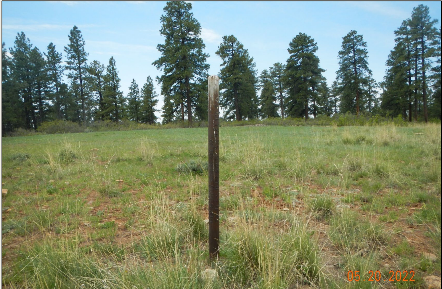
Photo 1. View of the plugged wellhead marker facing westward.