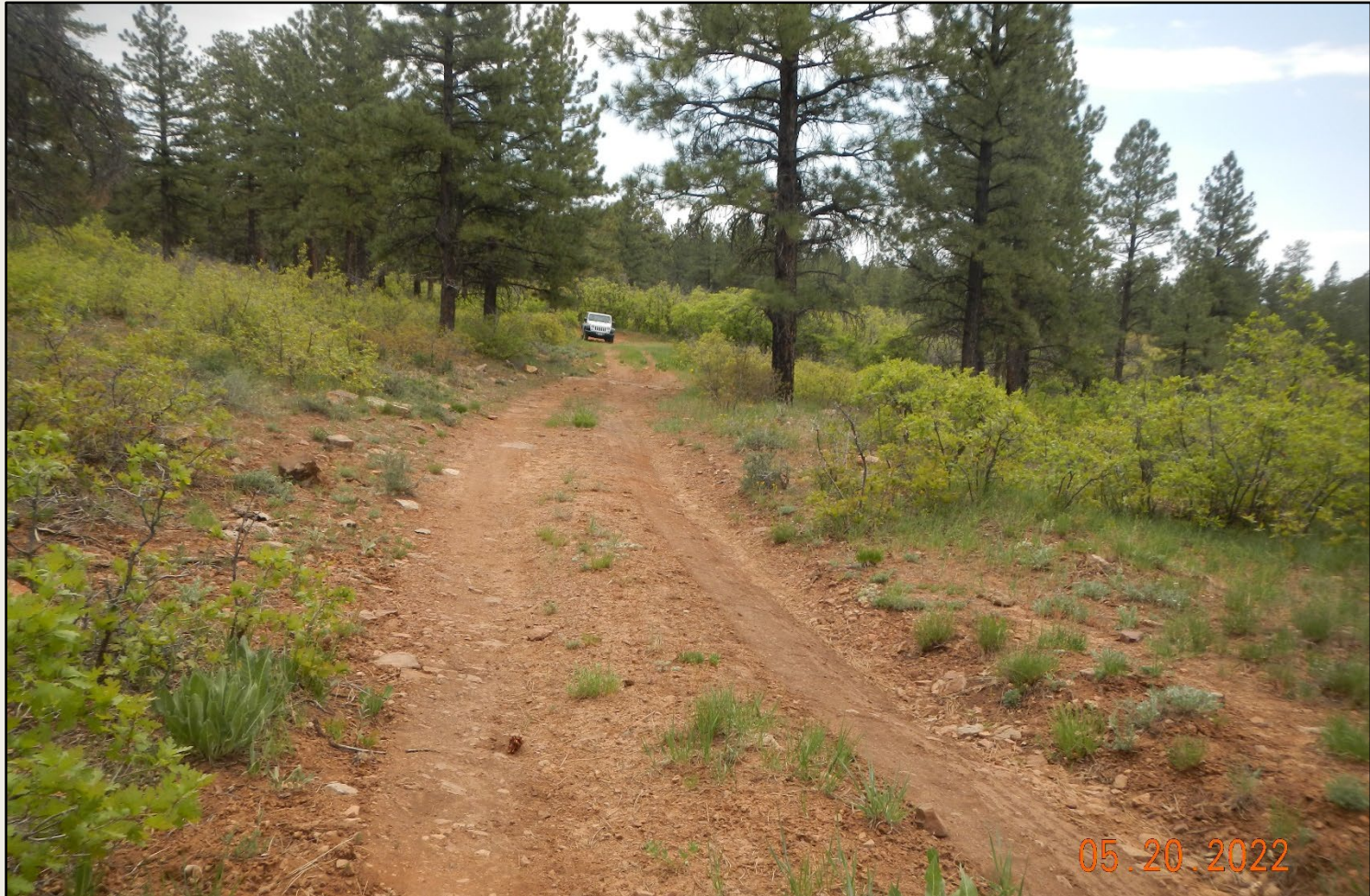
Photo 3. View of access road facing south toward the beginning of the access road (where Jeep is parked). Access road needs to be closed and reclaimed.