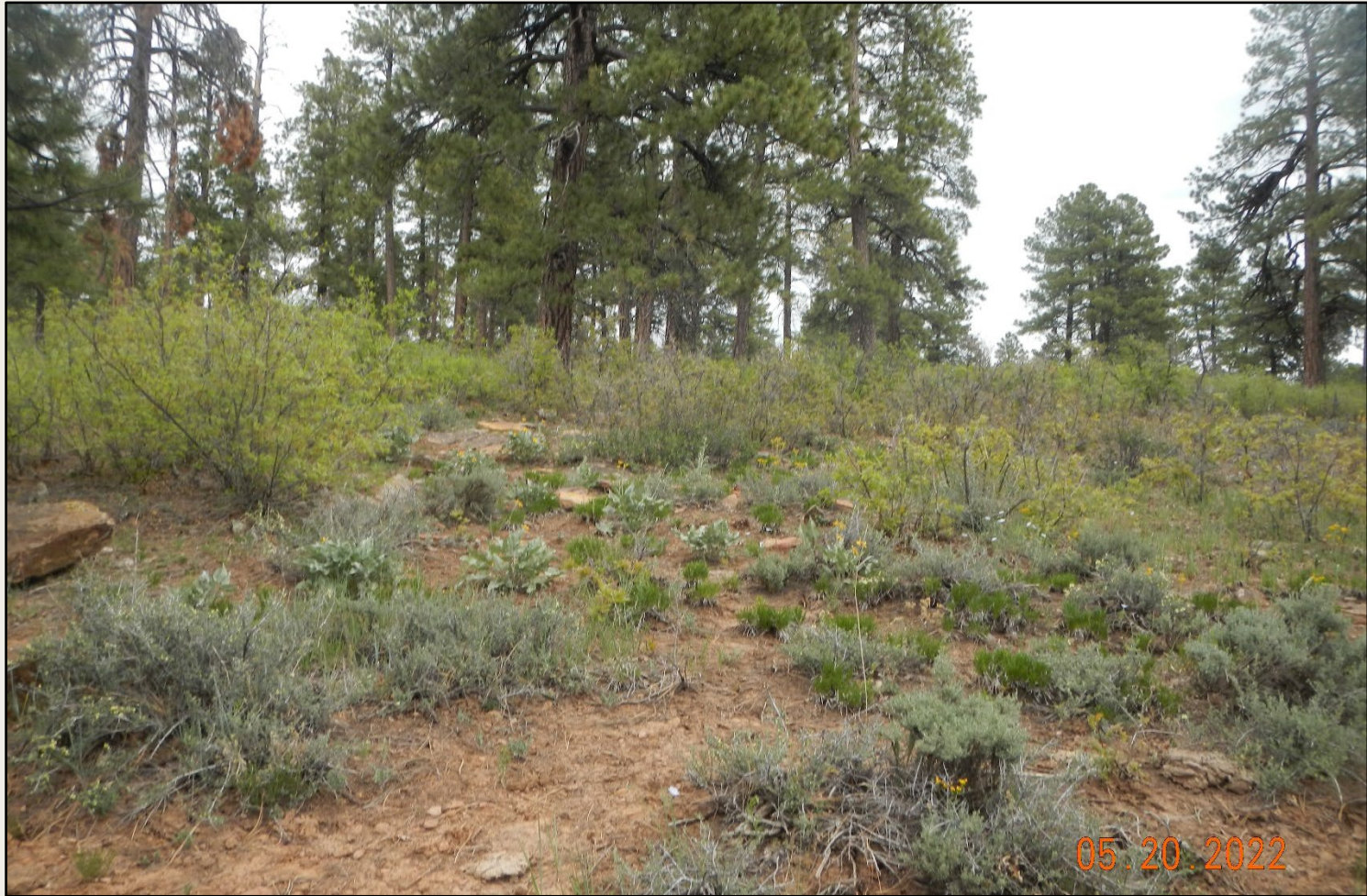
Photo 7. View of the reference area comprised of ponderosa pine woodland with gambel oak, black sage, mules ears, antelope bitterbrush, and sandberg bluegrass in the understory.