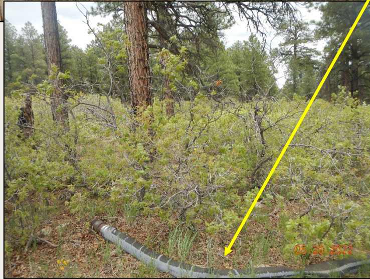
Photos 3-5. View of scattered trash and debris observed on and adjacent to the well pad, needs to be removed.