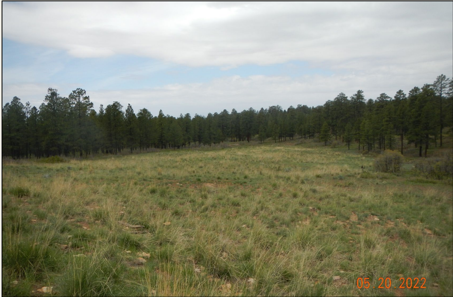
Photo 6. View of the northern portion of the project area, largely in a revegetated condition.