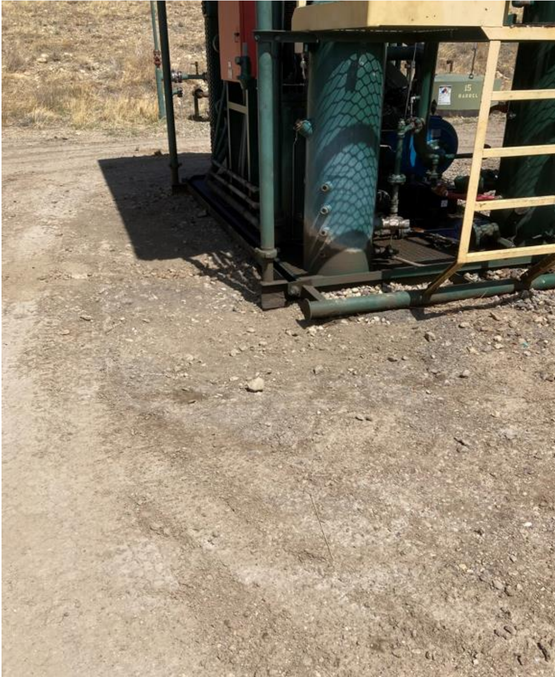
PHOTO 2: MAINTENANCE HAS BEEN PERFORMED, ALL AREAS OF IMPACTED SOIL NEAR THE COMPRESSOR SKID WAS CLEANED UP AND REMOVED FROM LOCATION. THE OIL ACCUMULATION ON THE LIQUID RING SKID WAS CLEANED UP AND THE SELF INSPECTION PROCESS HAS BEEN REVIEWED. ALL UNUSED EQUIPMENT HAS BEEN REMOVED FROM LOCATION.

APACHE CANYON 09-06 API# 05-071-09678 – OGRIS OPERATING COGCC OPERATOR NUMBER 10758 - DATE: MAY 24, 2022 CORRECTIVE ACTIONS COMPLETED REGARDING COGCC FIR DOCUMENT #695106010