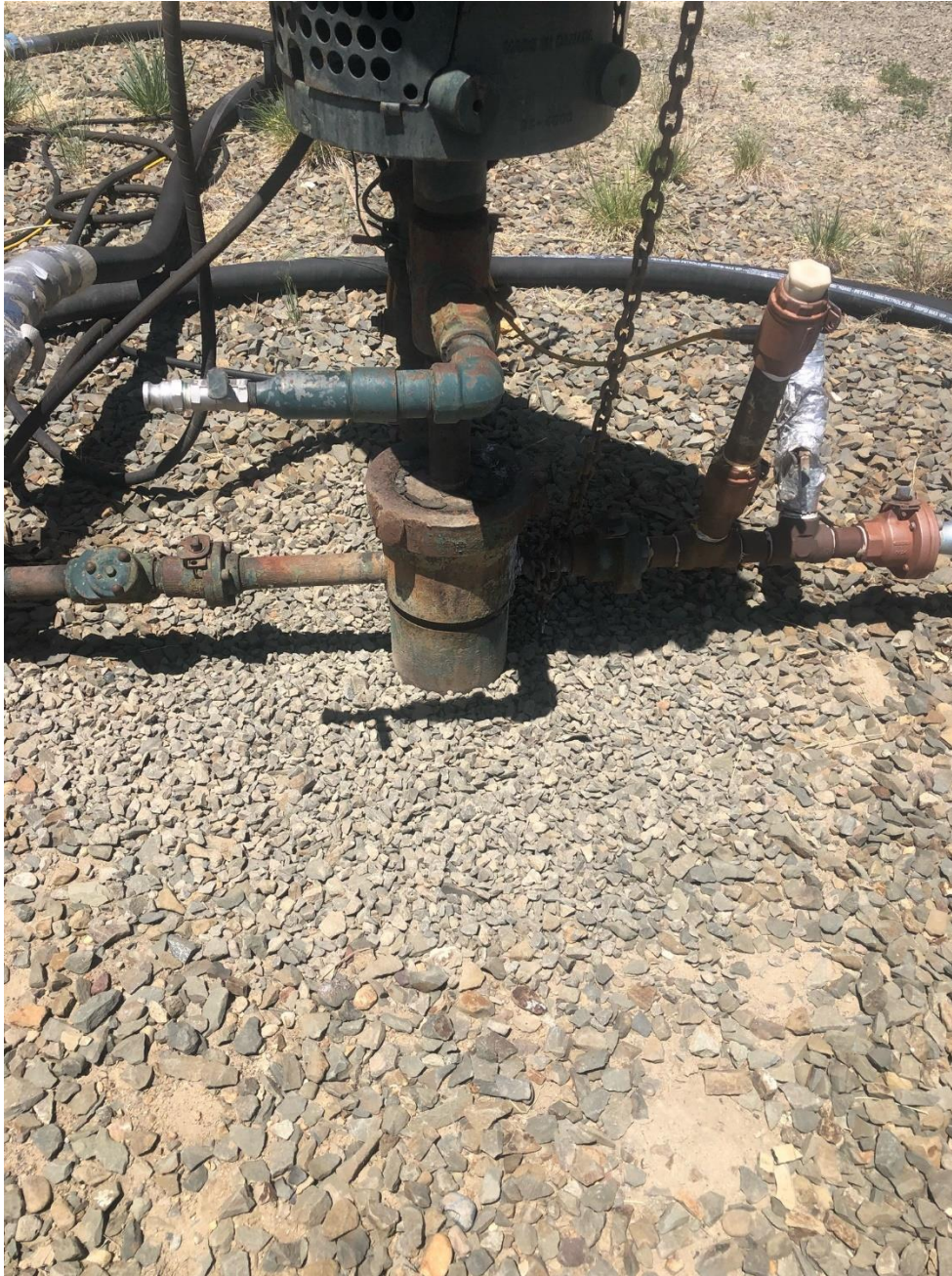
Installed appropriate fittings to allow bradenhead visual inspection as per Rule 419.a.(1), (2).