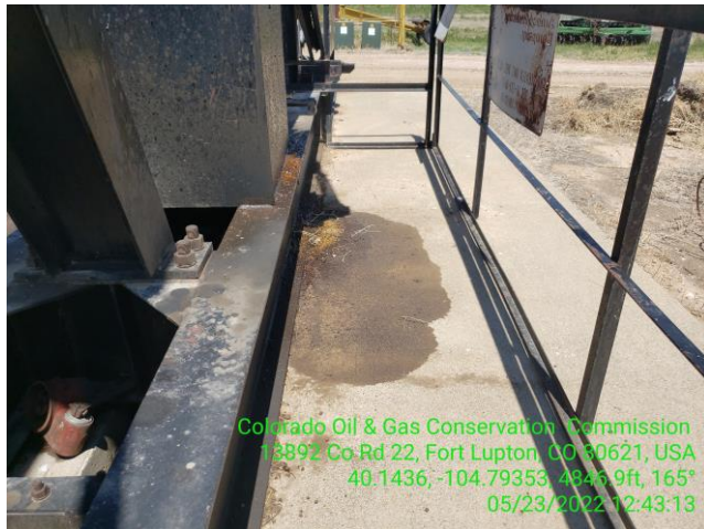
Photo 7 Stained concrete due to leaking seal.