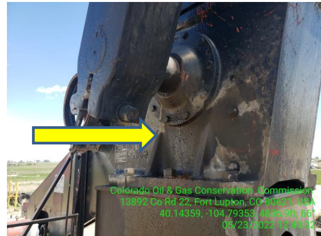
Photo 8 Pump Jack seal is leaking.