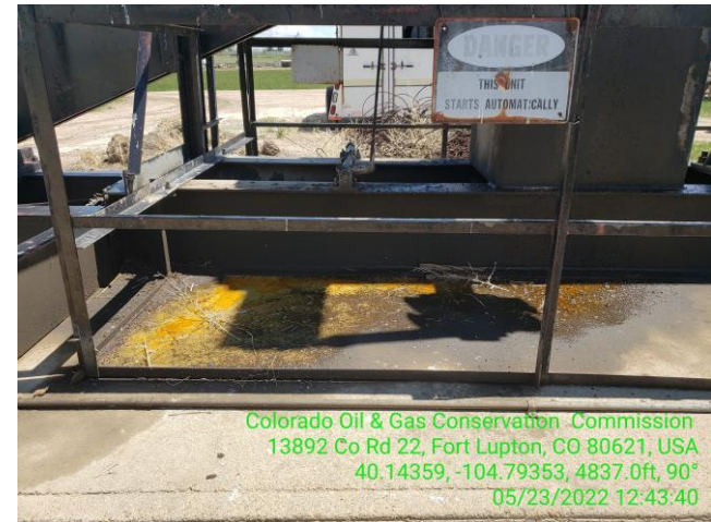
Photo 10 Stained concrete due to leaking seal.