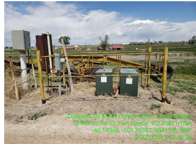
Photo 3 Pump Jack.