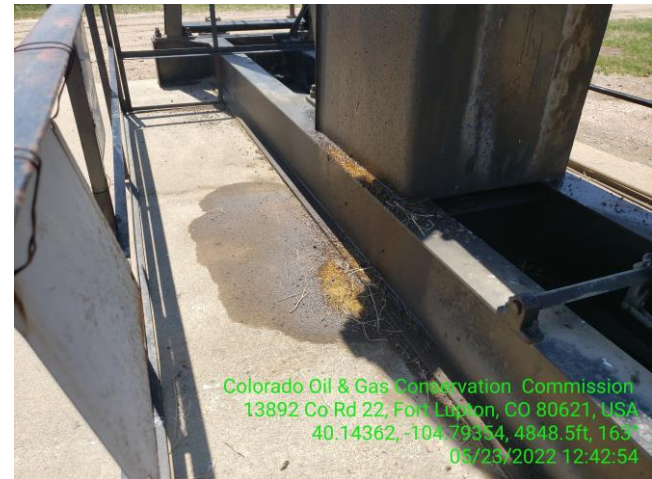
Photo 5 Pump Jack seal is leaking.