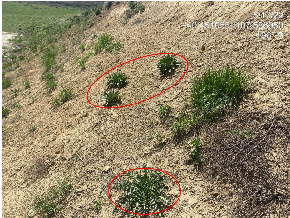
Photo 6. Photo taken from the cut slope at the west of the Location shows musk thistle and houndstongue, both CO List B Noxious Weeds.