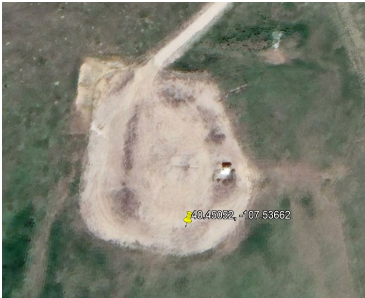
Photo 3. Map shows the Location of a ground nesting bird at the southern edge of the production pad. Implementing BMPs to avoid disturbing the nest advised.