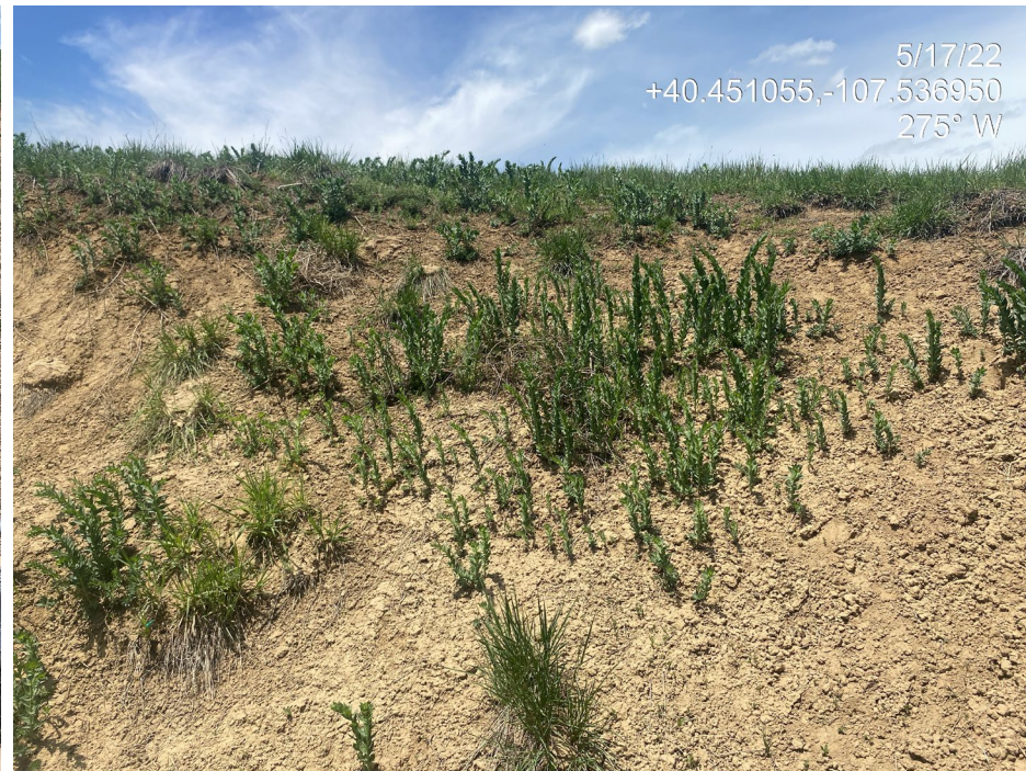
Photo 5. Photo taken from the cut slope at the northwest of the Location shows Dalmatian toadflax, a CO List B Noxious Weed.