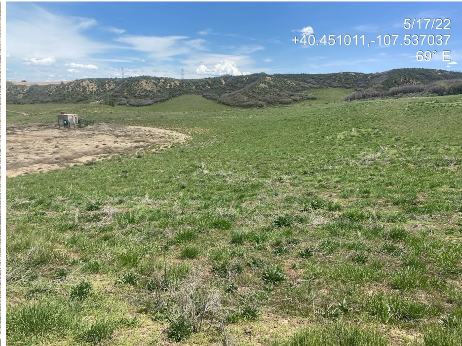
Photo 7. Photo taken from the southwest of the Location in the interim area shows an area of poor perennial grass establishment with annual undesirable plant species/weeds and noxious weeds. The forb throughout the foreground is houndstongue.