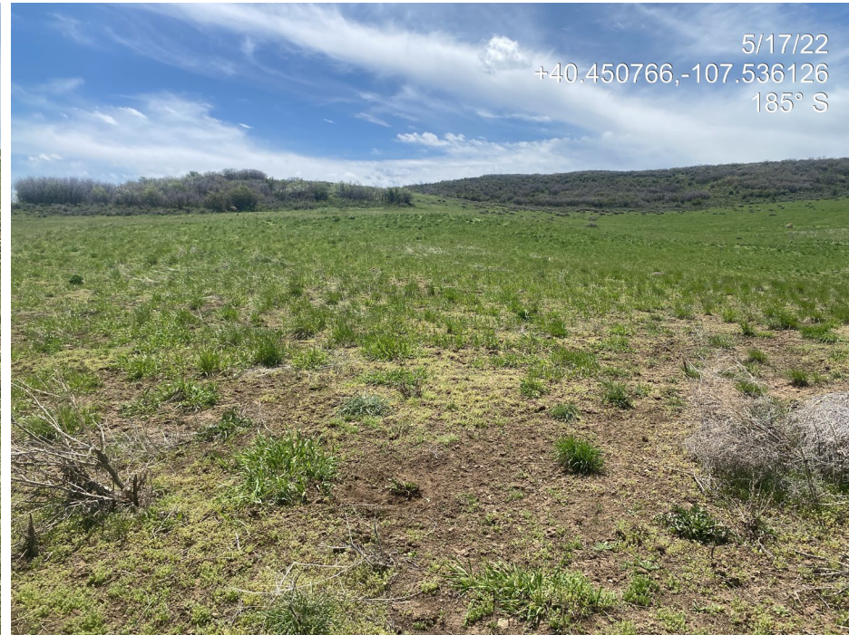
Photo 9. Photo taken from the east of the Location in the interim area shows interim areas in the middleground dominated by perennial grasses. The foreground shows areas of poor perennial grass establishment and greater density of annual undesirable plant species/weeds and noxious weeds.