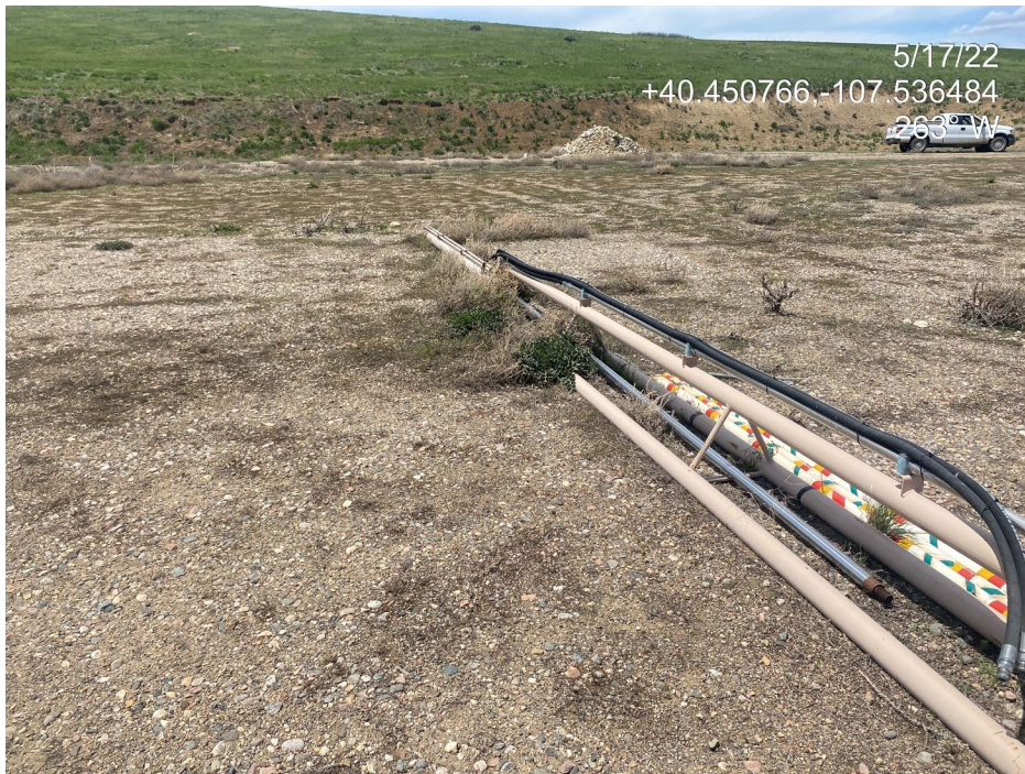
Photo 4. Photo taken from the center of the Location shows storage of unused equipment.