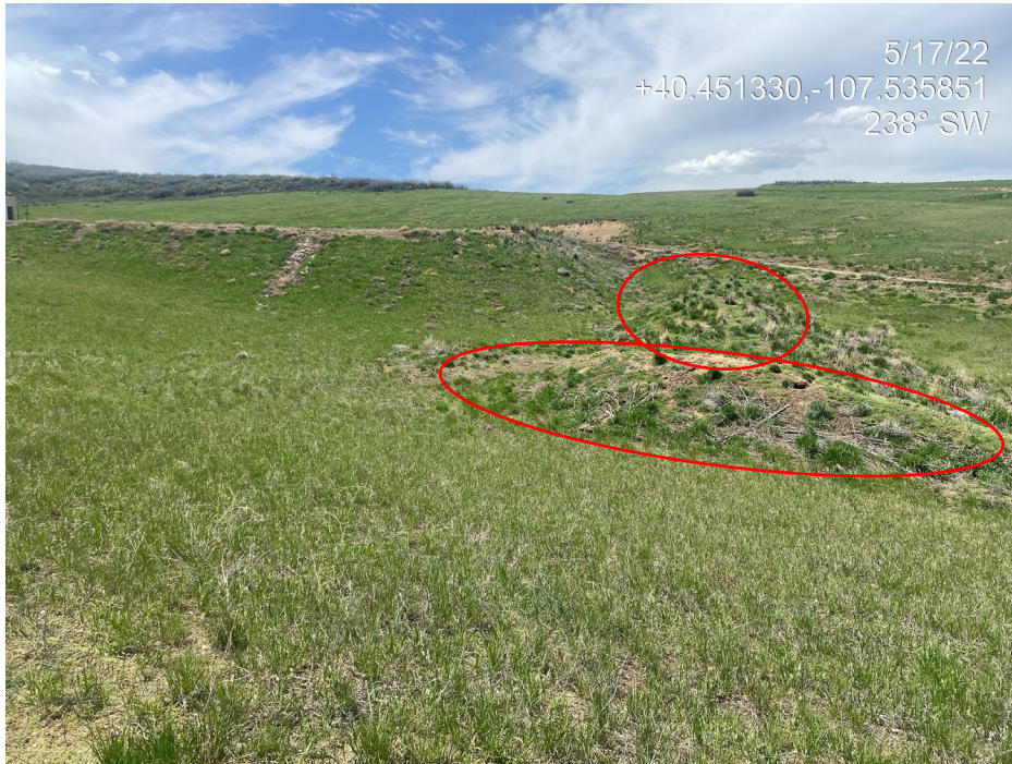
Photo 8. Photo taken from the northeast of the Location shows interim areas dominated by perennial grasses. Photo also shows berms with poor perennial grass establishment and greater density of annual undesirable plant species/weeds and noxious weeds.