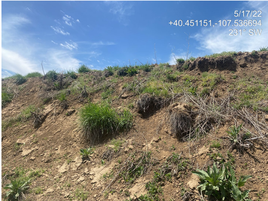
Photo 10. Photo taken from the cut slope to the west of the Location shows erosion. Pedestals are forming on the slope and undercutting and lateral erosion is resulting in exposed roots and vegetation and soil loss from the area above/to the west of the cut. Photo also shows noxious weeds.