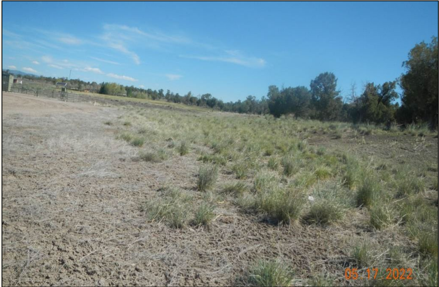
Photo 2. View of the eastern project area from the southeastern corner facing northward. Revegetation is progressing with western wheatgrass and crested wheatgrass.