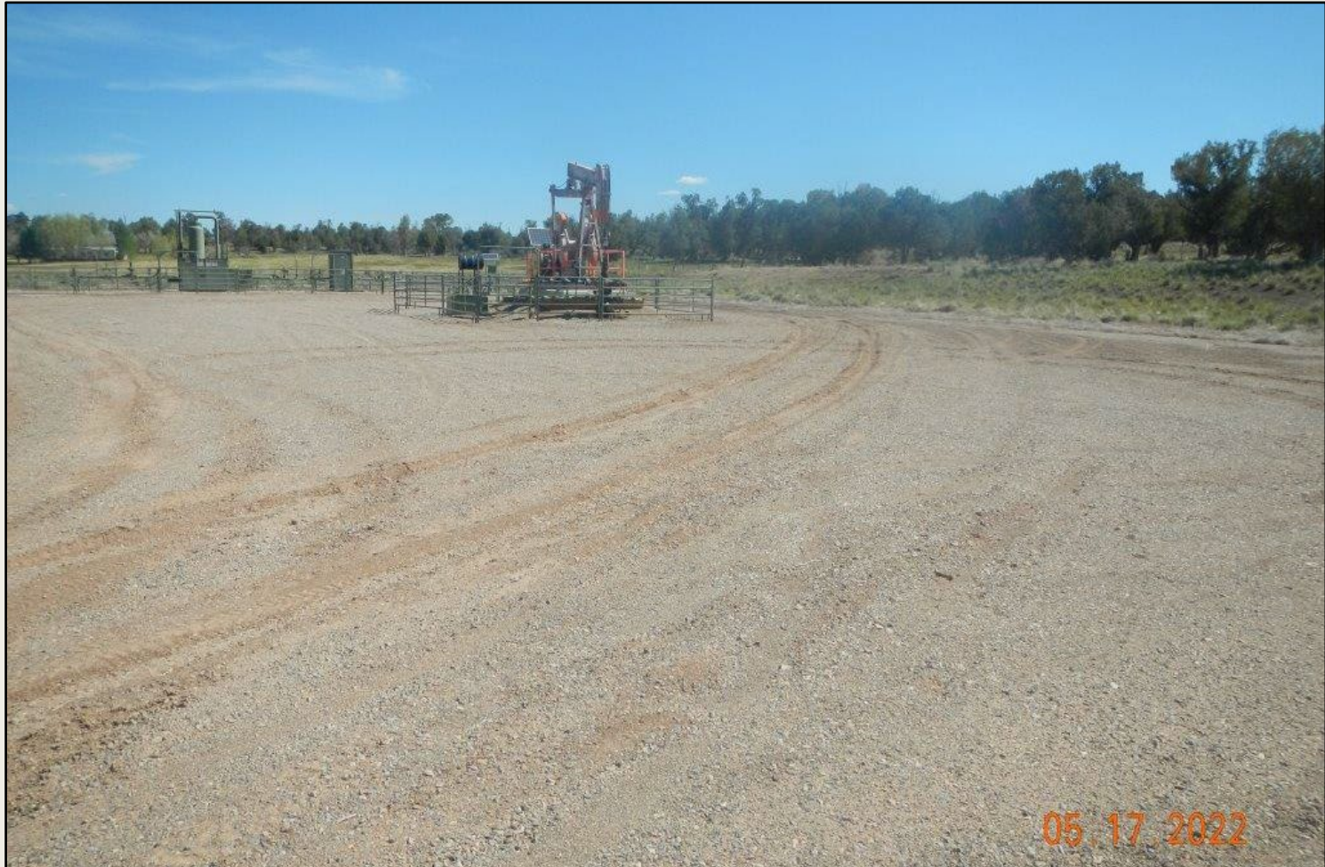
Photo 1. View of the project area from the well pad entrance facing center.