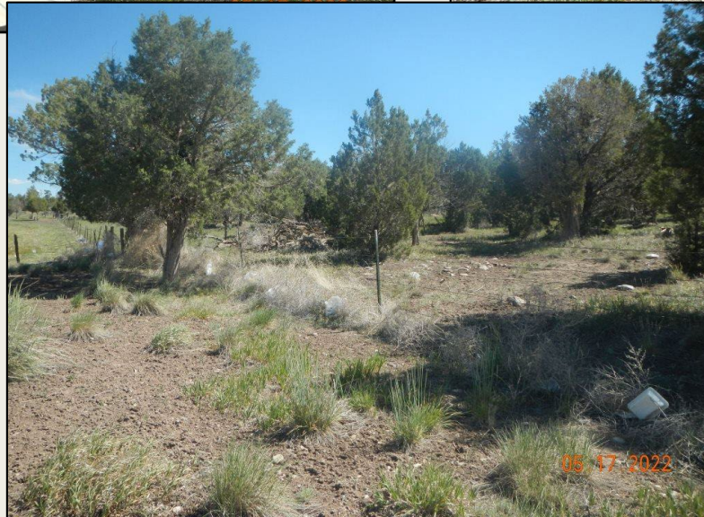
Photos 4-6. View of the trash and weed debris within the interim reclamation area and along the eastern fenceline.