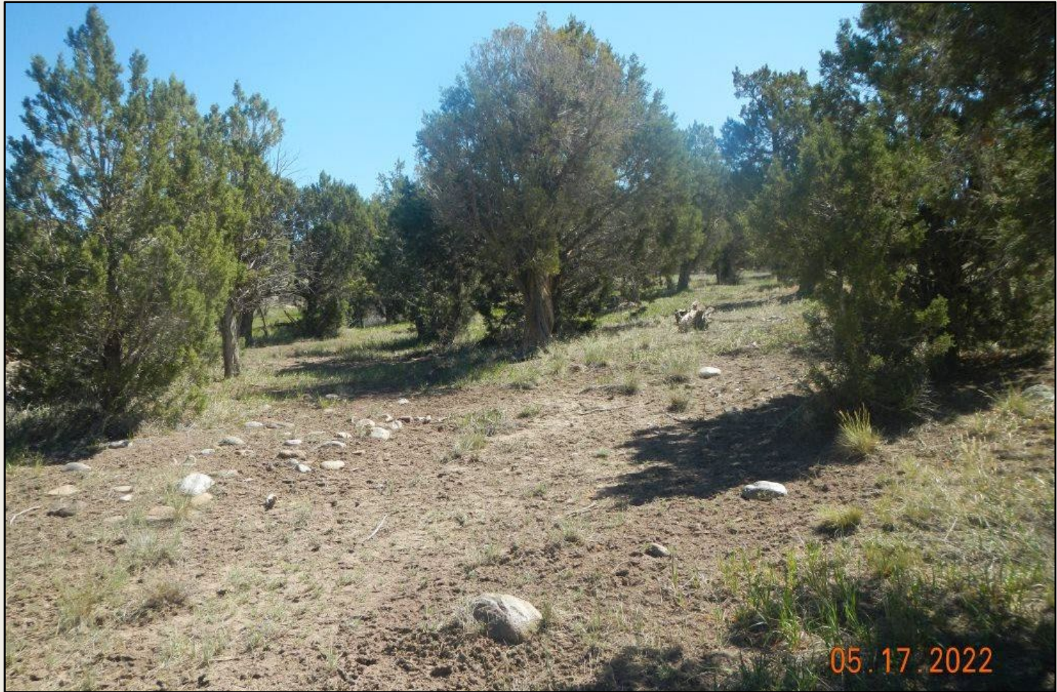
Photo 7. View of the reference area comprised of pinyon and juniper woodland with western wheatgrass and smooth brome observed in the understory along with Indian ricegrass and prickly pear.