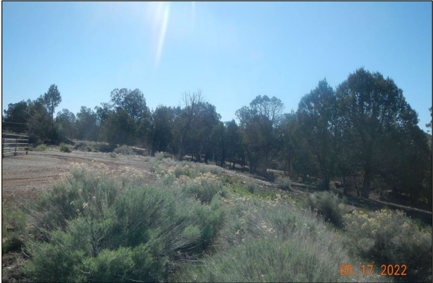
Photo 2. View of the southern project area from the southeastern corner facing westward. Revegetation is progressing here, largely with rubber rabbitbrush and western wheatgrass.