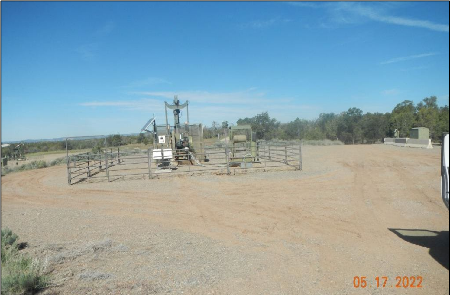
Photo 1. View of the project area from the eastern well pad entrance facing center.