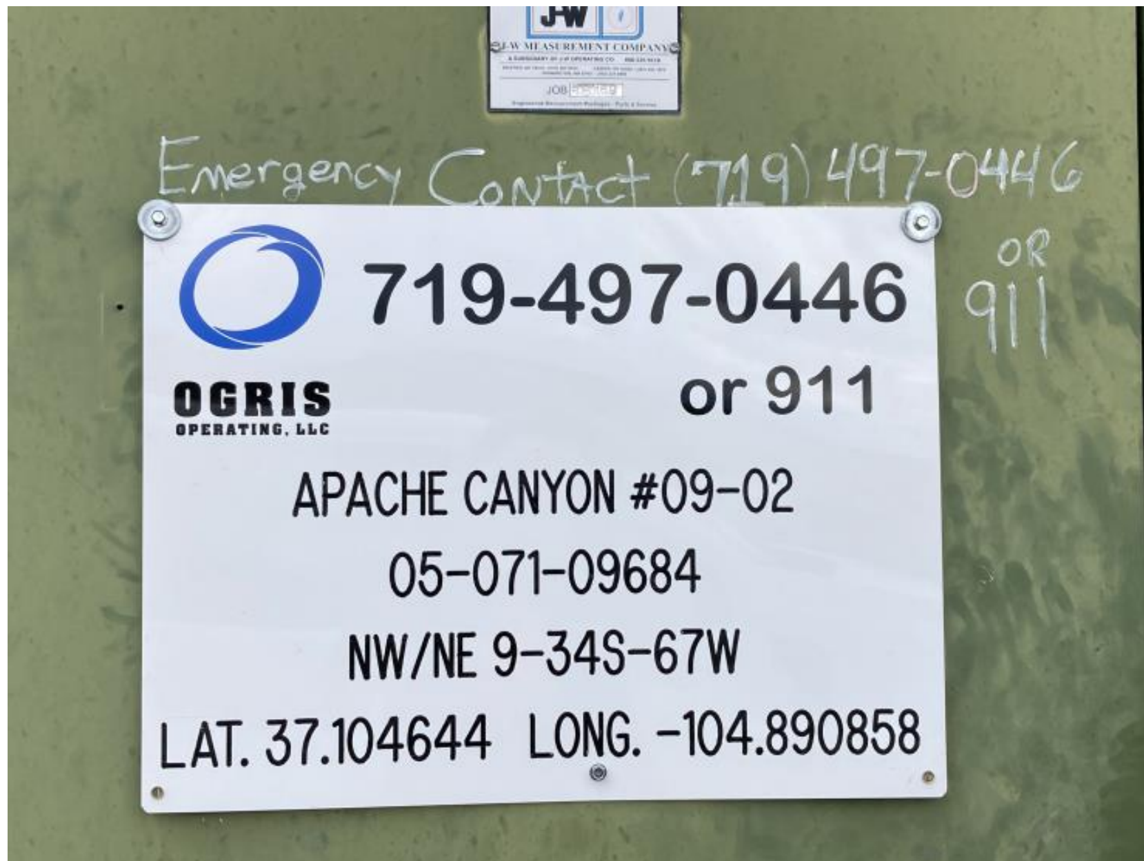
PHOTO 1: THE NEW LOCATION SIGN WAS POSTED ON THE DOOR OF THE SEPARATOR HOUSE.

APACHE CANYON 09-02 API# 05-071-09684 – OGRIS OPERATING OGCC OPERATOR NUMBER 10758 - DATE: MARCH 19, 2022 CORRECTIVE ACTIONS COMPLETED REGARDING COGCC FIR DOCUMENT #695106011