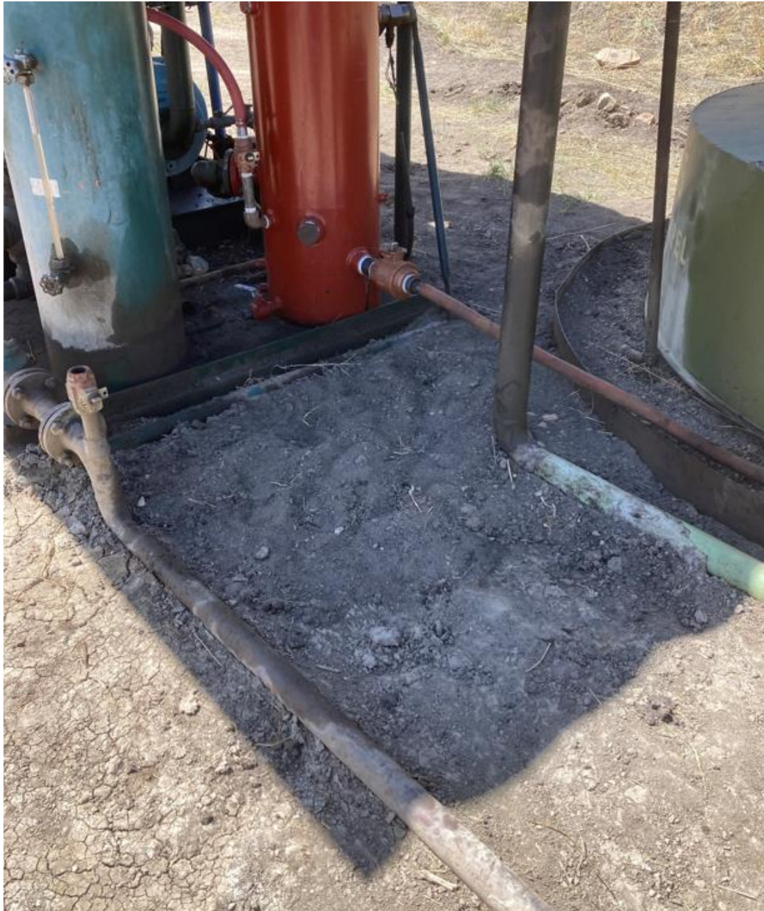
PHOTO 2: THE OILY WATER AND IMPACTED SOIL NEAR THE COMPRESSOR WAS CLEANED UP AND REMOVED FROM LOCATION. MAINTENANCE HAS BEEN PERFORMED AND THE SELF INSPECTION PROCESS HAS BEEN REVIEWED.

APACHE CANYON 09-02 API# 05-071-09684 – OGRIS OPERATING OGCC OPERATOR NUMBER 10758 - DATE: MARCH 19, 2022 CORRECTIVE ACTIONS COMPLETED REGARDING COGCC FIR DOCUMENT #695106011