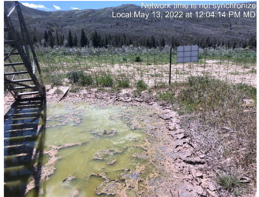
Photo #6710 Secondary containment is not sufficiently impervious to contain spilled or released materials.