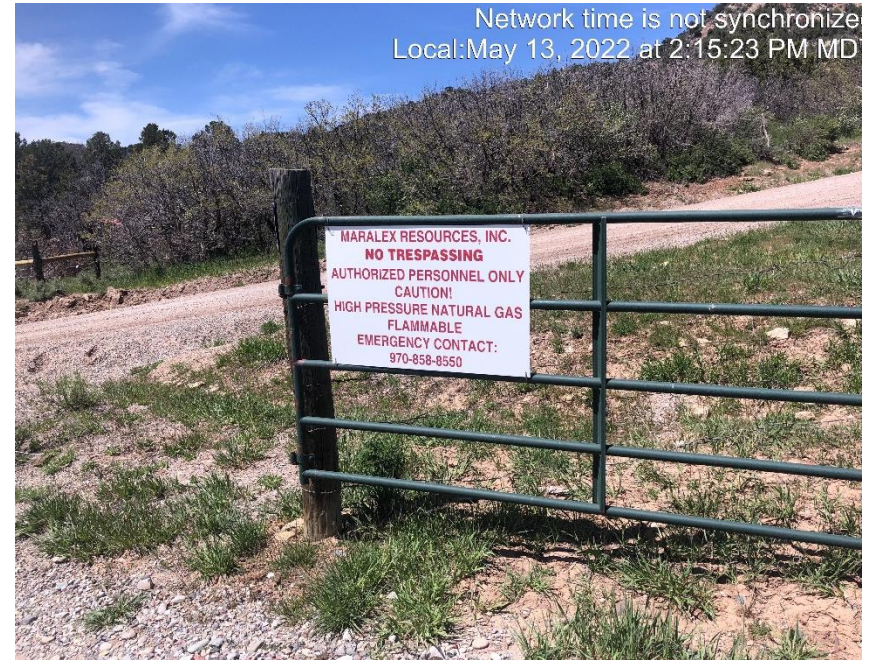
Photo #6721 Local emergency contact number not posted. Number that is posted is Maralex western slope office number.