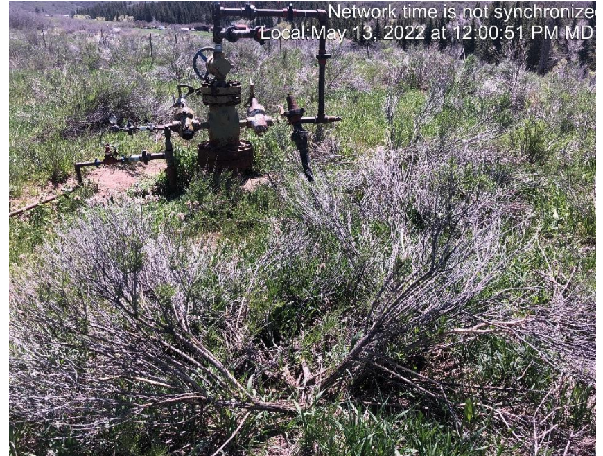
Photo #6706 Multiple places with undesirable plant species encroaching on equipment.