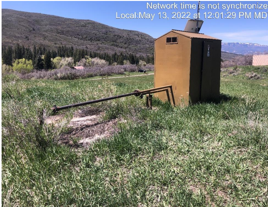
Photo #67075 Multiple places with undesirable plant species encroaching on equipment.