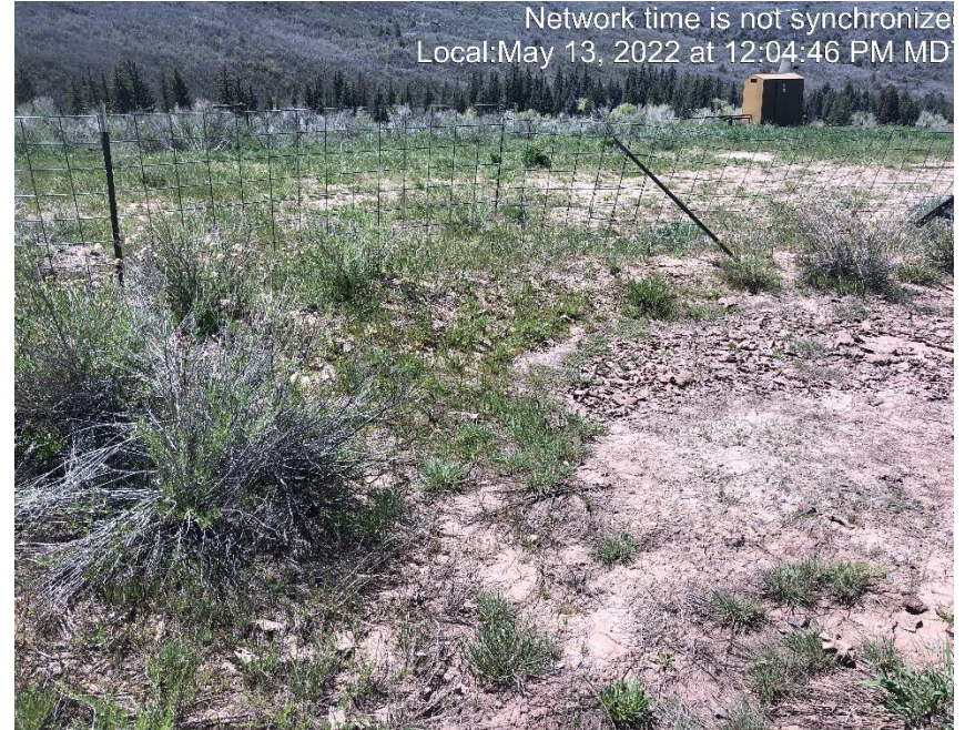
Photo #6712 Secondary containment is not sufficiently impervious to contain spilled or released materials