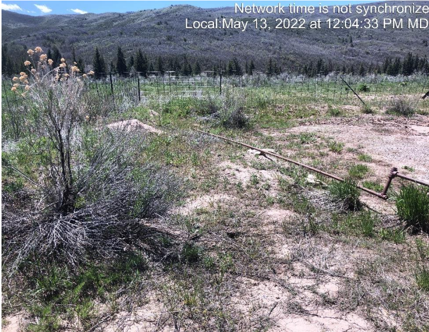
Photo #6711 Secondary containment is not sufficiently impervious to contain spilled or released materials.