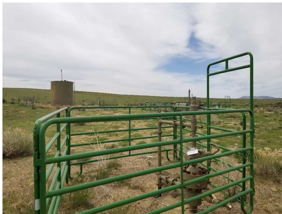
Photo 1. Overview of location taken facing east.