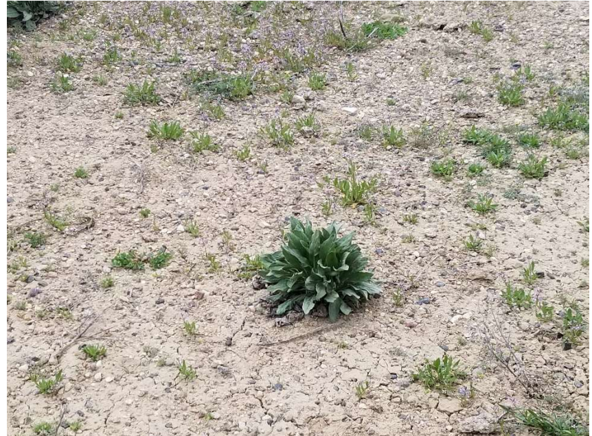
Photo 5. Noxious weeds on location.