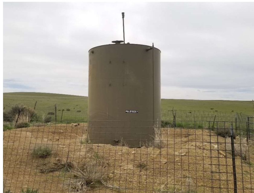
Photo 3. Incomplete tank label.