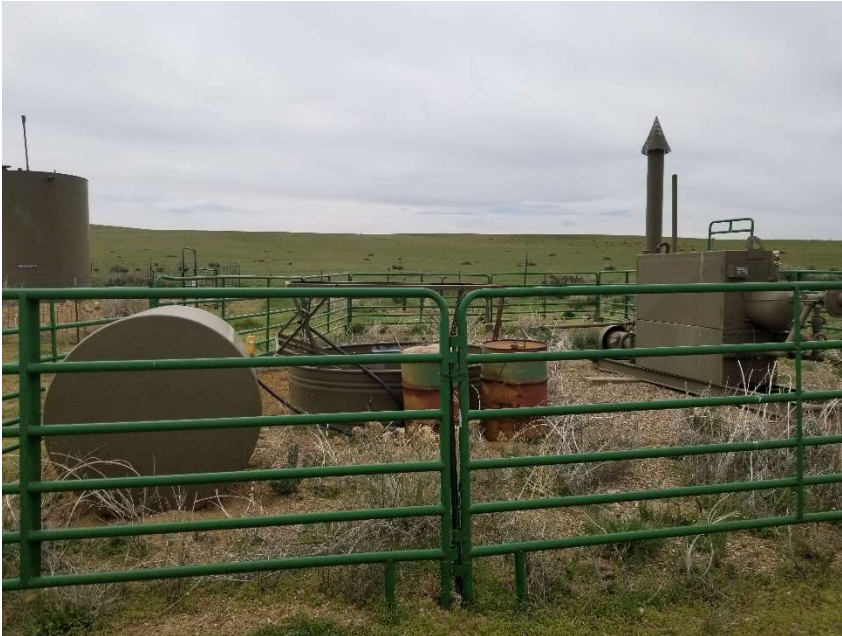
Photo 4. Tank knocked over. Containers without secondary containment.