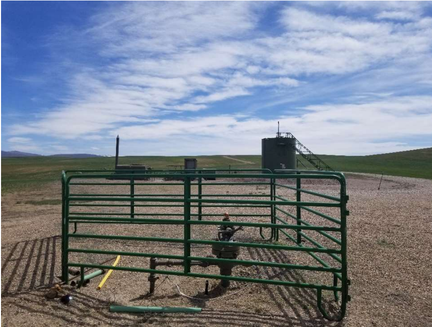
Photo 1. Overview of location taken facing east.