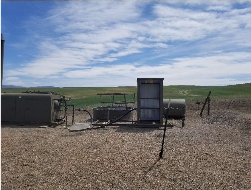
Photo 7. Meter run with no equipment. Knocked over tank to right and behind meter housing. Equipment parts have become debris to the left of the housing.