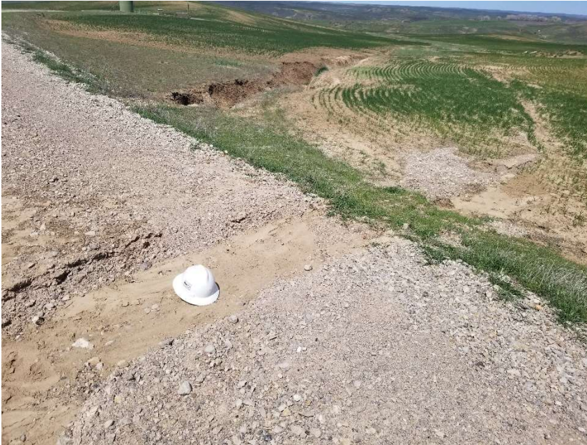
Photo 5. Photo of road damage with sediment transport into field visible in the background.