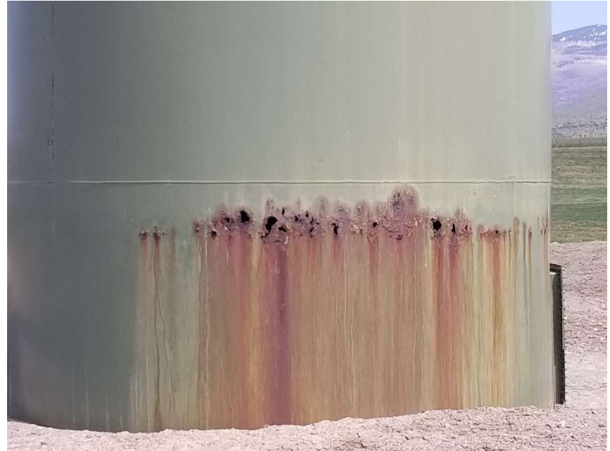
Photo 10. Close up of holes in produced water tank.