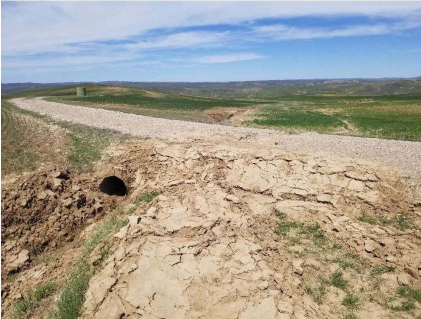
Photo 3. Culvert that appears damaged or overwhelmed.