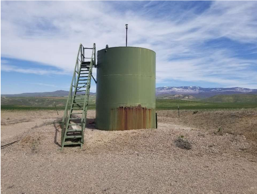
Photo 9. Holes in produced water tank.