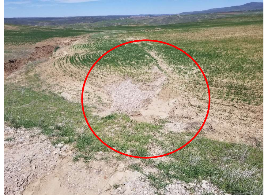
Photo 6. Close up of sediment transported off of access road.