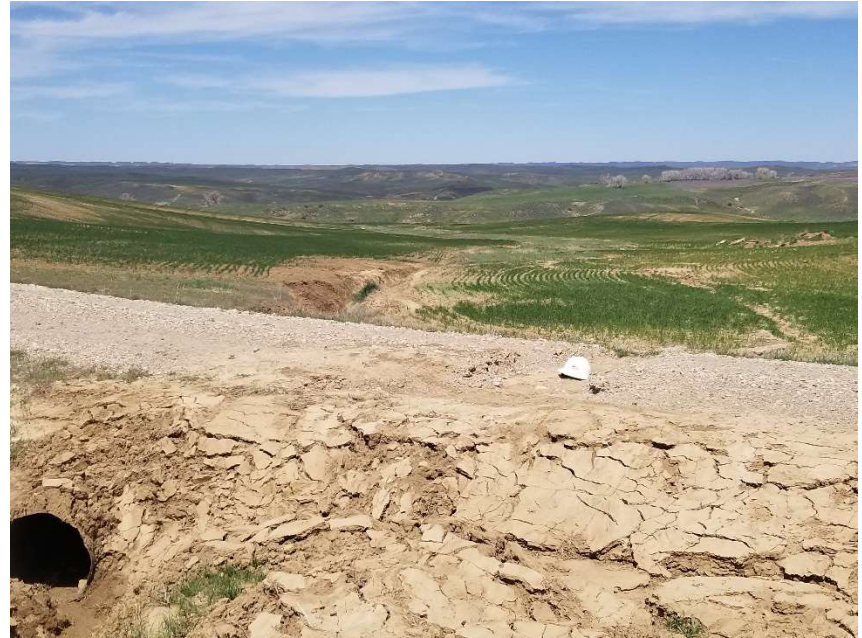
Photo 4. Culvert with road damage. Hard hat for scale.