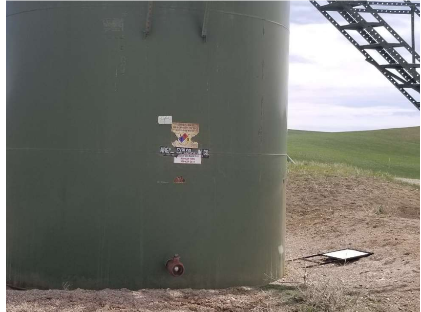
Photo 8. Peeling tank label. Knocked over battery sign.