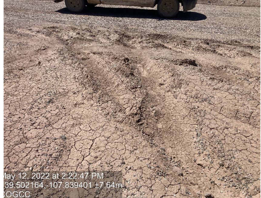
Lack of stabilization/compaction