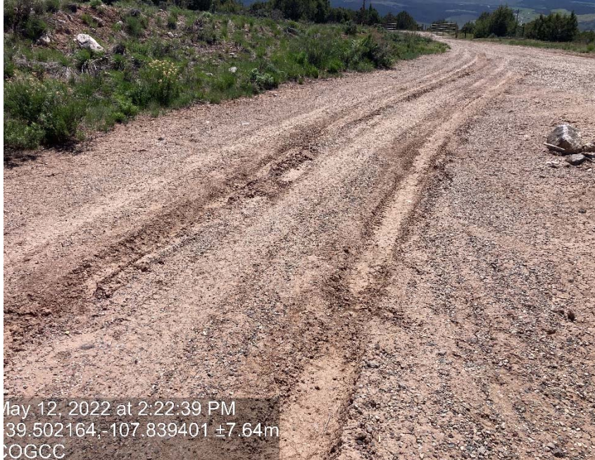
Lack of stabilization/compaction