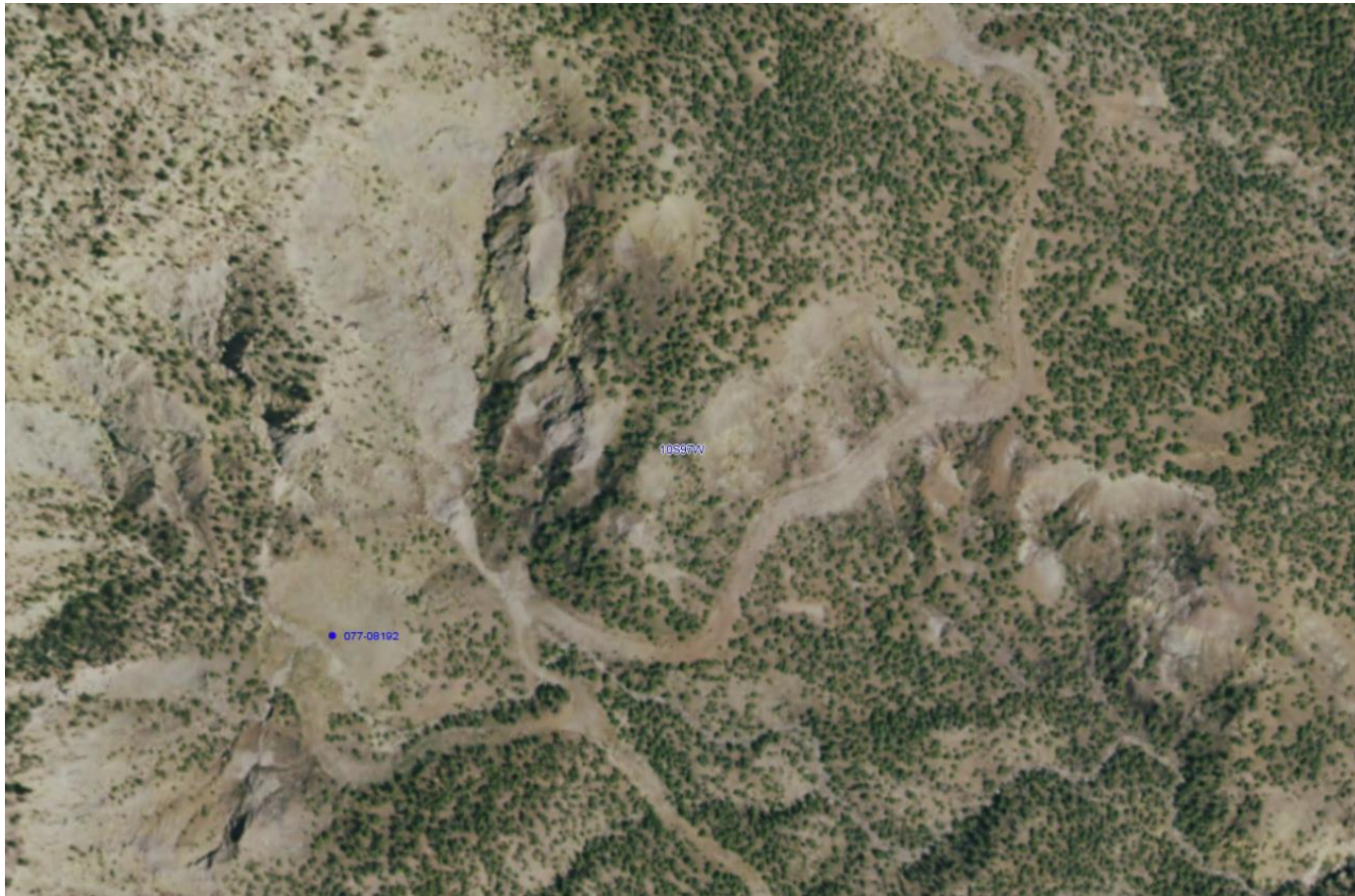
Photo 2: 2019 COGIS aerial image of the Location and access road. Access road did not pre-exist the O&G Location.