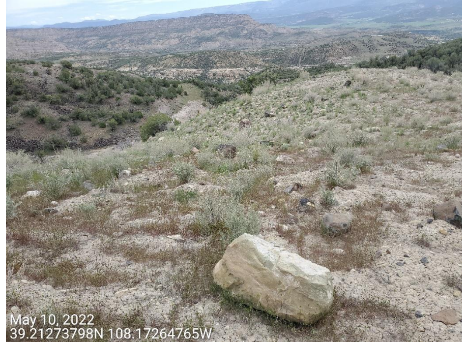
Photo 3: Photos 3-4 taken from the Location. Photos provide an overview of the Location facing north, east, south and west. Shrub establishment evident, however Location remains predominantly bare with undesirable and noxious weeds such as cheatgrass, annual wheatgrass and Halogeton.