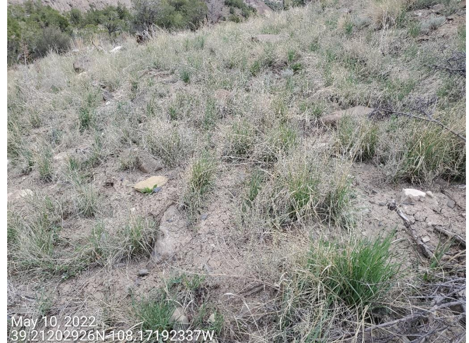
Photo 5: Photo left taken from the Location, facing south. Photo shows ~600 stretch of access road that was recontoured/regraded and reclaimed in accordance with 1004 rules. Photo right shows vegetation at reclaimed access road appears to meet 1004 standards.