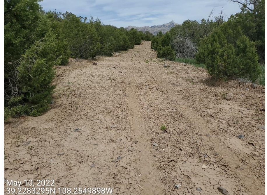
Photo 6: Photos examples showing remaining access road has not been recontoured/regraded and reclaimed in accordance with 1004 rules.